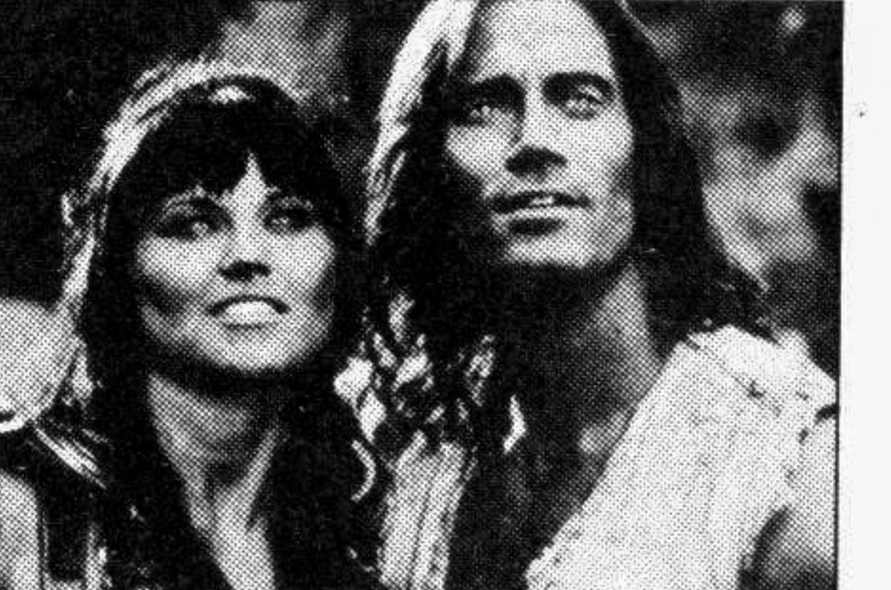
Xena on Star World at 6pm

8:00 Extremists 8:30 Very Radical 9:00 Free Ride 9:30 Jnights Warriors