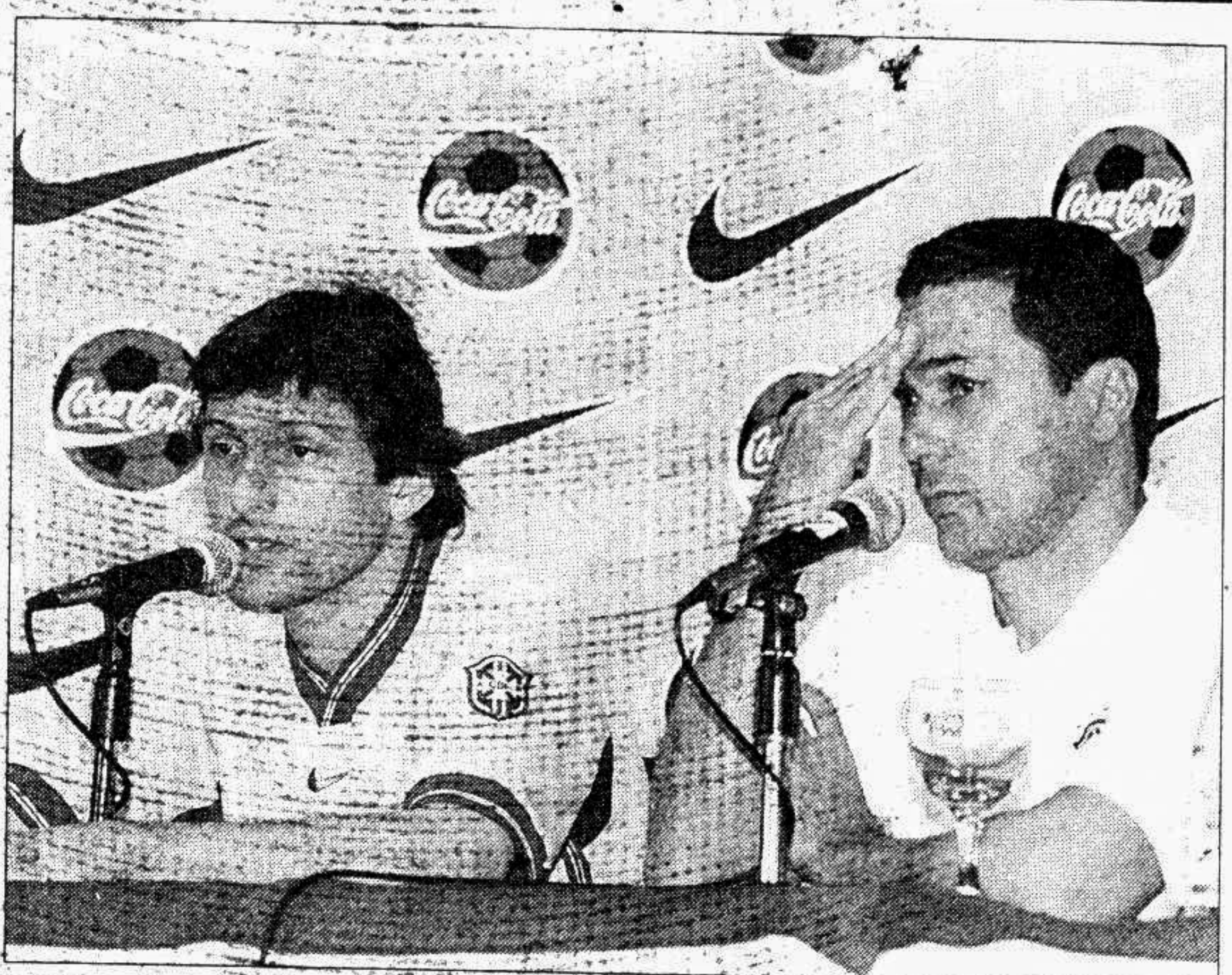
Brazilian international Leonardo (L) talking to the press during a conference in Foz de Iguaçu on June 24. Team coach Wanderley Luxemburgo is to his left.

"At Paris I didn't have a problem but I did with PSG. It is very easy to find a scapegoat. If everyone thinks it's me, I will accept it, but both my mother and father said in case of a problem, it's a collective responsibility," said the Italian who has signed a three year contract with Monaco.