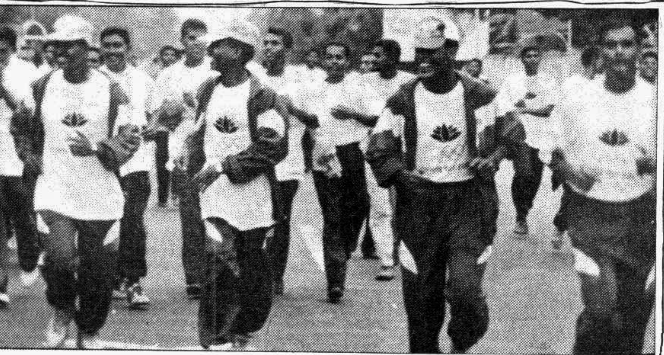
Participants of the Olympic Day Run set off from the Army Stadium in the capital yesterday.