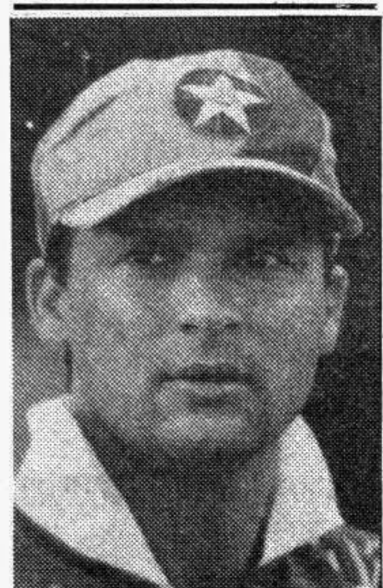
Moin Khan (Pakistan cricket vice-captain) "It was disappointing after we played so well in the World Cup. Now the fans must realise we are the number two team in the world."