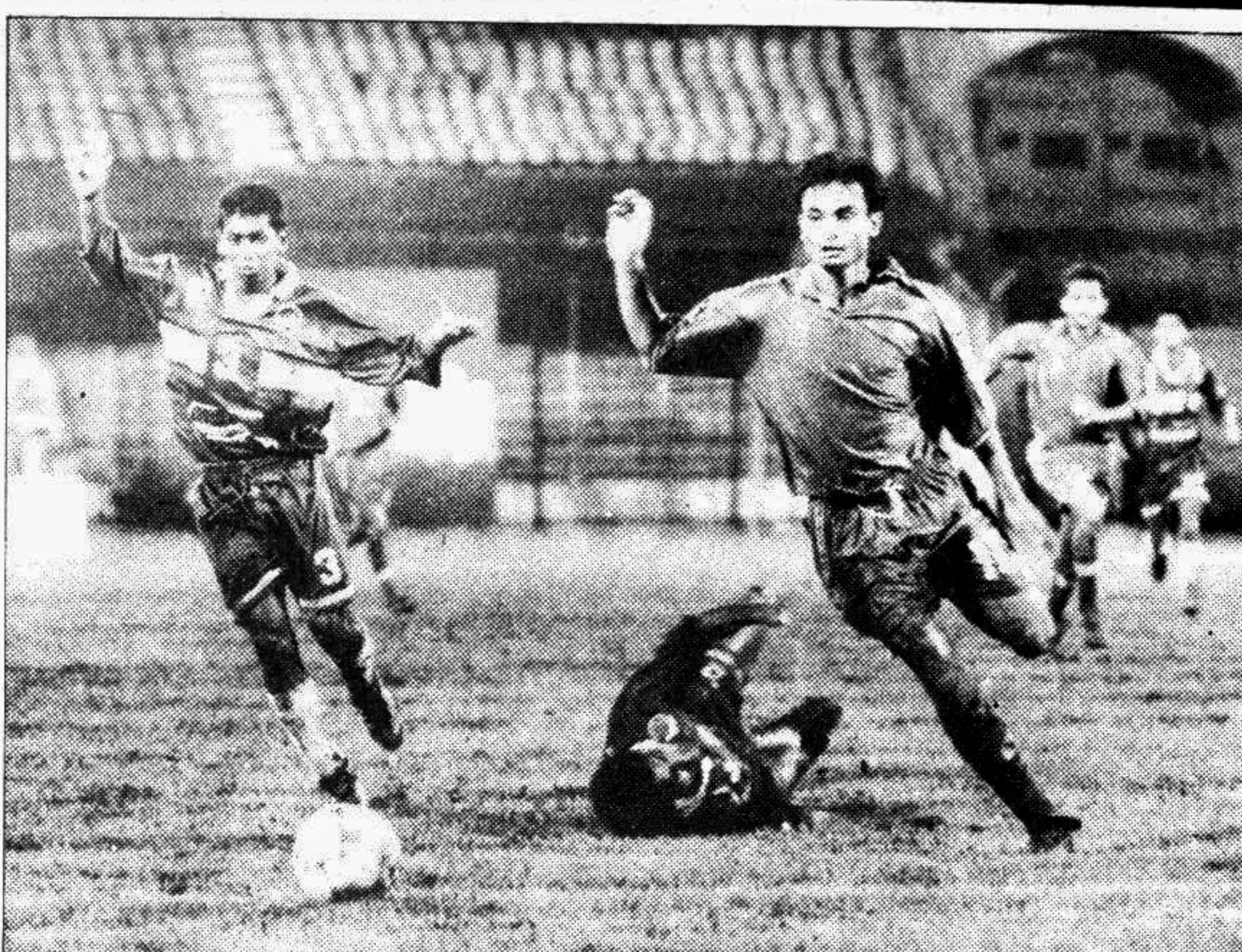
Action from yesterday's Premier Division football league match between Muktiyoddha Sangsad and Badda Jagorani at the Bangabandhu National Stadium.