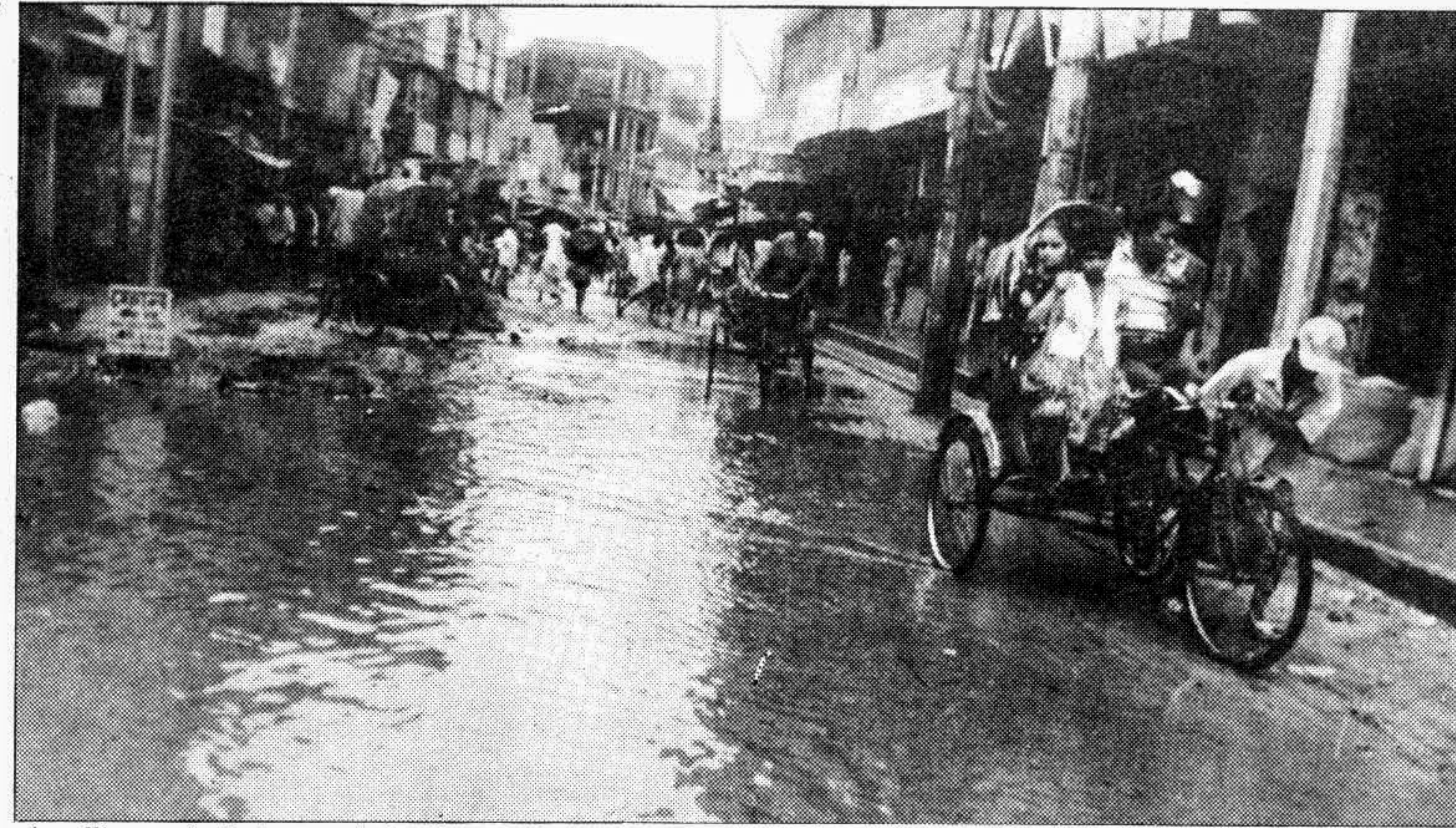
Appalling road digging coupled with waterlogging has made the narrow street at the city's north Goran a nightmarish proposition.

The bottom line is that as long no positive steps are taken to ease off the traffic pressure caused by the rising city population, there is no escape from the continuing distress that city commuters suffer when their destinations lie in the locations specified above.