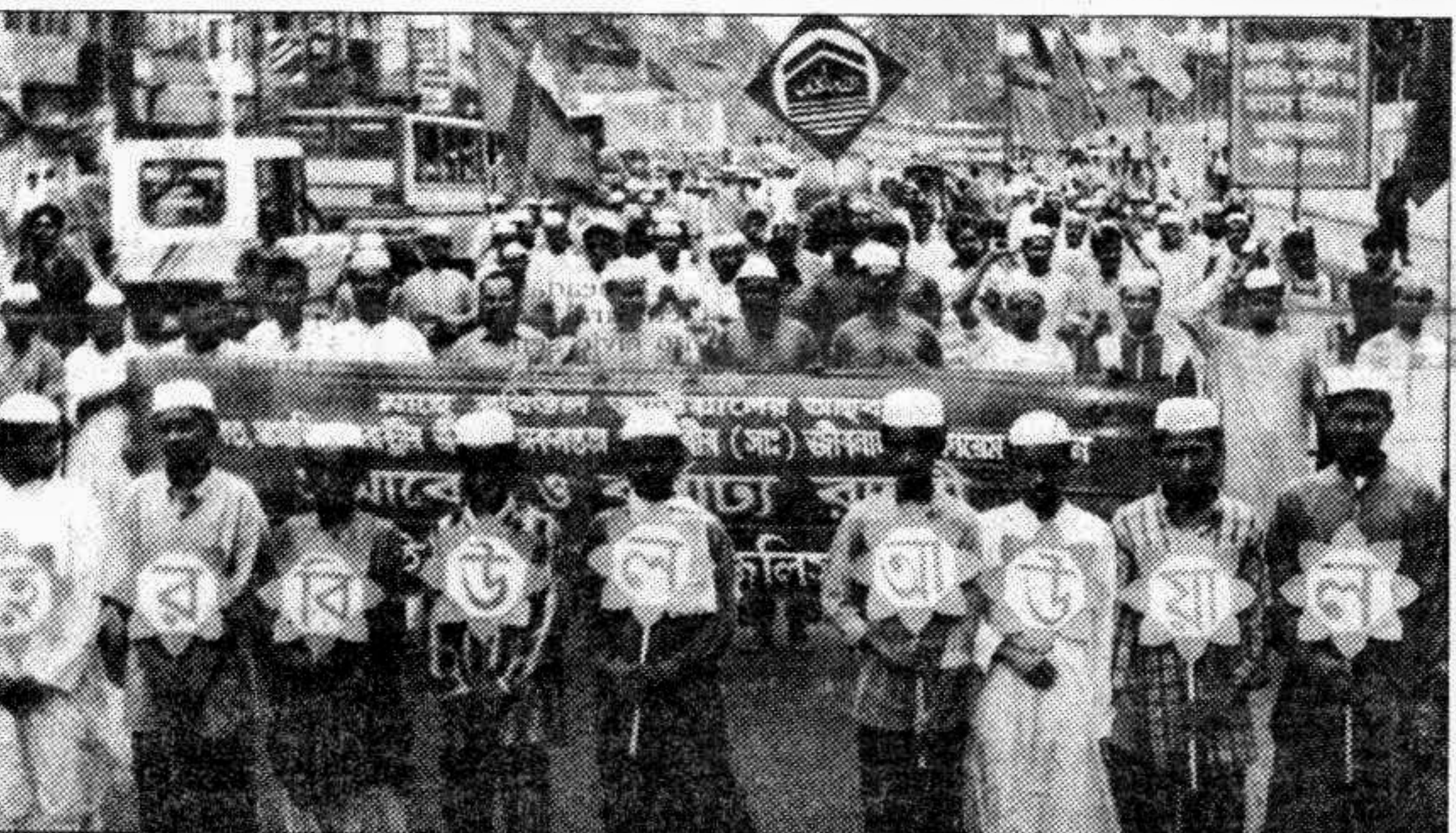
Islami Chhatra Majlish brought out a procession in the city yesterday on the occasion of Eid-e-Miladun Nabi.