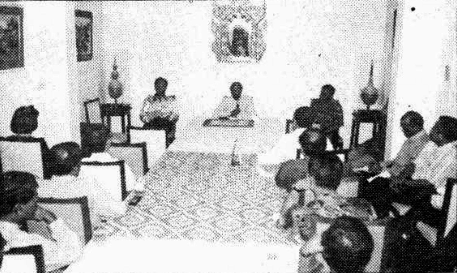
The Bangladesh-Thailand Friendship Association held its general meeting at the residence of Thai Ambassador in the city recently.