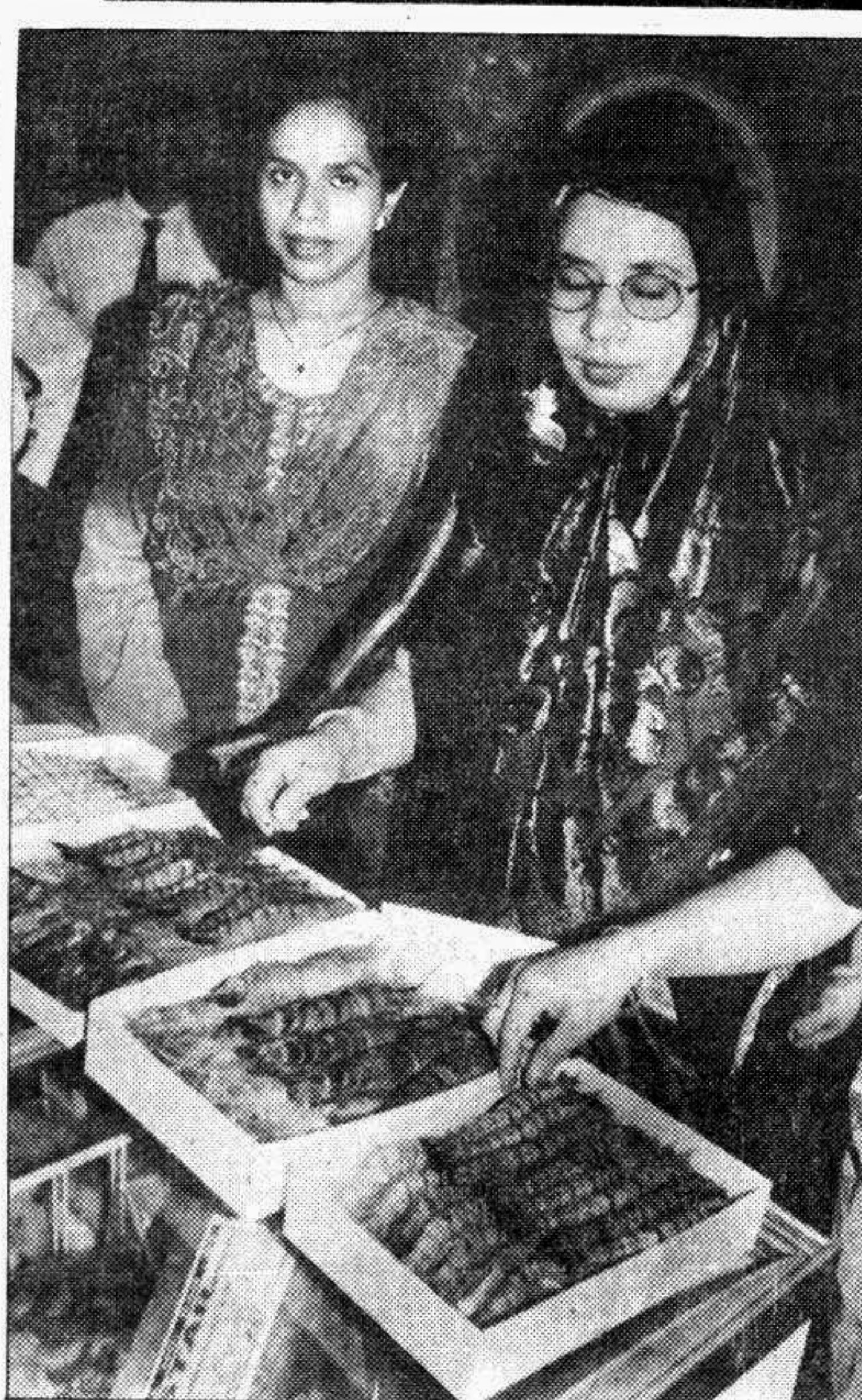
Visitors at the Sea Food exhibition that began at Hotel Sonargaon in the city yesterday.

On Friday, Karpal said that police repeatedly thwarted lawyers from meeting with Sukma during his detention last September. He also accused the magistrate, who took down Sukma's statement, of not taking necessary steps to ensure that Sukma had made the confession out of his own volition.