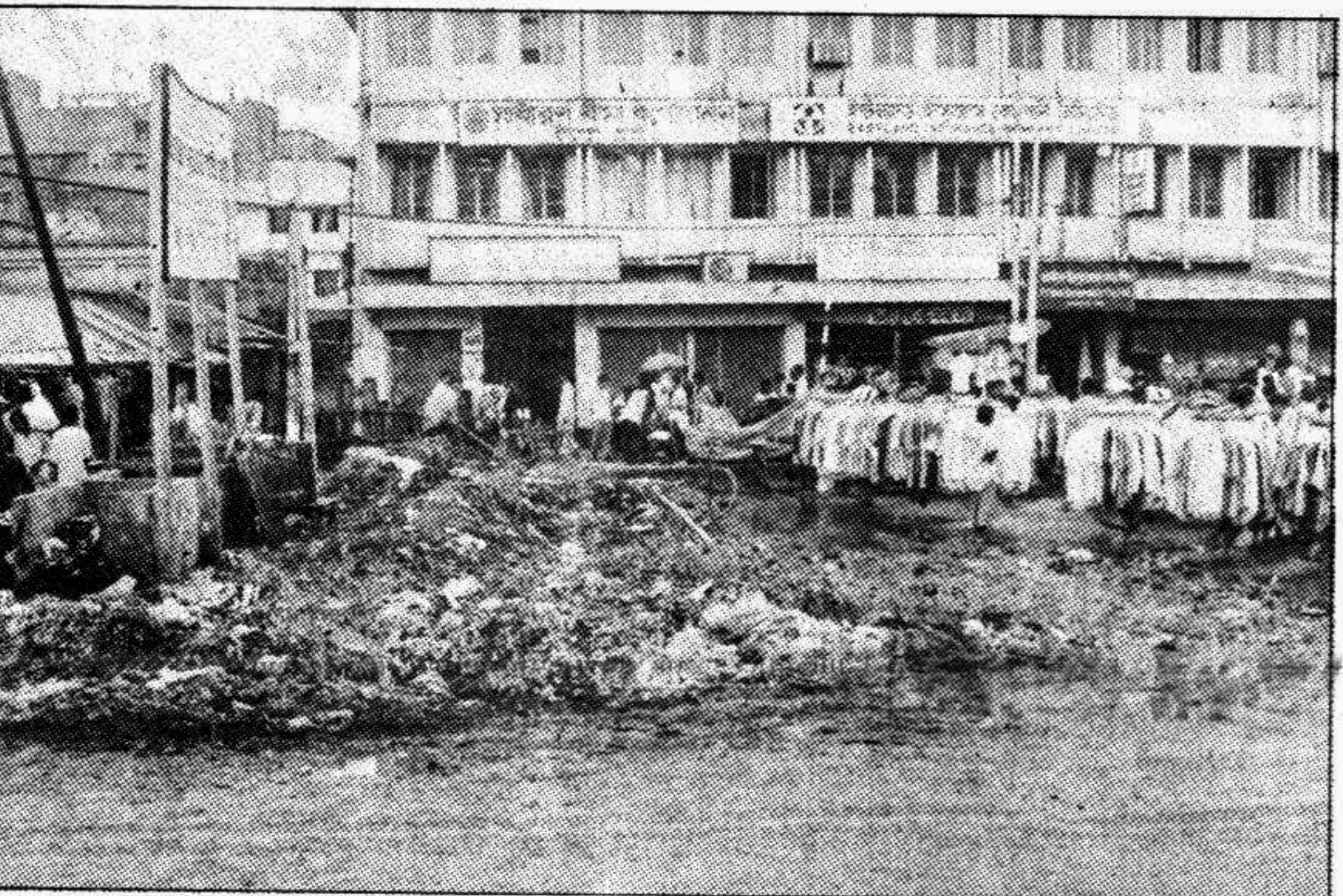
Littered garbage in the Chamber Road area.

It was raining cats and dogs when the dacoits attacked the SP's house. However, the dacoits could not enter into the SP's house and fled away.