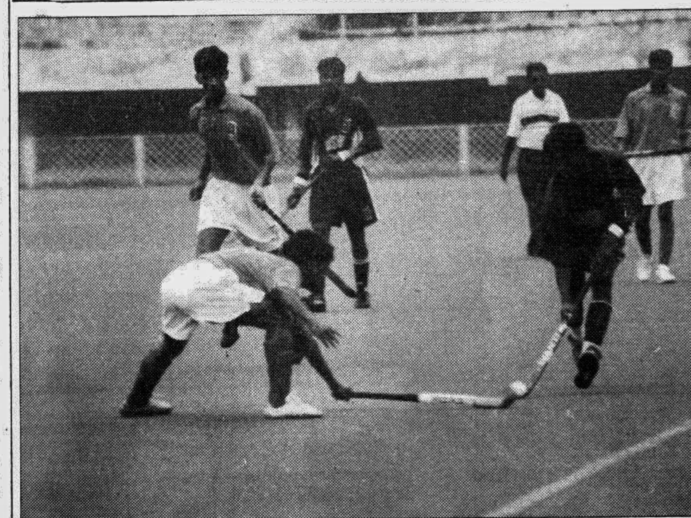
Action from yesterday's national hockey championship encounter between Patuakhali and Rajshahi at the Moulana Bhasani National Stadium.

According to Hadlee, England need to follow the example of World Cup winners Australia if they are to get back to the top in the world game.