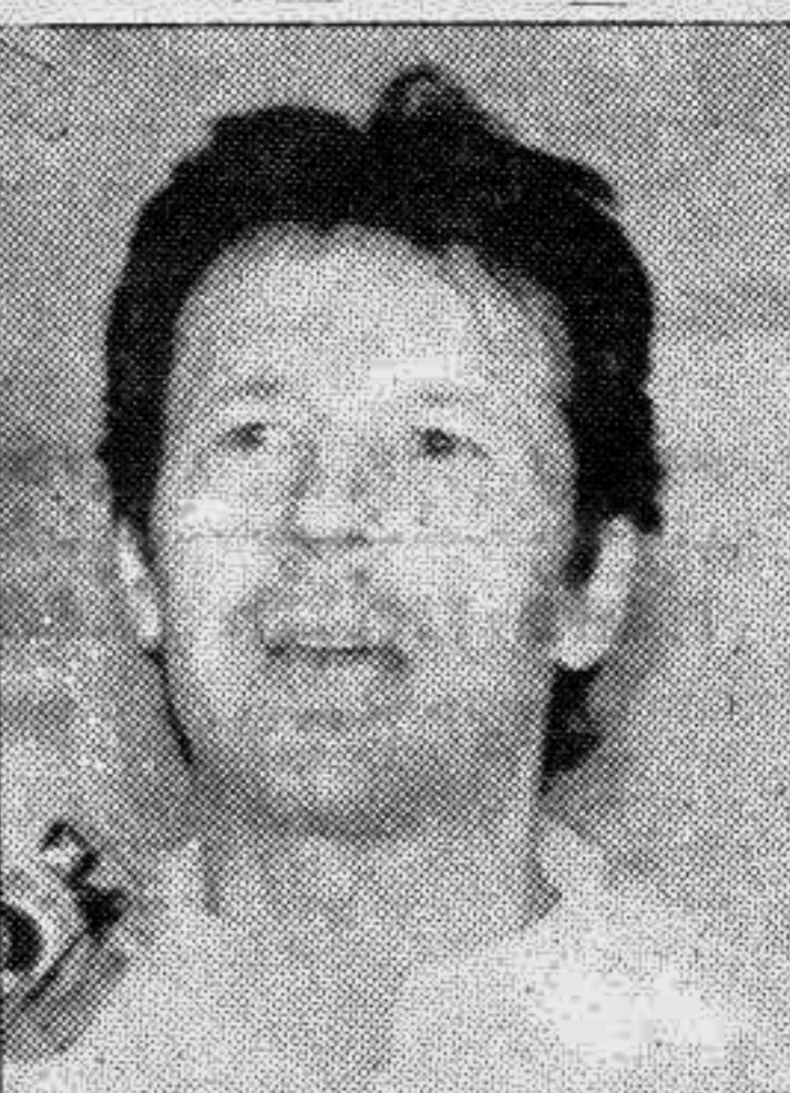
Imran Khan (Pakistan cricket legend) "If you are scared of losing, you can never win."