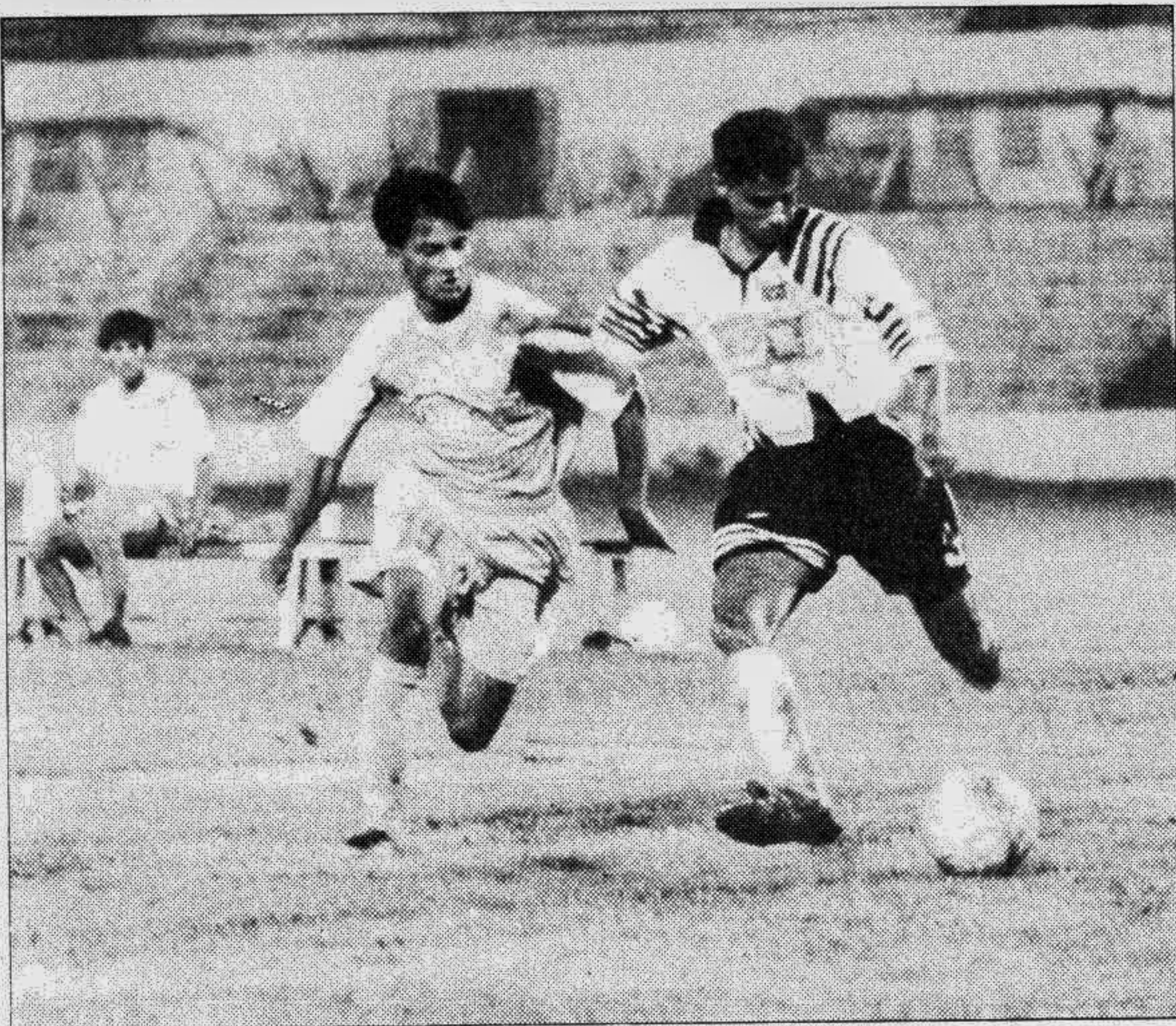
Scene from the Premier Division football league match between Abahani and Arambagh at the Bangabandhu National Stadium yesterday evening. The game ended 1-1.

TODAY'S MATCHES BRTC Sporting Club vs Dhanmondi Club (3 pm) Dhaka Wanderers vs Shantinagar Club (5 pm).