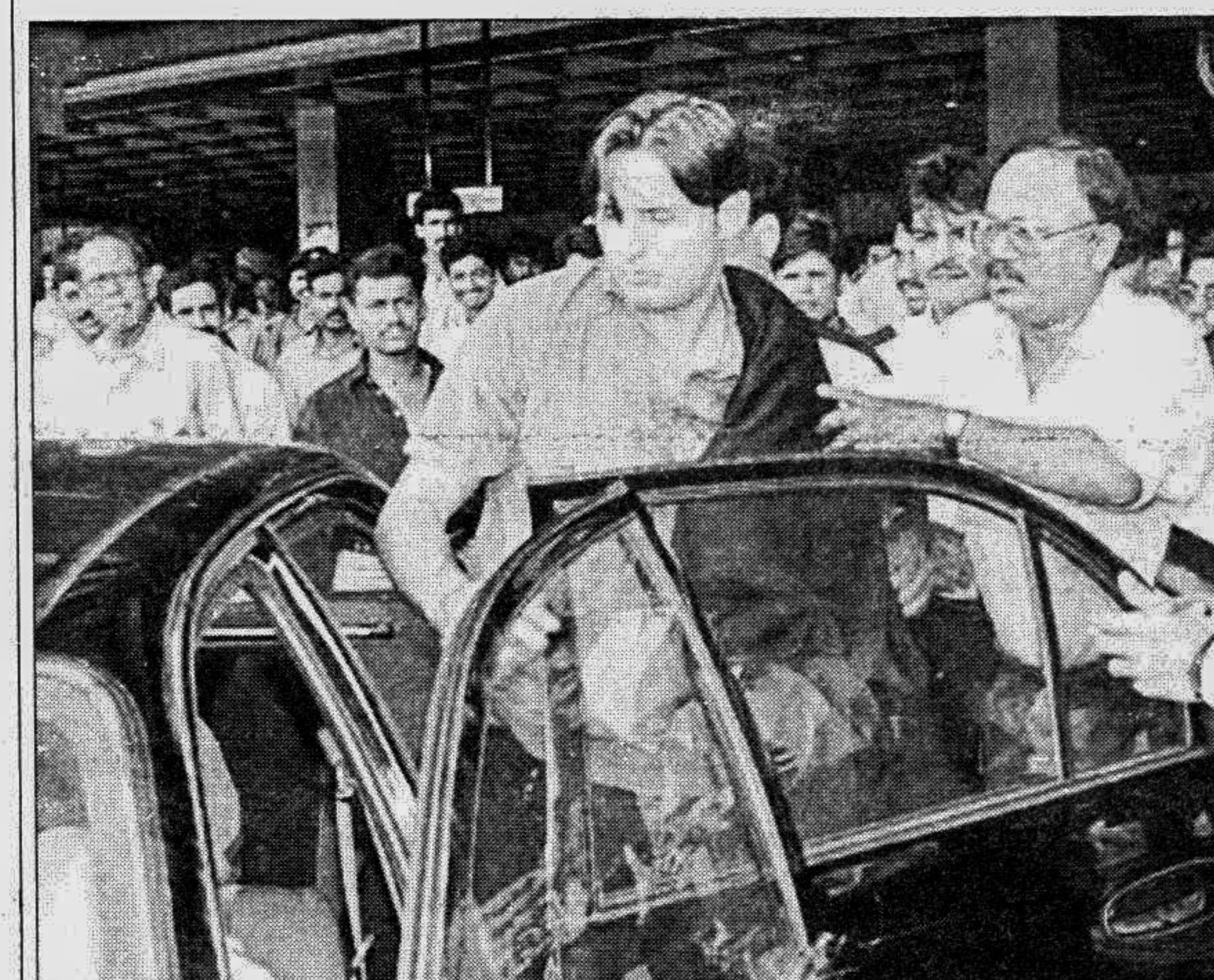
Pakistan cricketer Shahid Afridi being whisked away by a securityman after the team's arrival at Karachi Airport yesterday.