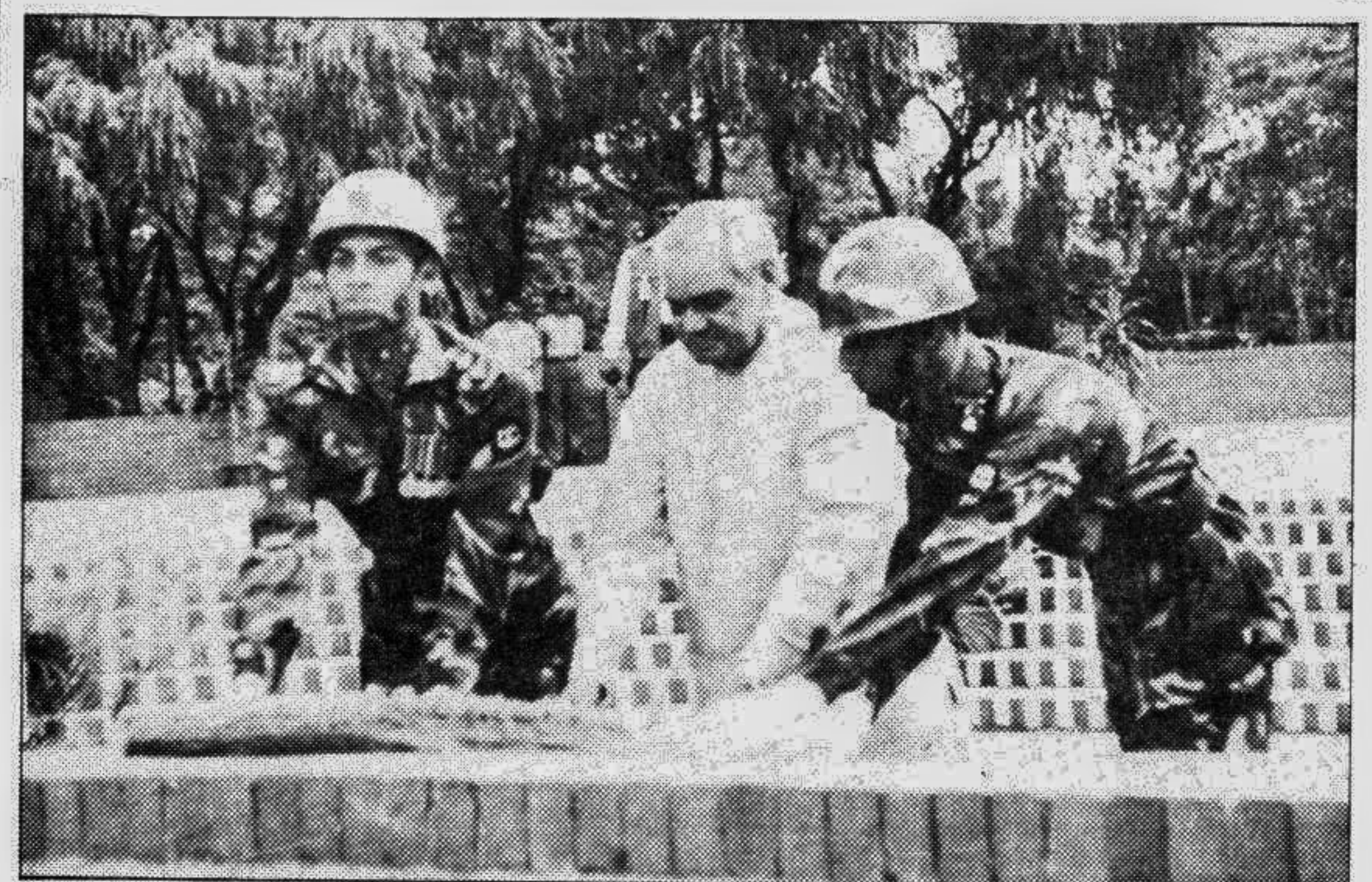
Visiting Indian Prime Minister Atal Behari Vajpayee placing a wreath at National Memorial at Savar yesterday.

Later, Sadekin was buried at the Mirpur Freedom Fighters' graveyard.