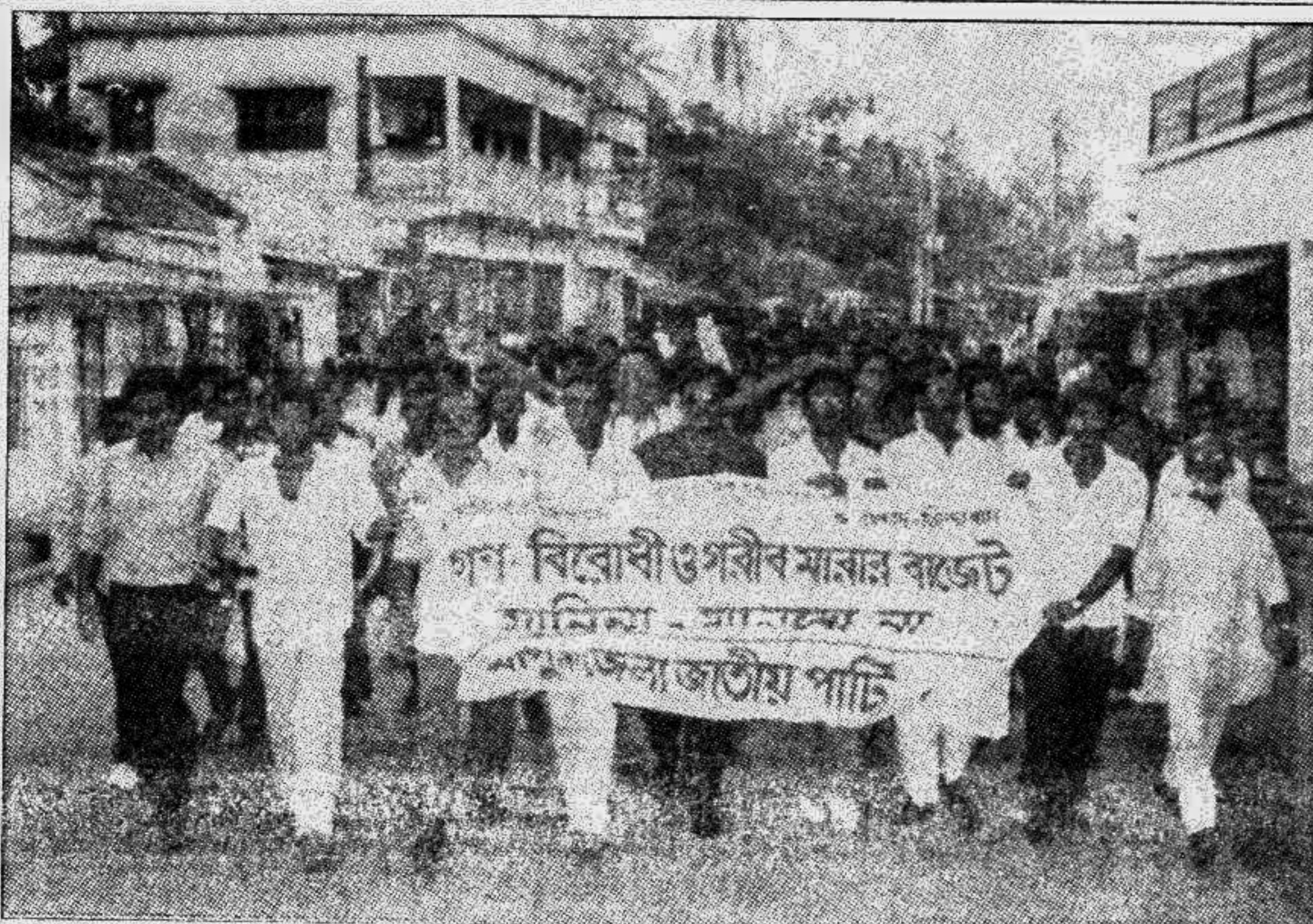
MAGURA: Jatiyo Party brought out a procession in the town recently opposing the proposed budget.

Afzal fell down and was run over by the same tempo and died on the spot.