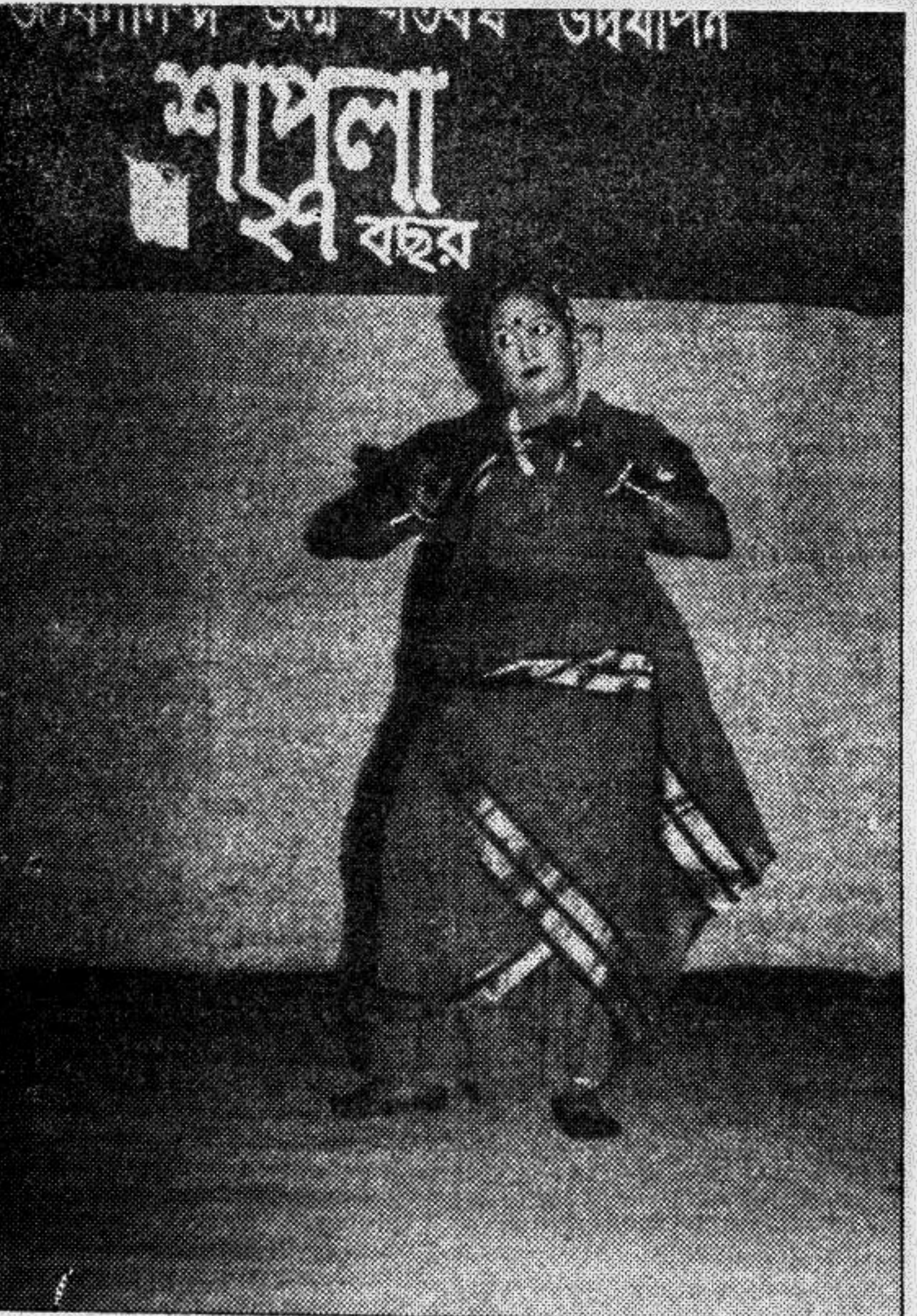
NARAYANGANJ: A colourful cultural programme was arranged recently on the occasion of the birth centenary of Nazrul-Zibanda by Shapla, a local cultural organisation at Ali Ahmed poura auditorium.

A WDB source said the government sanctioned Taka 26.50 lakh for implementation of the scheme. Work of the scheme is in full swing and more than 50 per cent work has already been completed. The scheme will help protect the people of the respective areas from flood water and save crops from water logging.