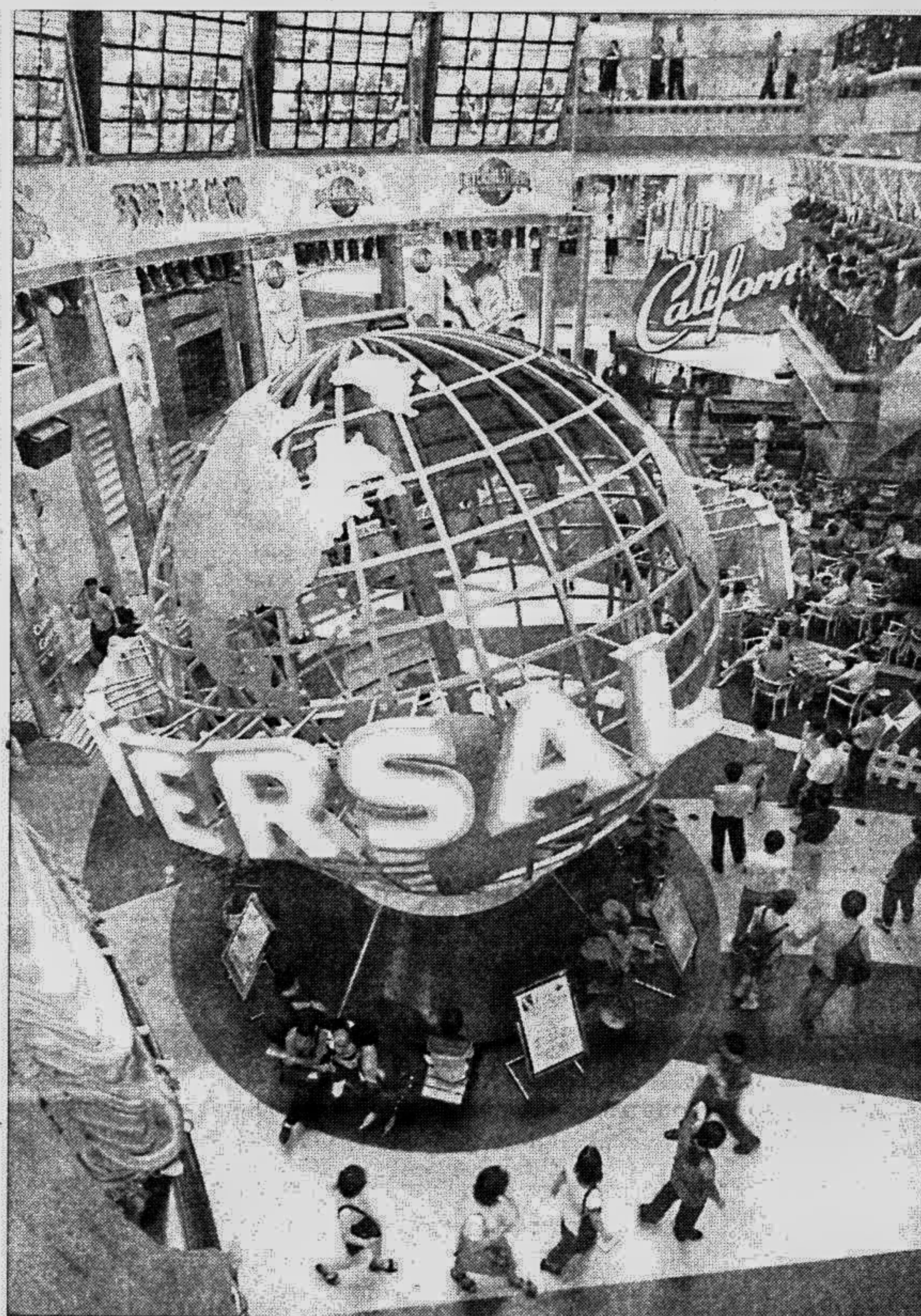
Beijingers visit an indoor movie theme park by US-based giant Universal Studios Saturday in one of the city's most modern shopping complexes. As China marches further down the road of openness and reform, Western culture, especially movies and music, has cast its spell on a large number of Chinese as communism is slowly eroded by capitalism, and all its trimmings.

"With the aus failure, prices have begun to go up again, hitting Tk 250 per maund. The price is expected to surge further."