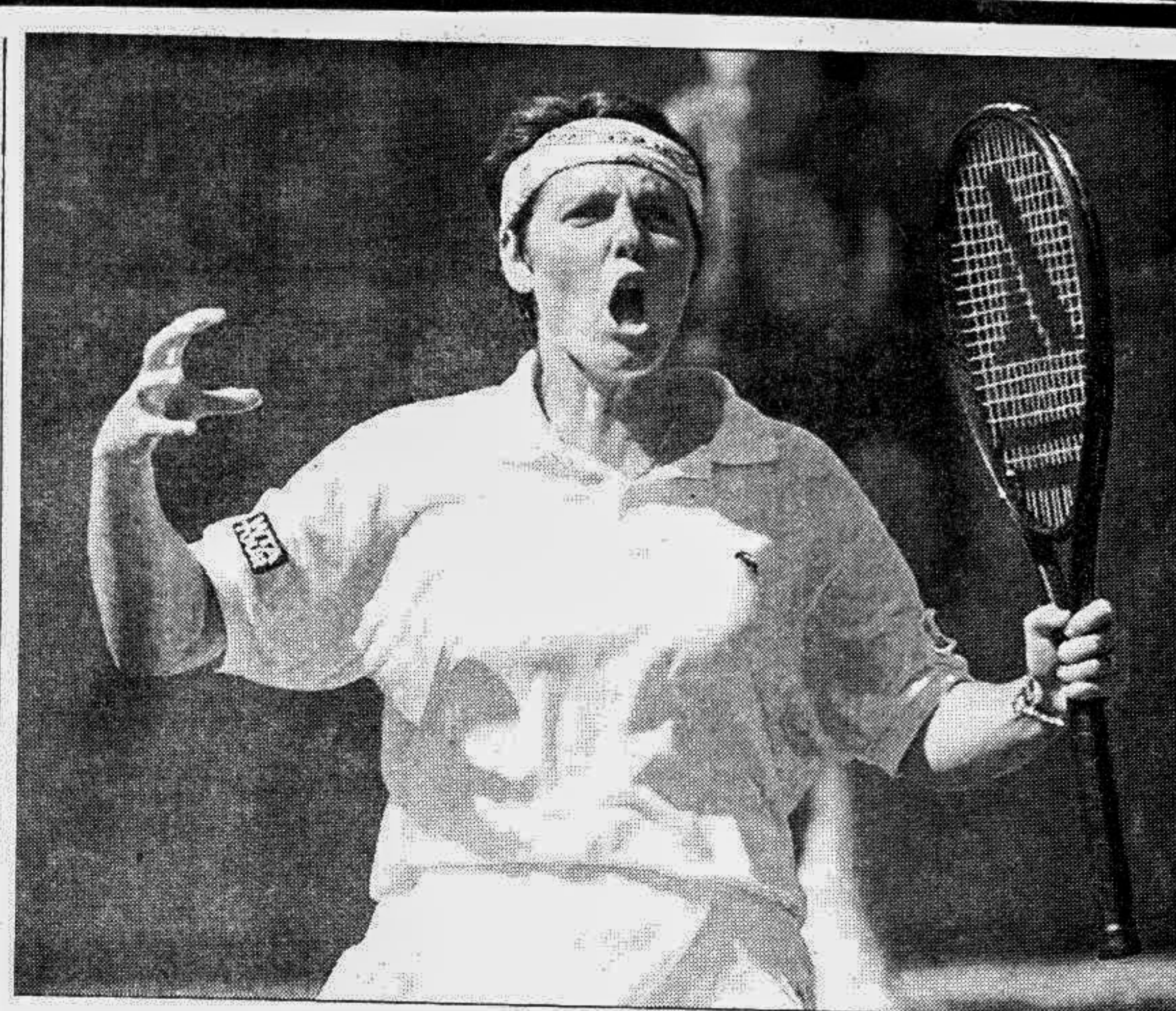
Frenchwoman Nathalie Tauziat celebrates her semifinal victory over Anna Kournikova of Russia at the Eastbourne WTA Championship in London yesterday.