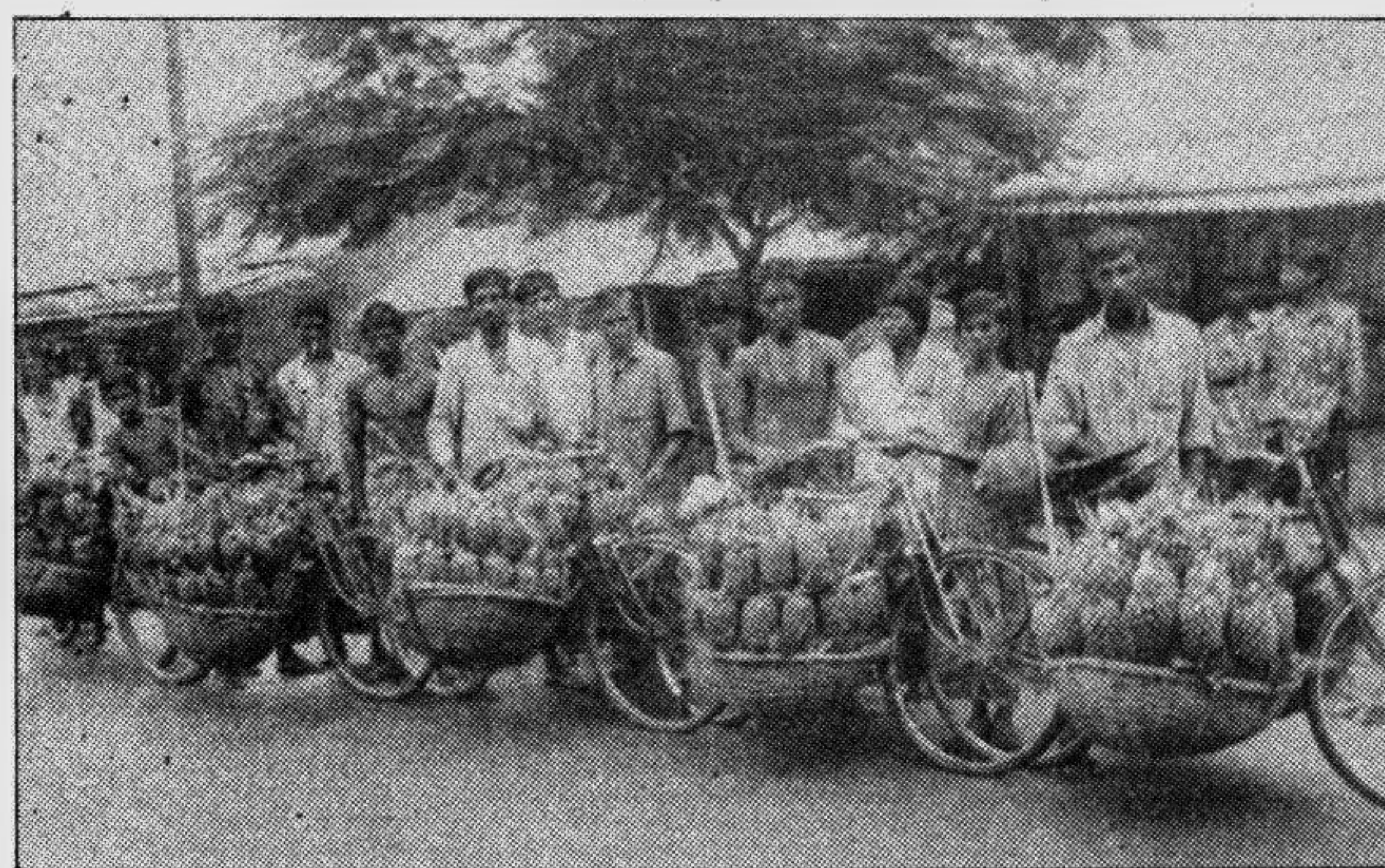
The traditional way of carrying pineapples to different markets of Jamalpur district by bikes.

Government may take initiatives in this respect. Government media should encourage the people of all walks of life to plant more and more pineapple here and there to increase its production.