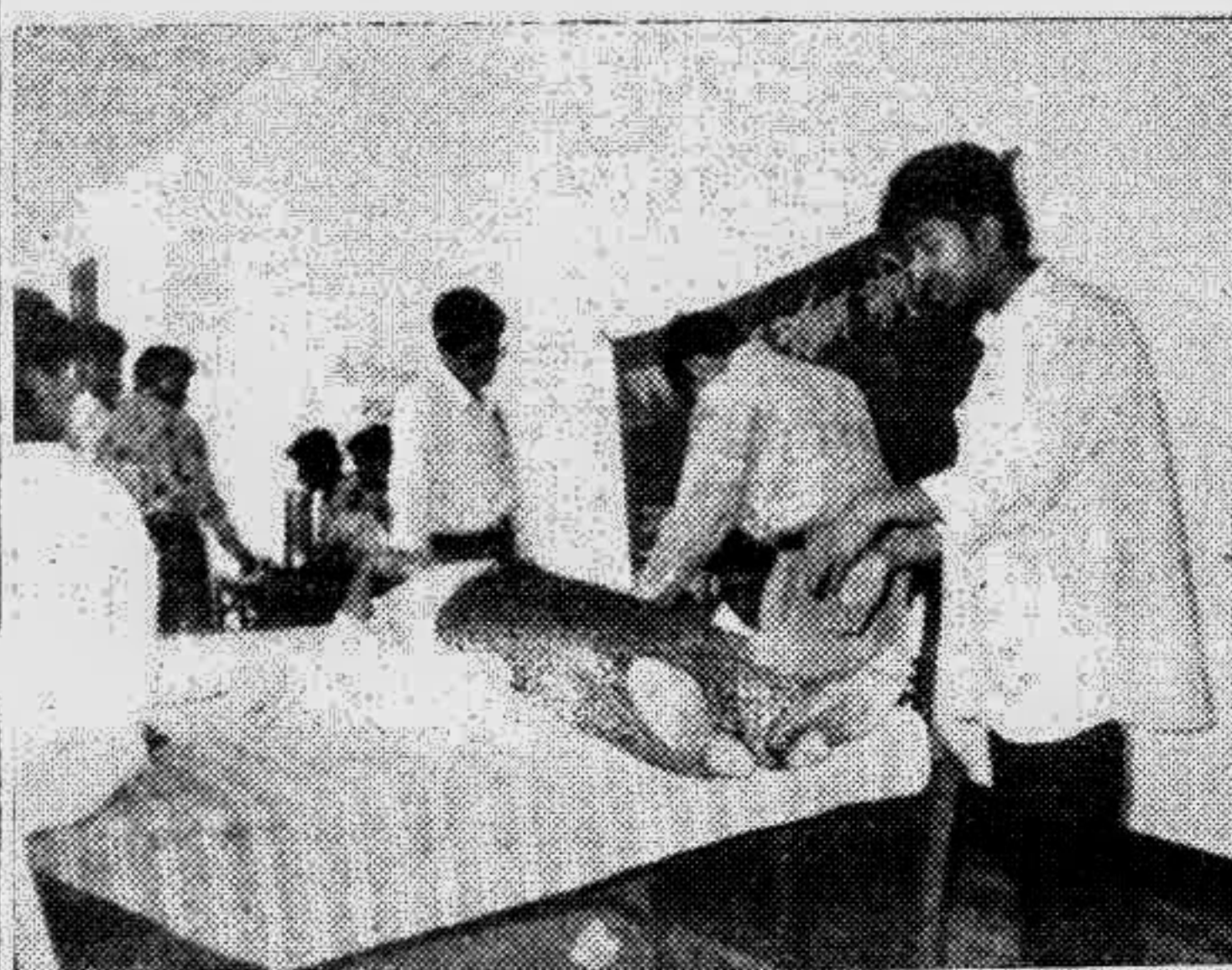
RAJSHAHI UNIVERSITY: A blood donation programme has been arranged here recently by Rajshahi Medical College unit of Sandhani on the occasion of Teachers' Day.

A total of 926 tons of wheat was allotted to implement the projects. According to official sources, 61 projects were implemented in Sirajganj sadar thana, 35 projects in Tarash, 43 projects in Royganj, 55 projects in Kaziur, 49 projects in Chohali, 30 projects in Belkuchi, 77 projects in Shajadpur, 39 projects in Kamarkhand, 87 projects in Ullapara and 26 projects in Sirajganj Pourasabha, 10 projects in Shajadpur Pourasabha and four projects in Ullapara Pourasabha.