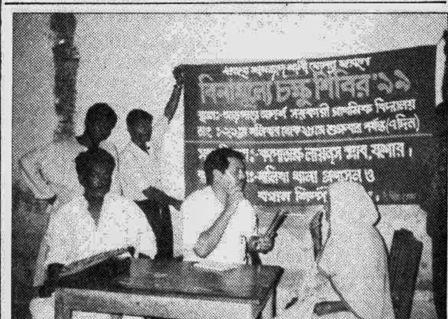
MAGURA: A free eye camp was arranged recently at Adara Primary School jointly by Shalikhra thana administration and Bondhon Shiphi Gosthi.