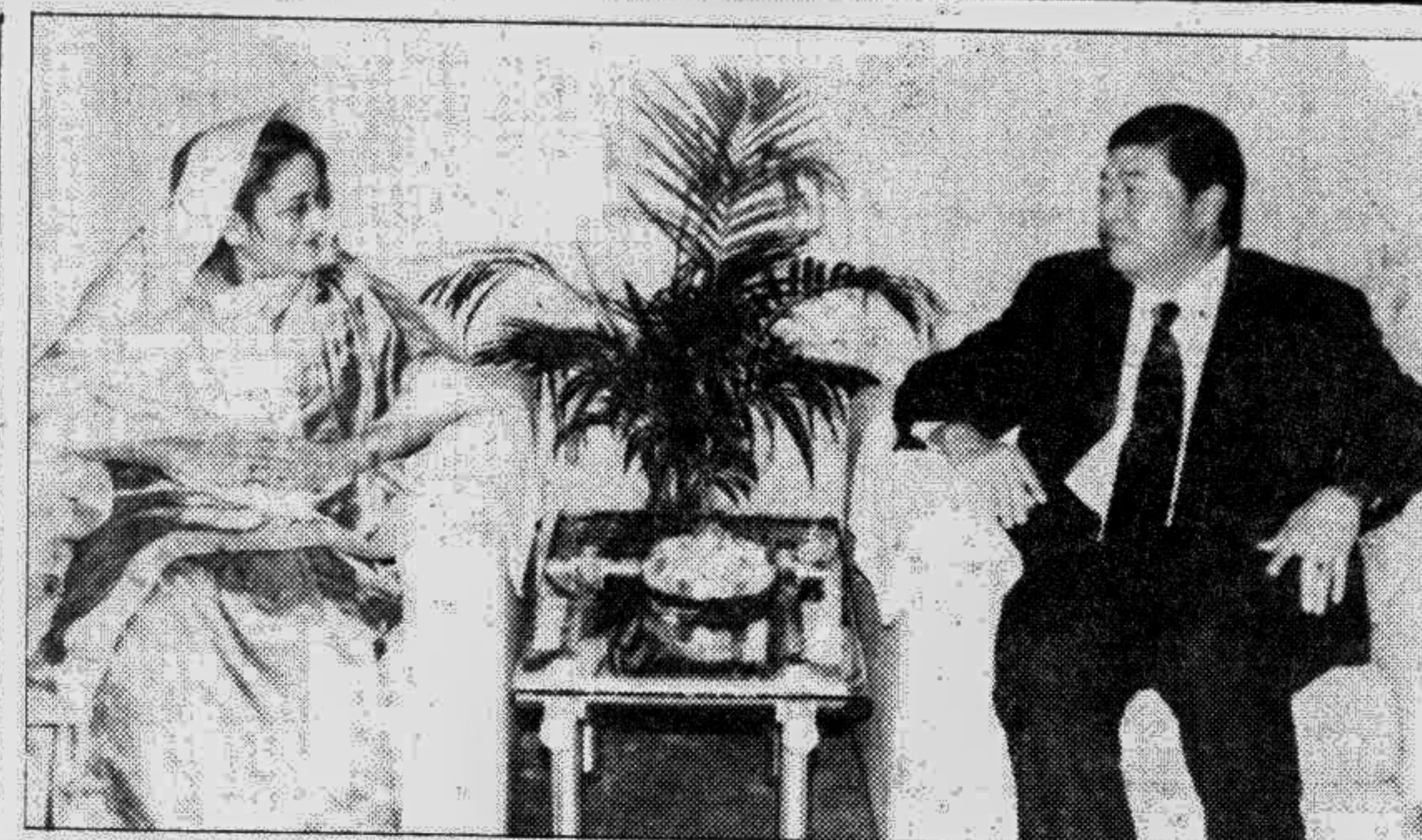
Visiting Malaysian Transport Minister Dr Ling Liong Sik called on Prime Minister Sheikh Hasina at her Sangsad Bhavan office yesterday.