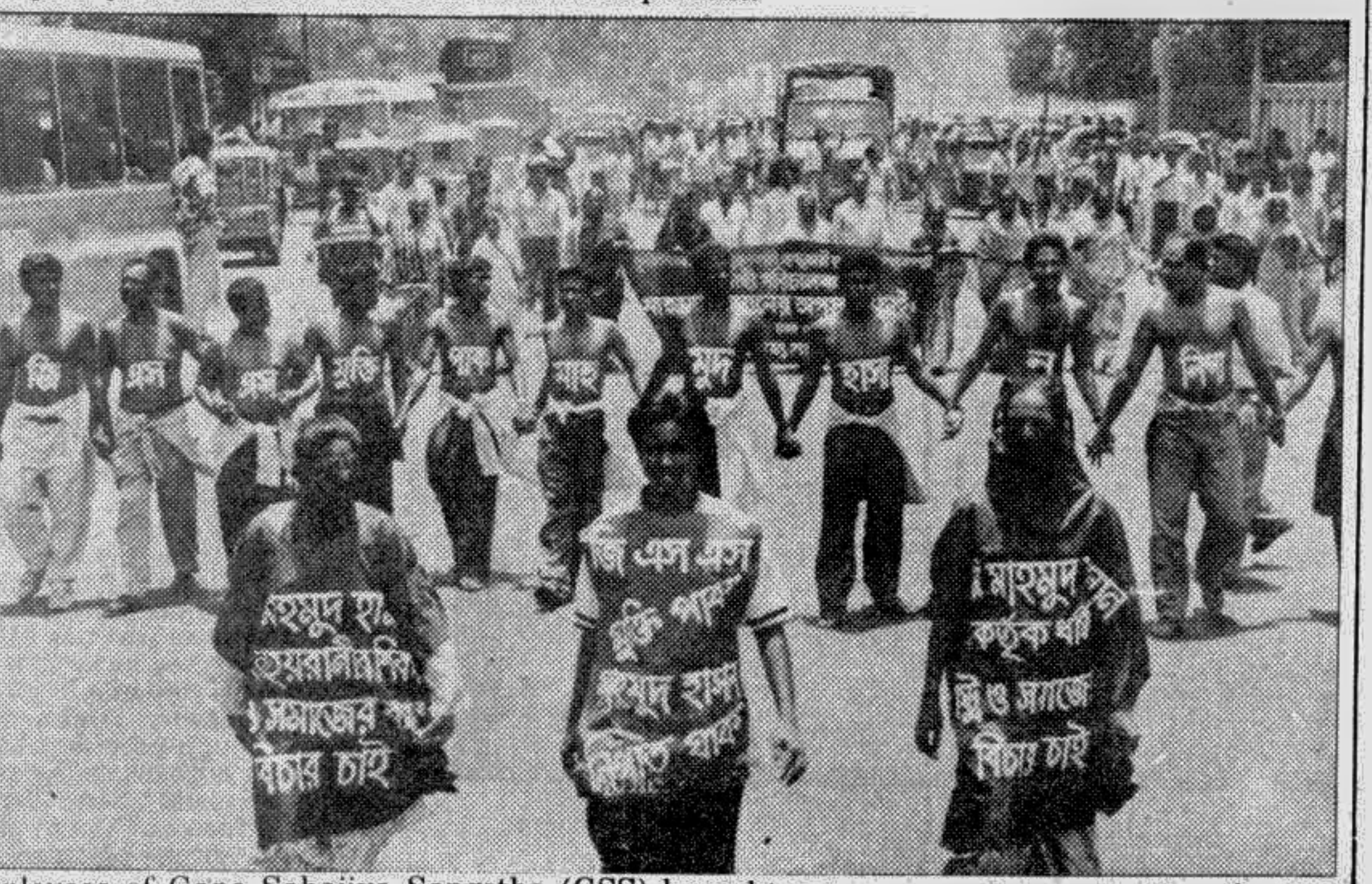
Employees of Gano Sahajiya Sangstha (GSS) brought out a procession protesting the prevailing situation in the organisation.