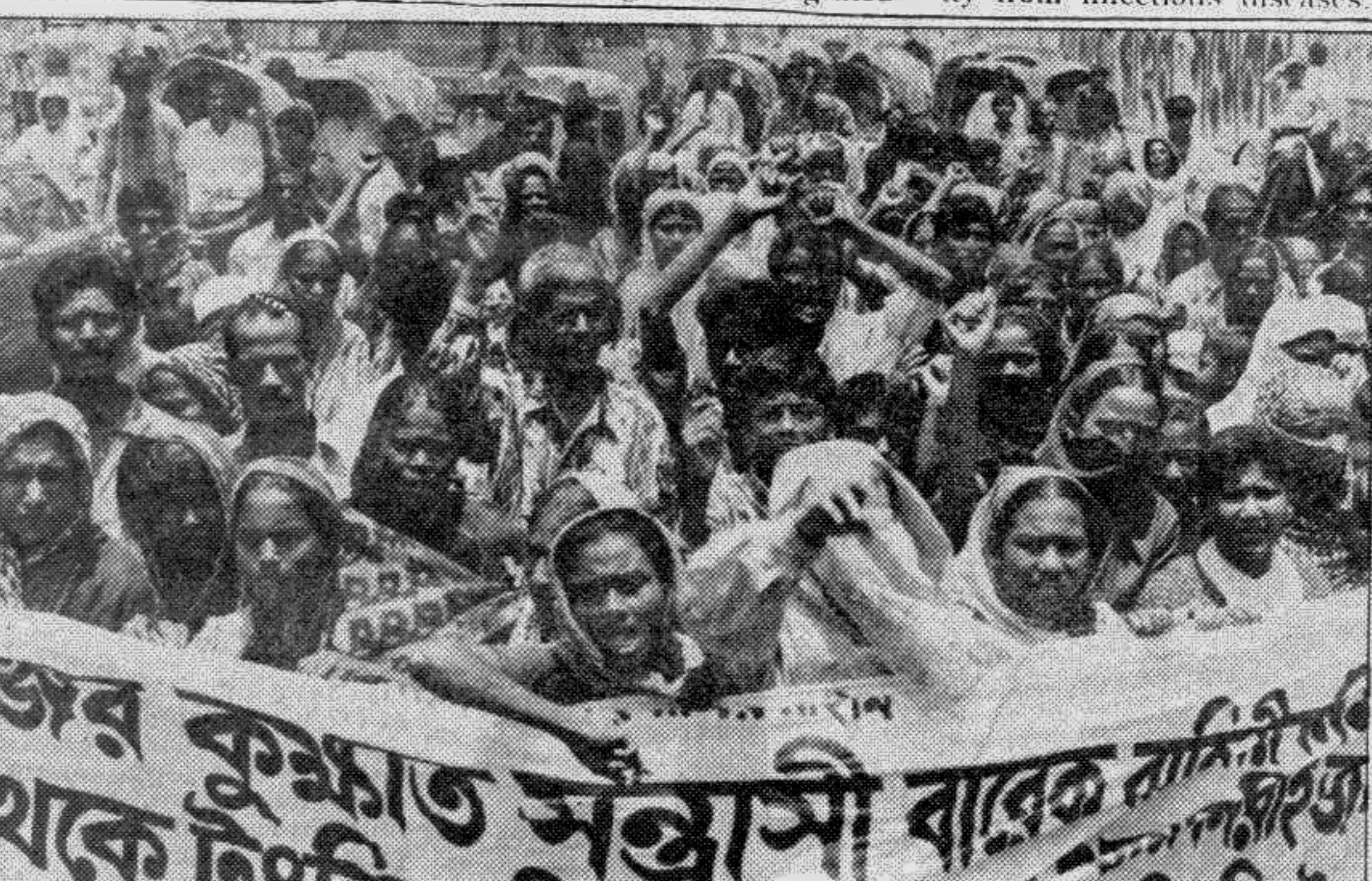
Residents of Tungibari thana of Munshiganj district brought out a procession yesterday in the city protesting the terrorist activities and demanding an end to it.

Officials of NSC and Bangladesh Cricket Board condoled his death.