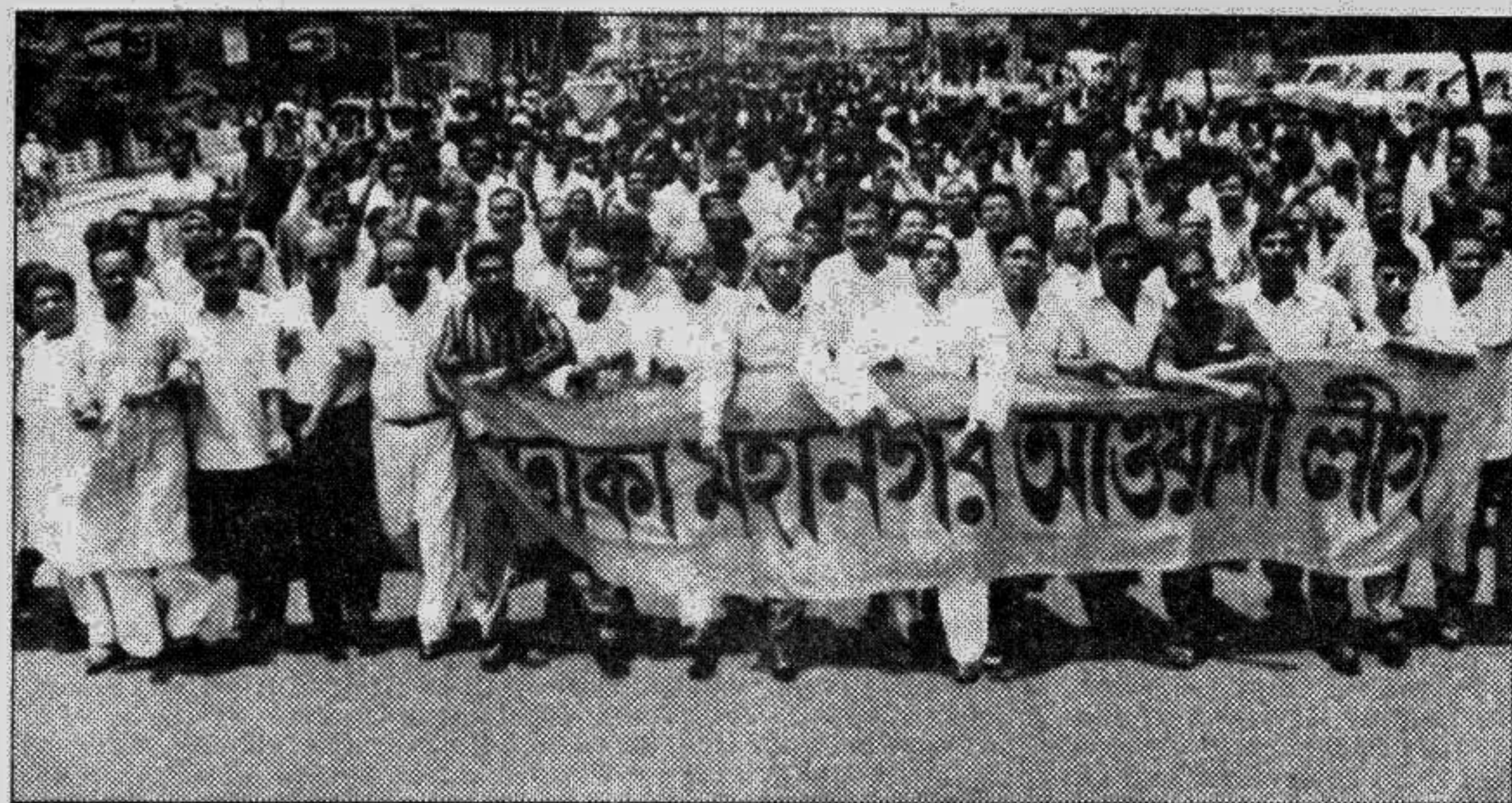
Awami League brought out an anti-hartal procession in the city yesterday.