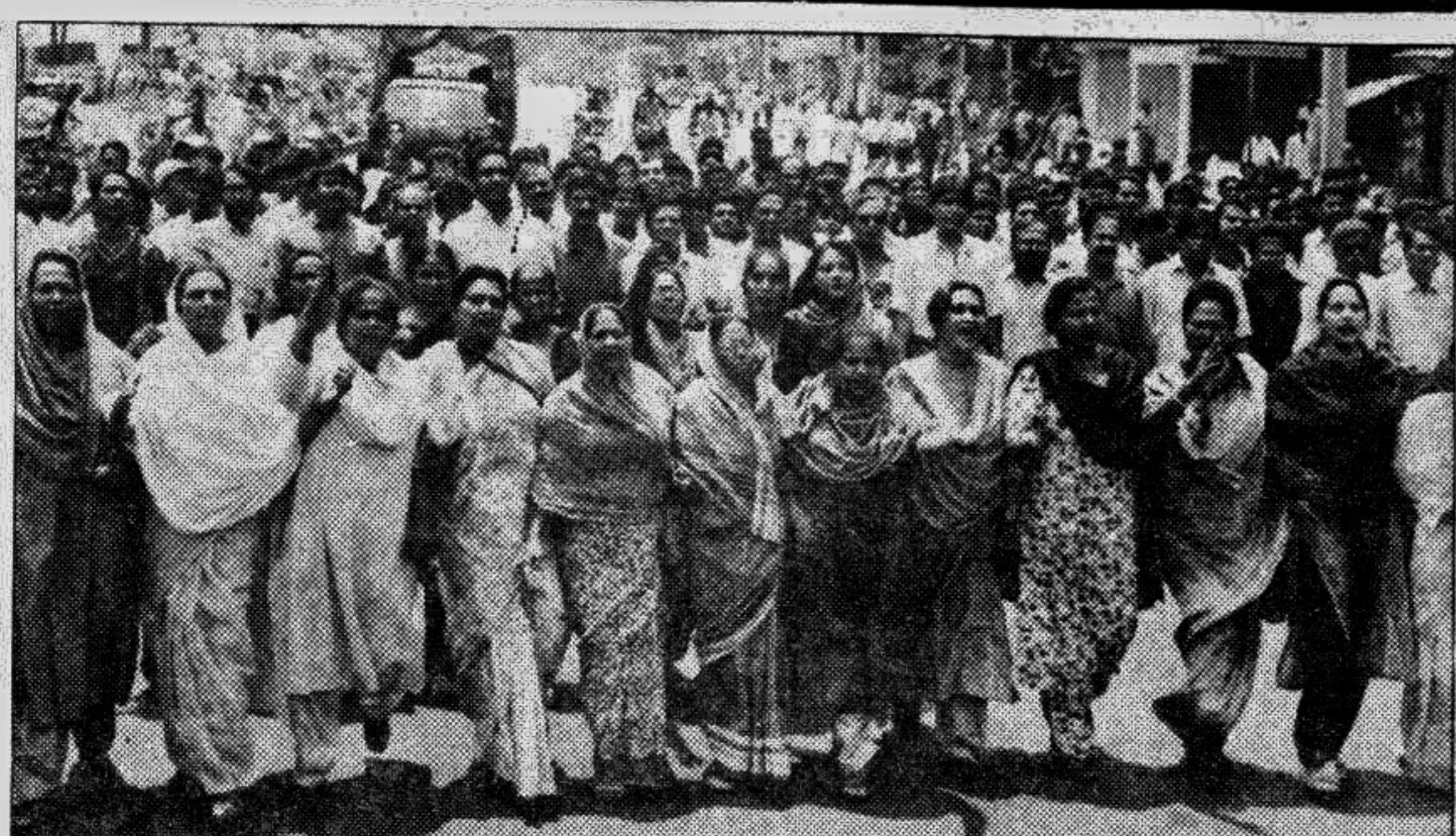
A BNP procession in the city during yesterday's hartal.

Bush, 52, is many ways the phantom frontrunner. The son of former President George Bush is little-known outside Texas. He has held elective office for just four and a half years and has little experience as a national figure.