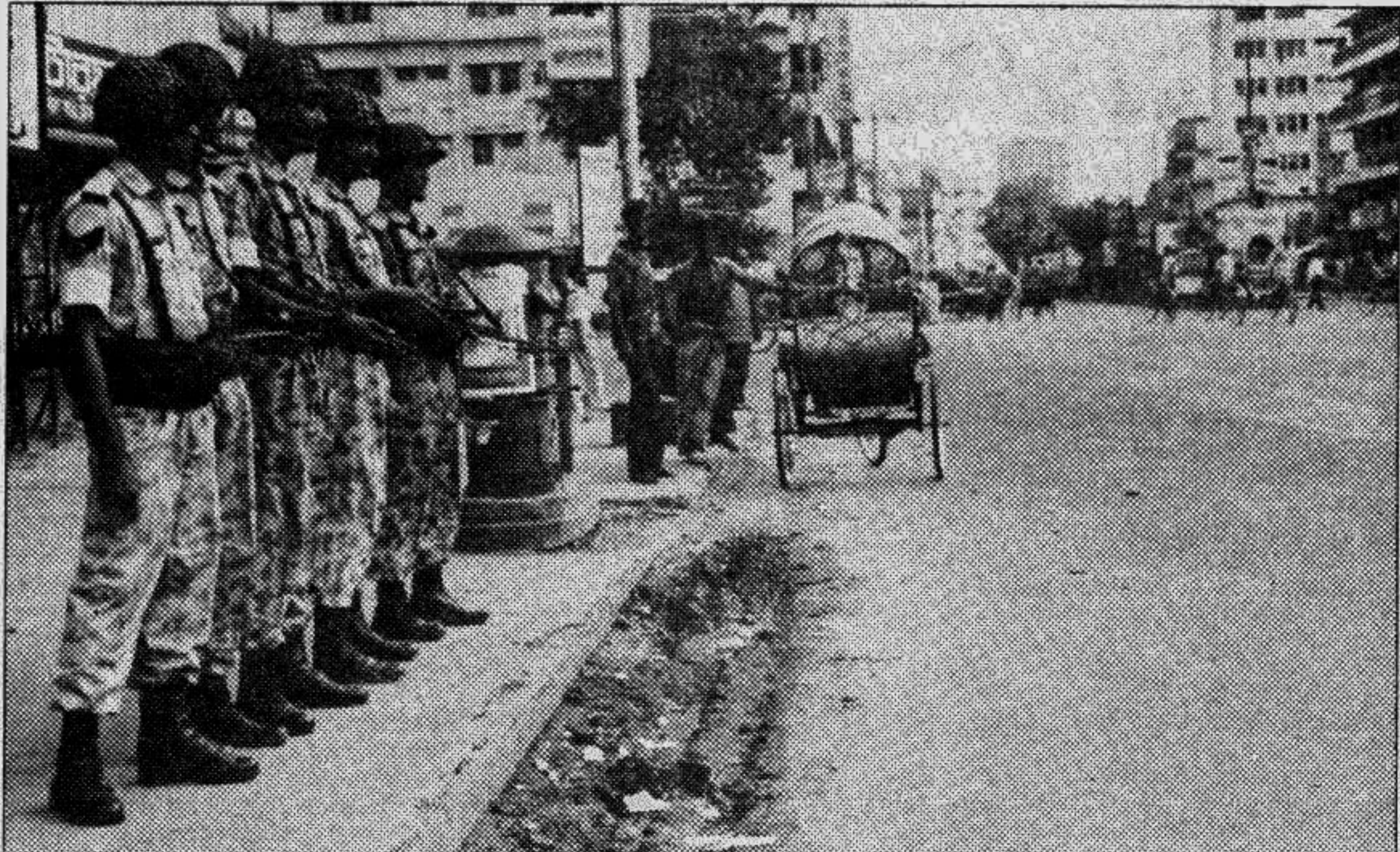
BDR personnel were deployed near Dainik Bangla crossing yesterday during the hartal called by the BNP-led opposition alliance.