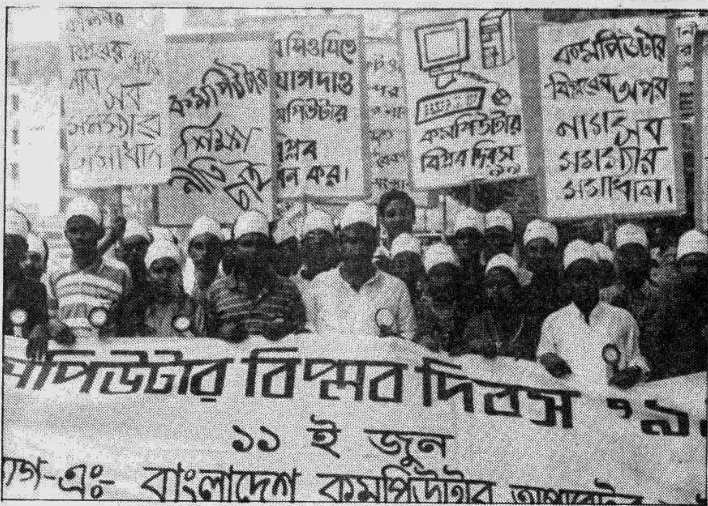
Bangladesh Computer Operator Council (BCOC) brought out a colourful procession in the city yesterday on occasion of 'Computer Revolution Day '99'.