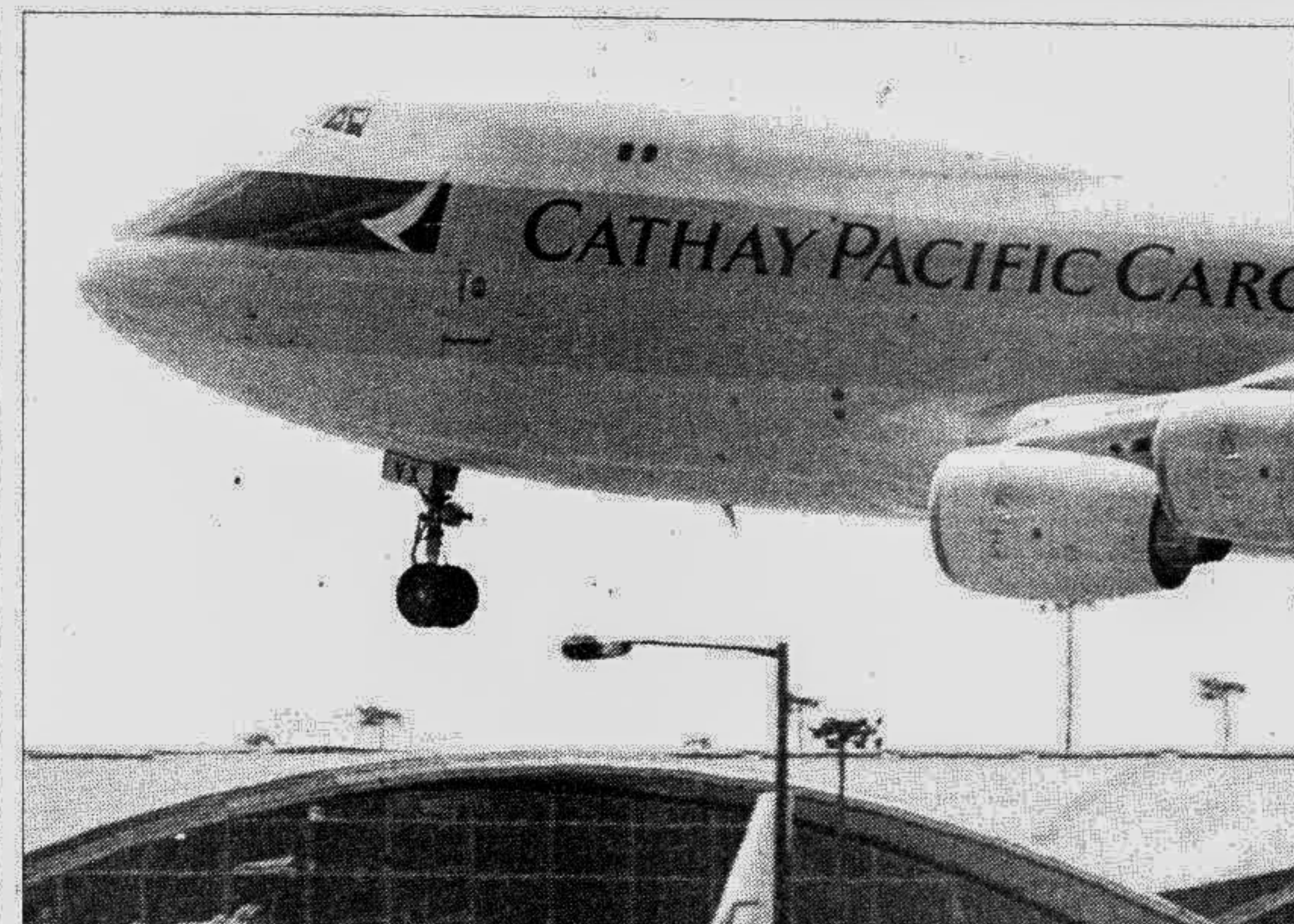
A Cathay Pacific jumbo jet comes in for a landing over the distinctive scalloped roof of Hong Kong's Chek Lap Kok airport Thursday, on the fourteenth day of a work slow-down by the airlines cockpit crews. Cathay pilots said that they had reached an agreement with the management to end a crippling pay dispute which has forced the airline to cancel a number of flights each day. The settlement comes a day before the deadline for Cathay pilots to accept a new pay package or be dismissed.

The Bangladesh Foreign Minister while the German Minister was assisted by the Director General (UN), the Deputy Director General of Economic Affairs Division and the Head of the South Asia Division in the Foreign Office.