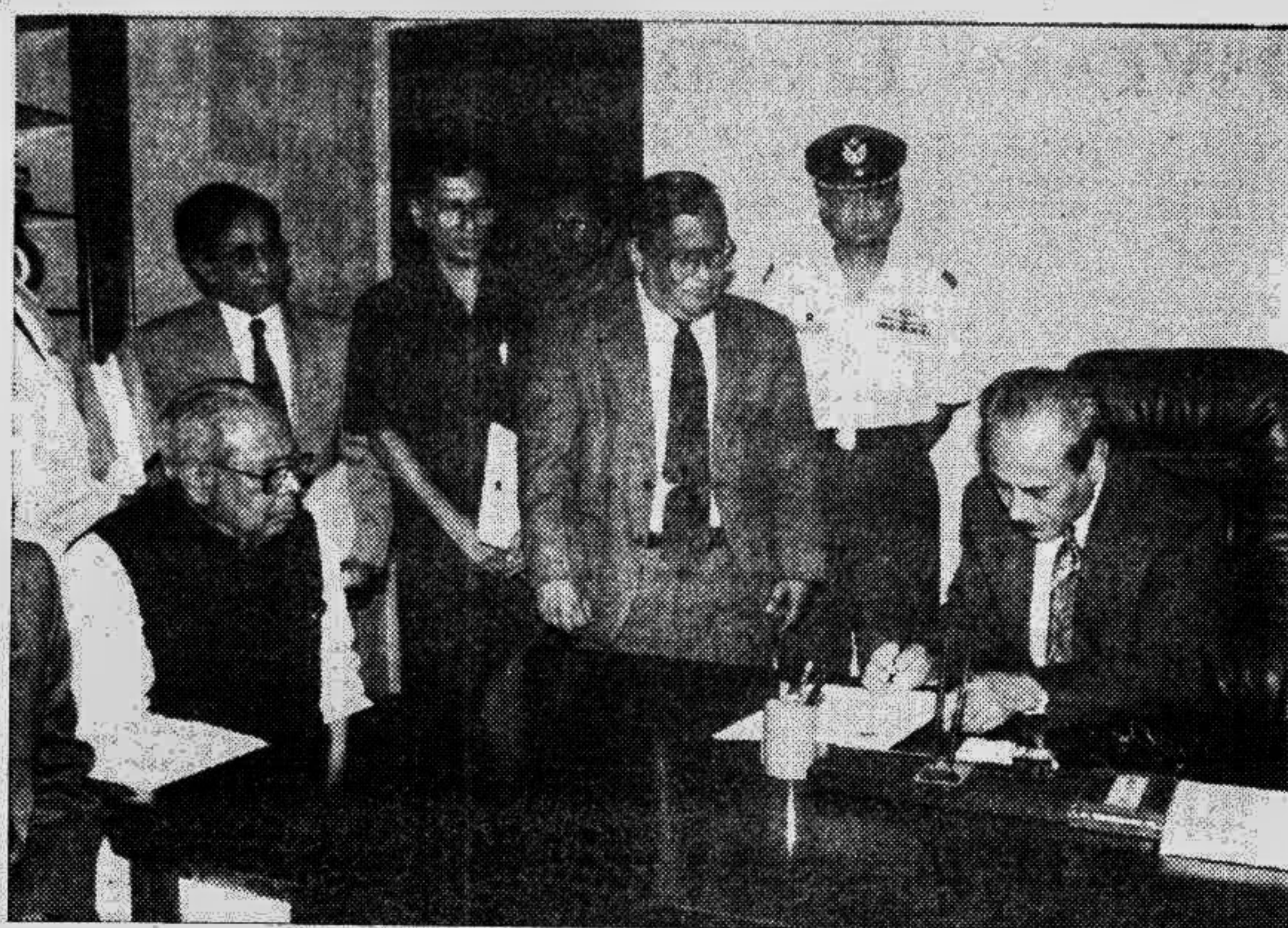
President Shahabuddin Ahmed is authenticating the Supplementary Budget for 1998-99 and the proposed National Budget for fiscal 1999-2000 at his Sangsard Bhaban office yesterday.