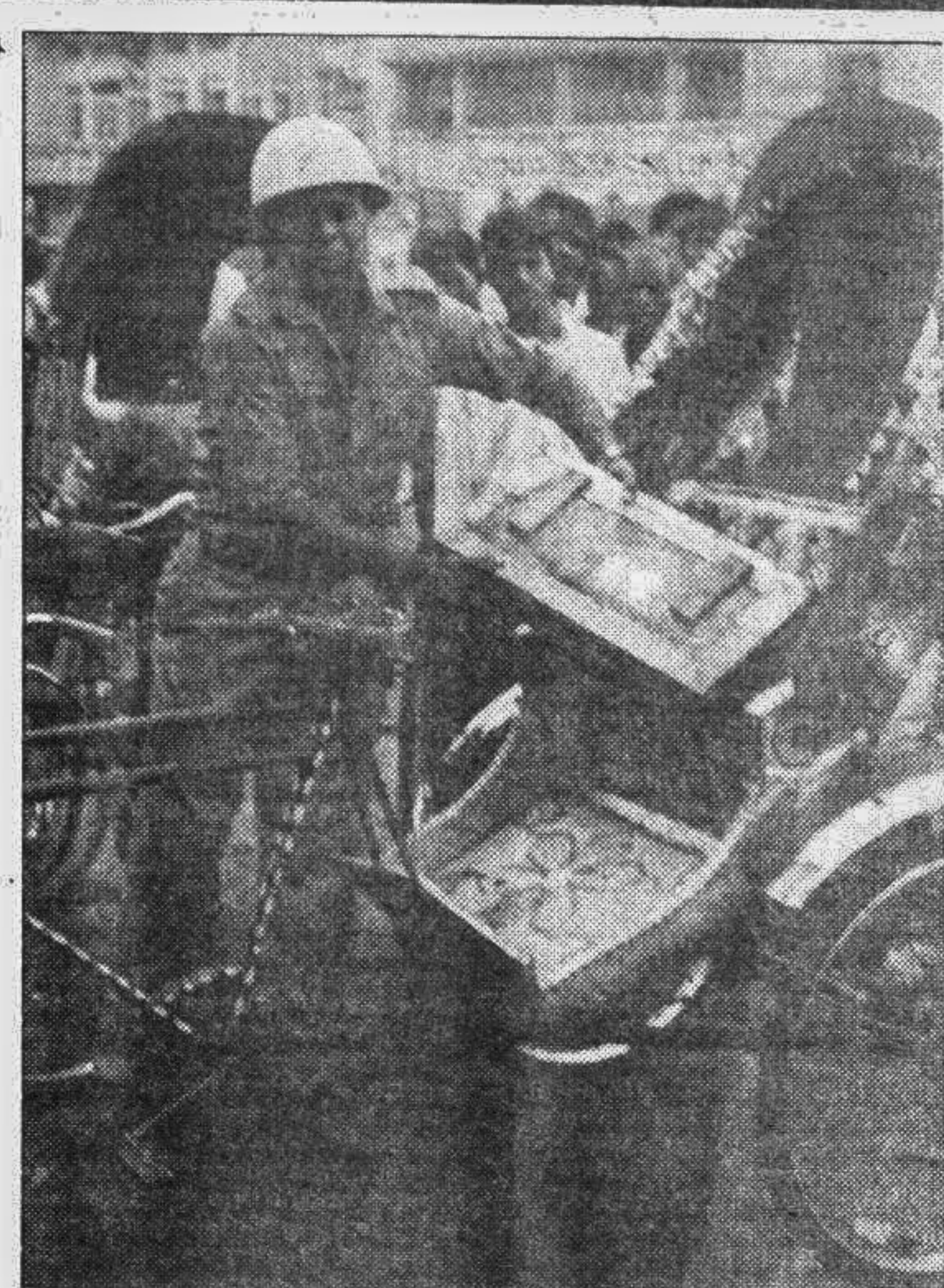
Police seized unauthorised rickshaw from Baitul Mukarram National Mosque area in the city yesterday.

During the talks, they exchanged views on different aspects of National Parliament, especially transparency and accountability of the government.