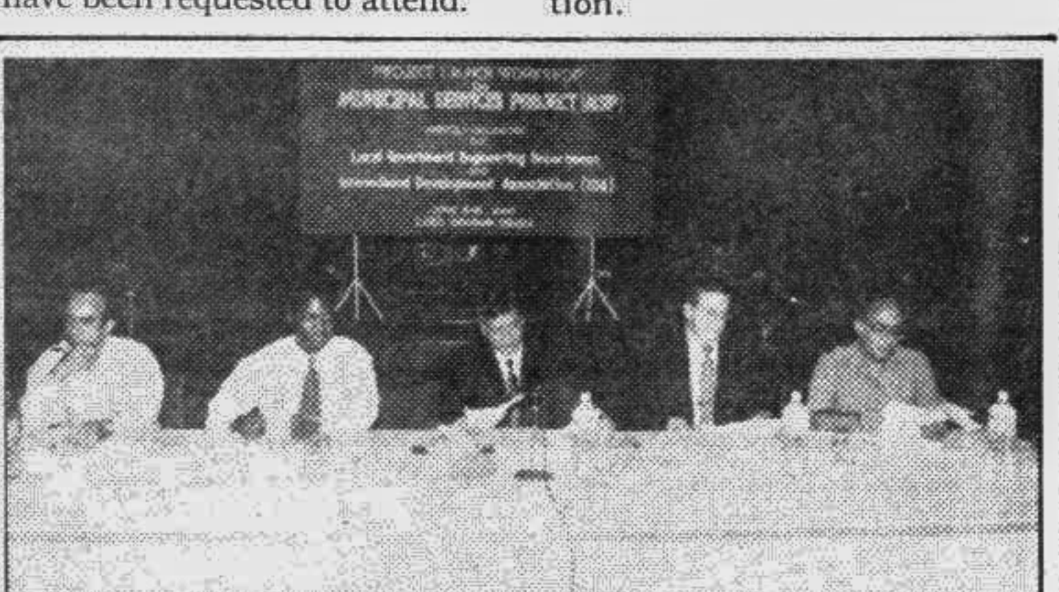
A two-day long project launching workshop on Municipal Services Project of LGED began in the city yesterday. It was jointly organised by LGED and International Development Association.