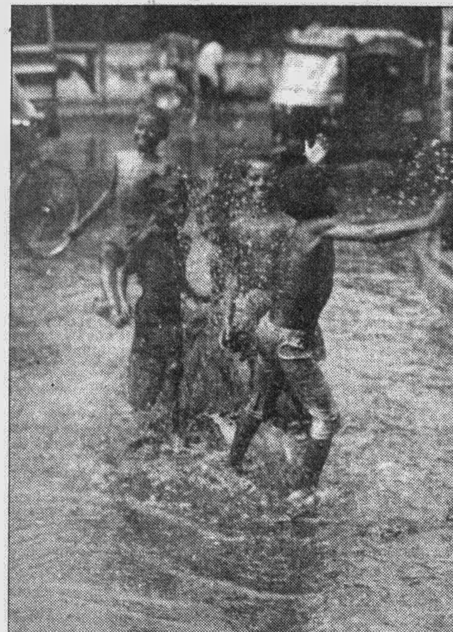
A group of street children enjoy a splash in the rain at a street corner yesterday. The rain yesterday brought a welcome relief in the hot humid weather that has been prevailing in the city for days.