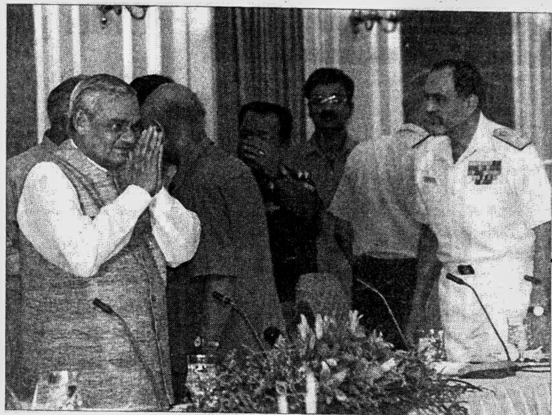
Indian Prime Minister Atal Behari Vajpayee greets members of the National Security Council during an emergency meeting in New Delhi yesterday to discuss the situation in Kashmir. India has accepted a Pakistan proposal for peace talks to end the month-long fighting in the disputed state.

Kashmir. Meanwhile, India staged air attacks against Islamic guerrillas in Kashmir for the 13th day today with two waves of fighters targeting frontier posts captured by the infiltrators, an official said. An air force spokesman said the "sorties are on" but refused to confirm whether French-made Mirage-2000 jets were being used in addition to MiG fighters.