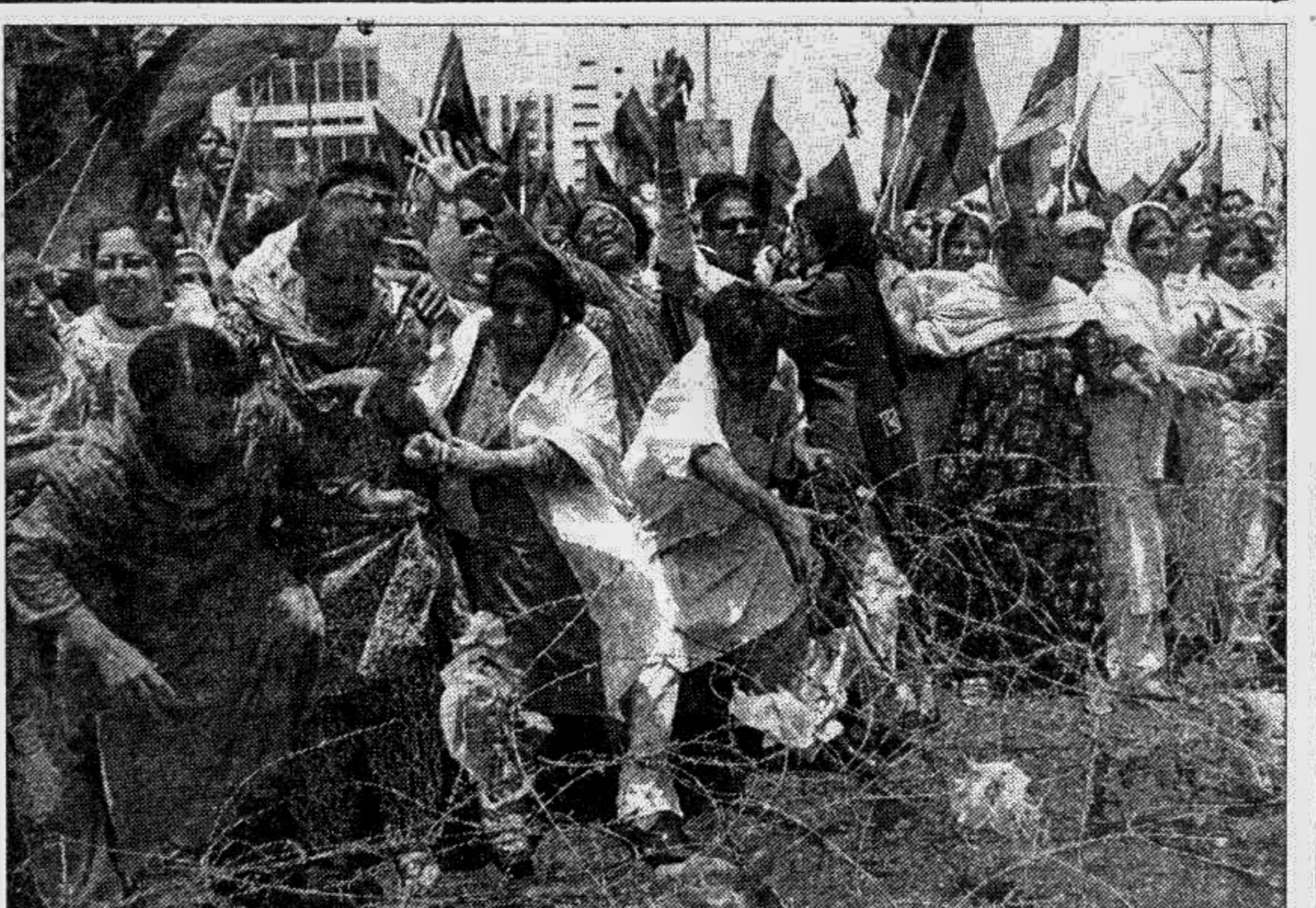
Supporters of former Pakistan prime minister Benazir Bhutto try to remove the barbed wires in Karachi during a demonstration against the conviction of their leader for graft yesterday. Around 20 workers of Bhutto's Pakistan Peoples' Party (PPP) were arrested as they tried to defy security measures to reach the residence of the provincial governor.

BOMBAY, June 8: An expelled leader from India's main opposition Congress, who formed his own party after a spat with Congress president Sonia Gandhi, today ruled out an alliance with Prime Minister Atal Behari Vajpayee's party for September-October national elections, reports AFP. Sharad Pawar said his new party, floated with two other former Congress leaders who were kicked out for questioning the Italian-born Gandhi's leadership, would not join hands with the Hindu nationalist BJP. "We are not going to associate with the BJP in any way. We believe India is a multi-cultural, multi-religious country and not just a Hindu country," Pawar told reporters here. Pawar, a former defence minister, is chief of the newly-floated Nationalist Congress Party. On Tuesday, he reiterated a demand for legal changes to bar foreign-born nationals from occupying top posts -- a move which had earlier led to his ouster from the Congress. "We will demand that the constitution be amended to allow only natural born Indians to occupy top posts of president, vice-president, prime minister," he said, adding: "We are fighting for the cause of nationalism and national self-respect." Pawar said his party would "focus on decentralisation of power." He claimed that large numbers of Congress party members agreed with his view that Sonia Gandhi, who acquired Indian nationality in 1986, was unfit to become prime minister. He claimed the dissidents would soon join his party.