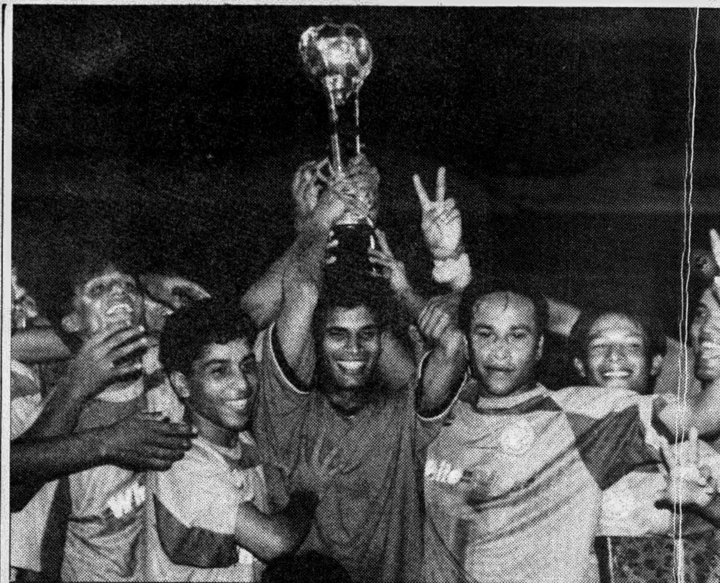
WE ARE THE CHAMPIONS: Abahani players celebrate with the Federation Cup after the final at the Bangabandhu Stadium yesterday.

GOLD COAST, Australia, June 7: Joe Bugner will have his last fight here on Sunday at the age of 49 and after 32 years in the ring, reports AFP.