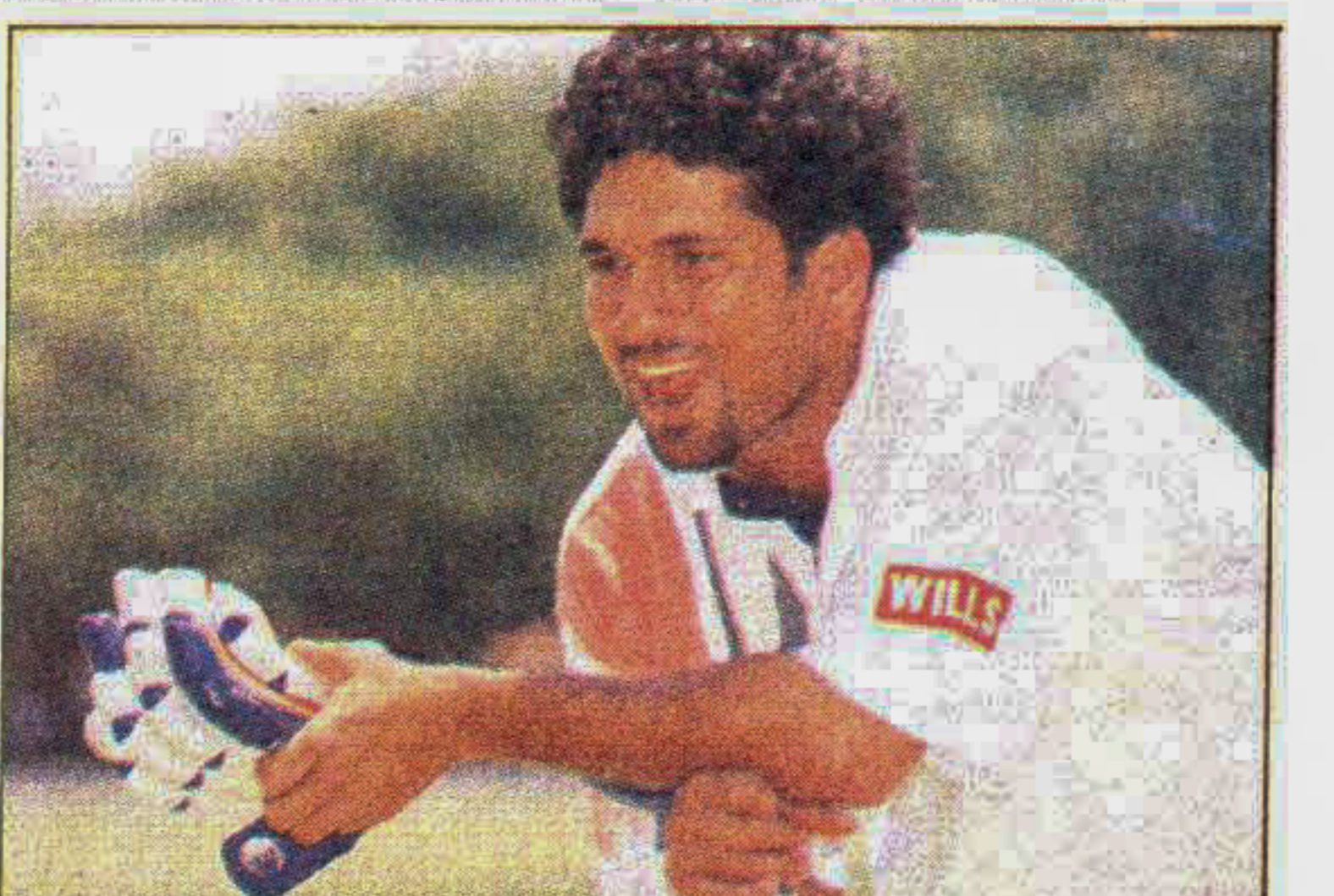
TENDULKAR: About time he delivers.