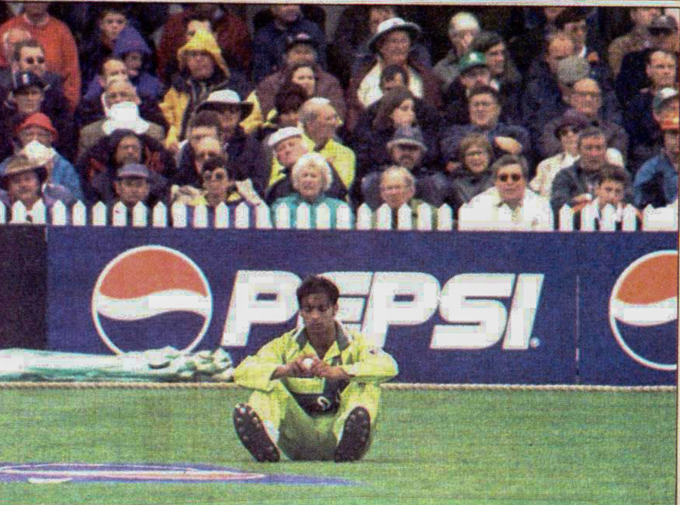
COOLING DOWN! Shoaib Akhtar, the world's fastest bowler, waiting for play to start during the Super Six fixture against South Africa at Trent Bridge on June 5.

"Our objective is for all fans to enjoy what potentially is a wonderful day's cricket between two fine sides and to ensure safety for all concerned."