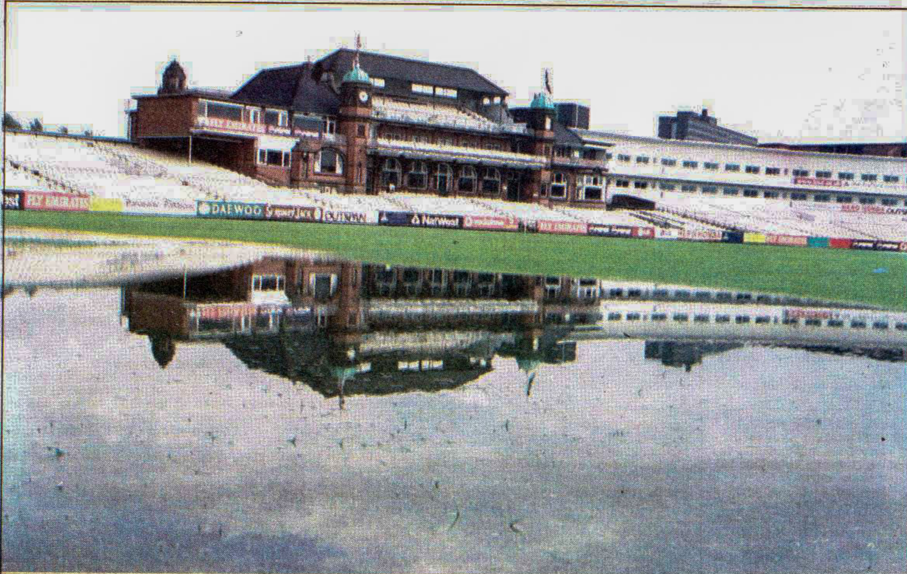
OLD TRAFFORD LAKE! The Old Trafford ground at Manchester, venue for the Pakistan-India Super Six clash, is water-logged. Photograph was taken yesterday.