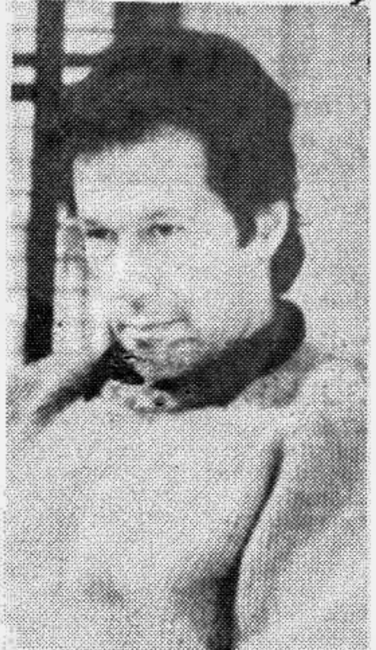
quate security was in place. "We have got on our hands the best match of the World Cup and probably the best game of cricket we've seen in this country." See page 14