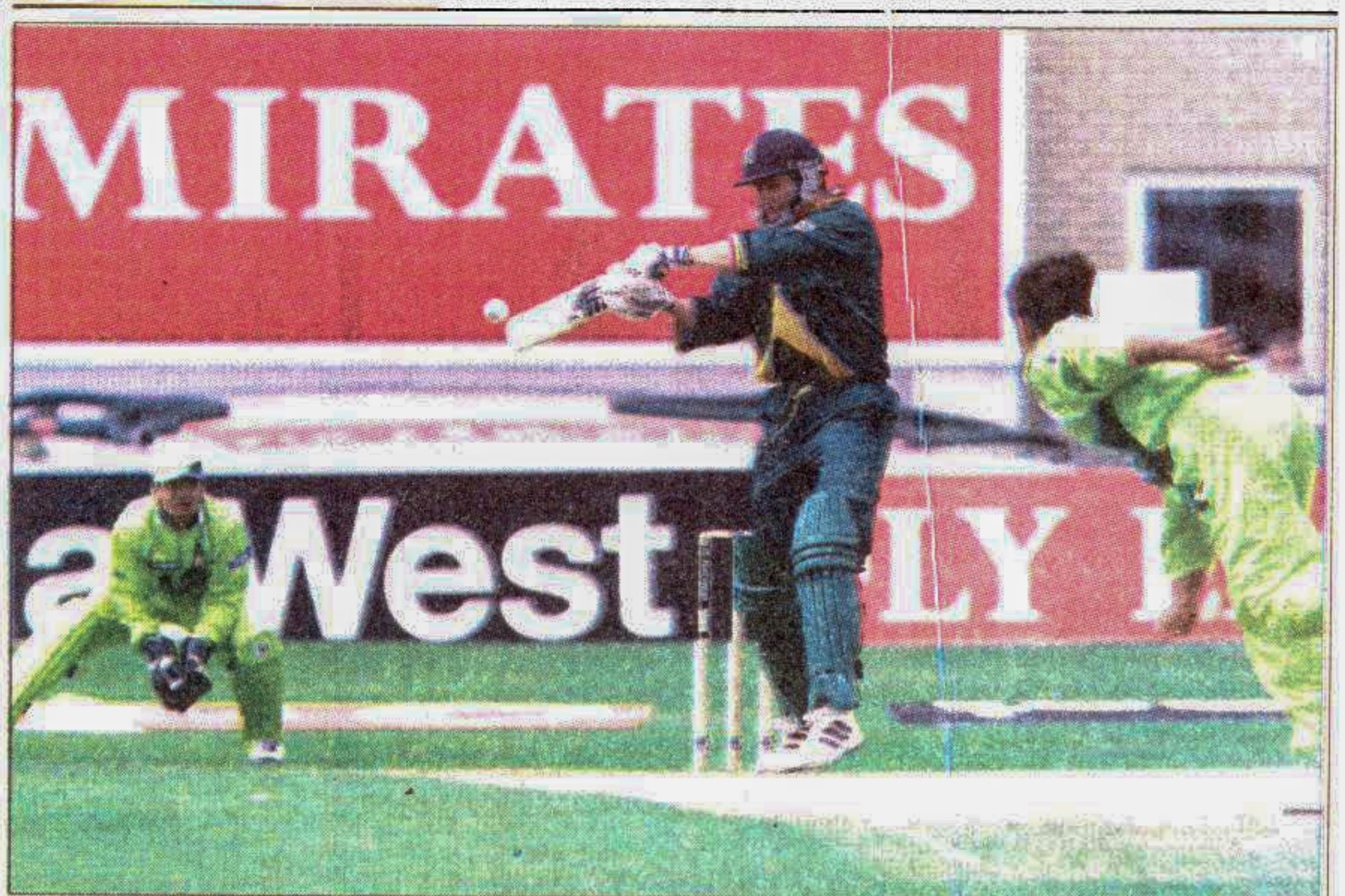
South Africa's Mark Boucher cutting Shoaib Akhtar on June 5 at Trent Bridge.