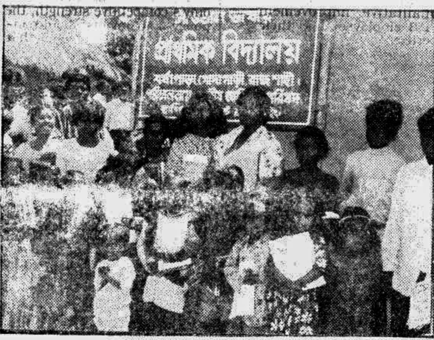
RAJSHAHI: A new school of Santal language has been opened here for aboriginals recently. Photo shows some Santal students are seen standing with books in hand near the school.