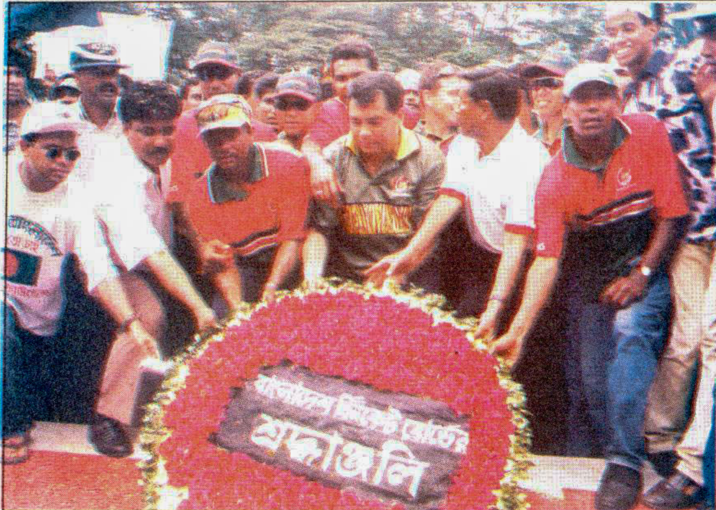
Players and officials of the Bangladesh cricket team paying their homage at the Central Shaheed Minar yesterday.