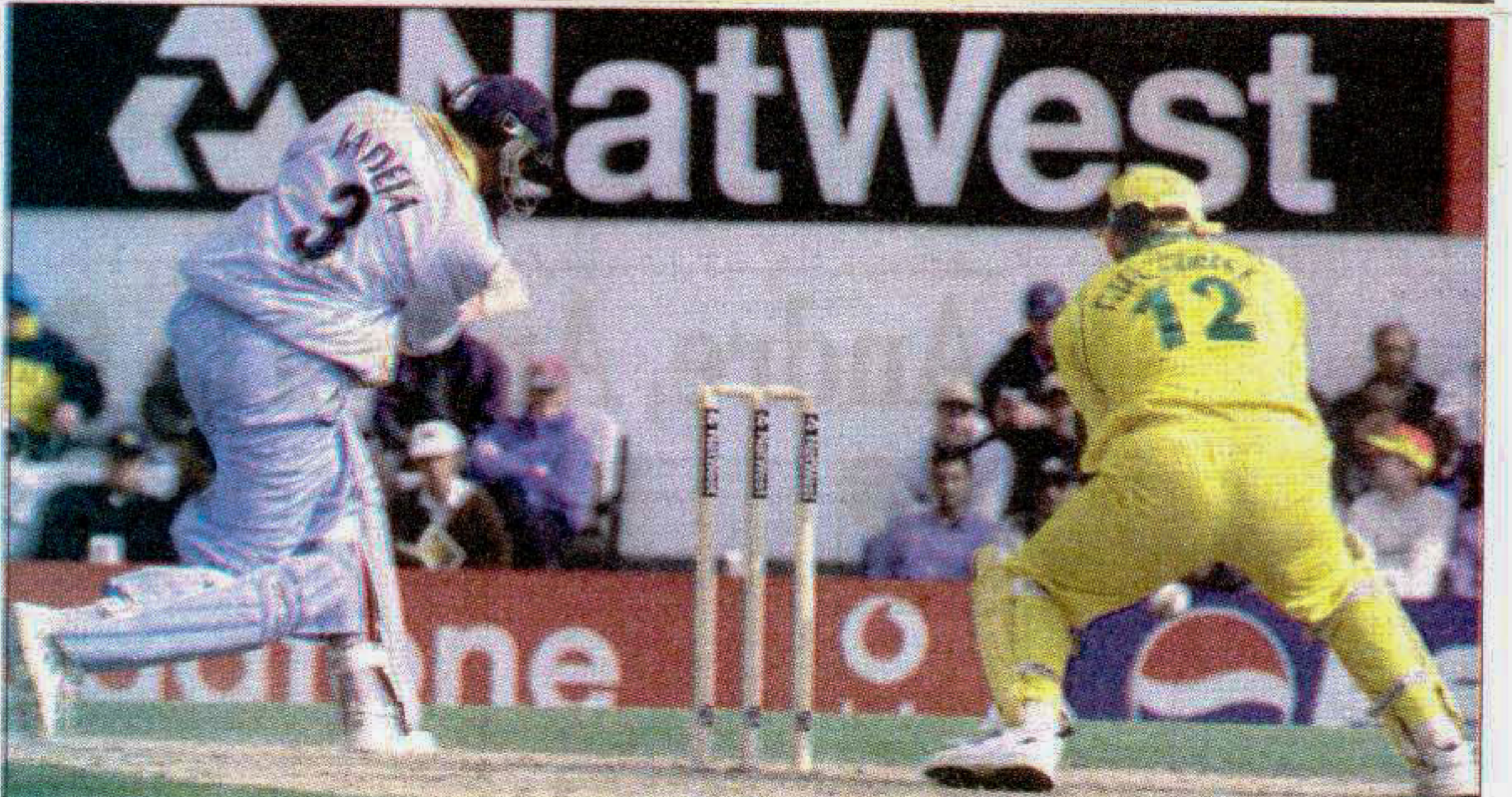
PLUGHING IN SAND: Ajay Jadeja, the Indian centurion, stepping out to drive against Australia on June 4.