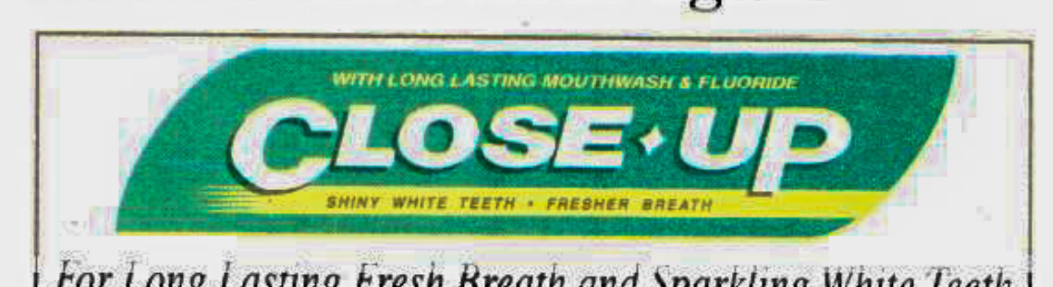
For Long Lasting Fresh Breath and Sparkling White Teeth

South Africa won with six balls to spare. They had needed 44 to win off five overs with seven wickets down - Pakistan earlier in the day managed 54 off their fi-