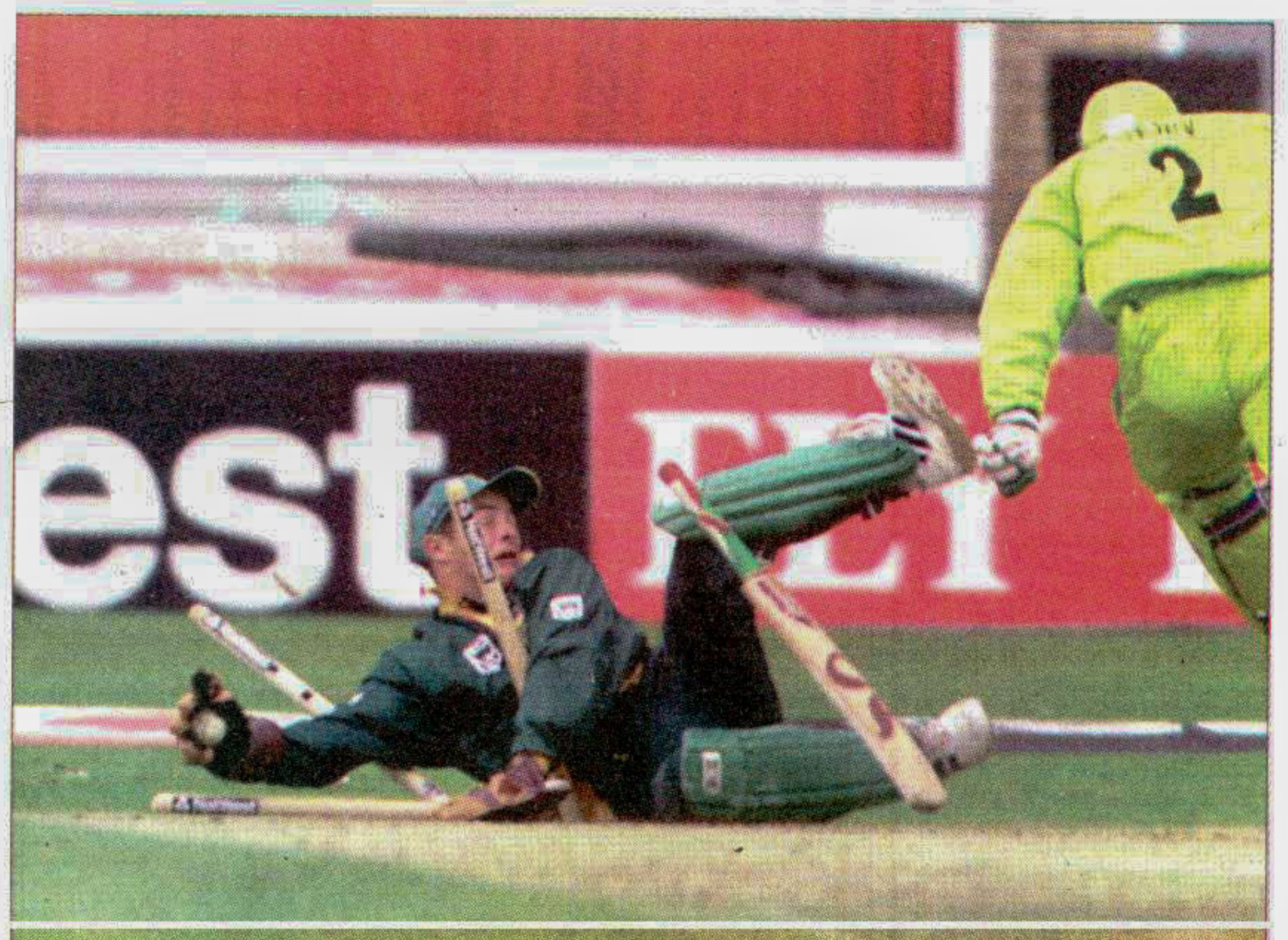
WORTH THE MESS: South African wicket keeper Mark Boucher is all tangled up while running out Pakistan's Moin Khan yesterday.