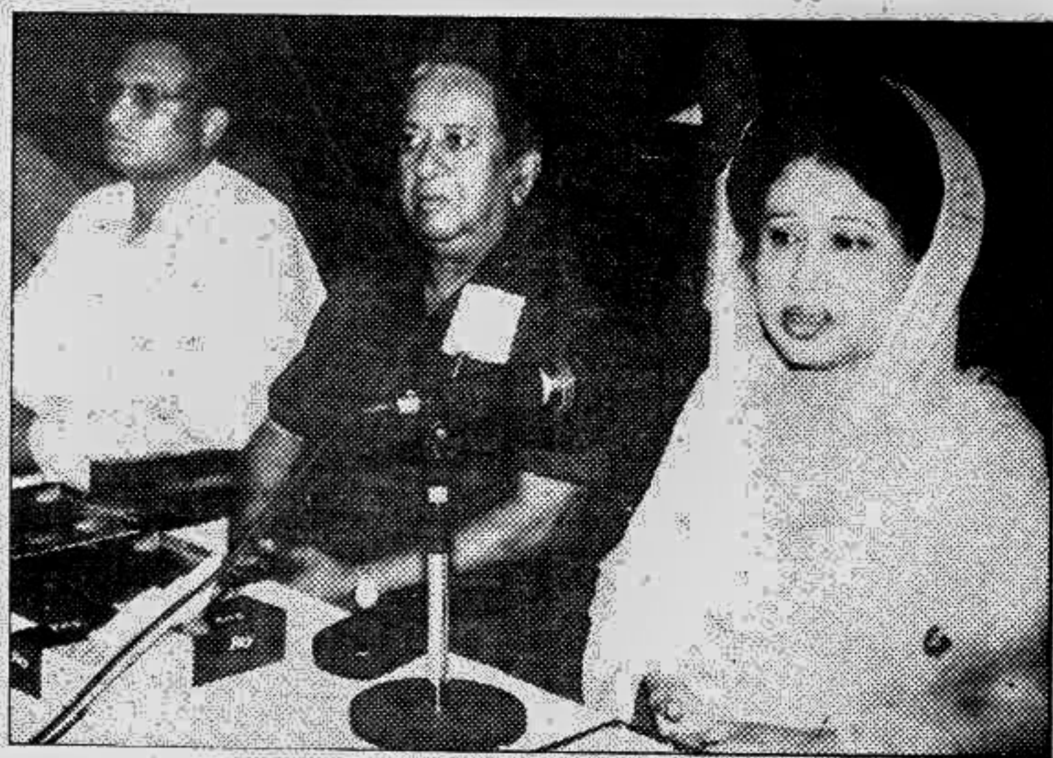
BNP chairperson and Leader of Opposition in Parliament Begum Khaleda Zia addressing the 7th conference of Engineers Association of Bangladesh (EAB) at its auditorium in the city yesterday.