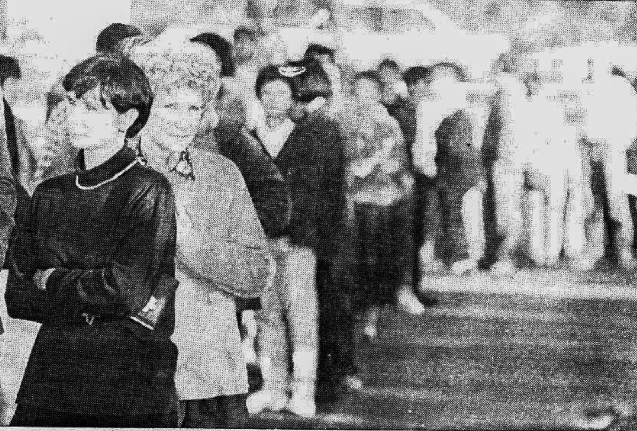
South Africans wait patiently in the queue at the polling station in Bellville, Cape Town, yesterday to vote in the country's second fully democratic general elections. President Nelson Mandela was among the first South Africans to vote in the country's second democratic elections.