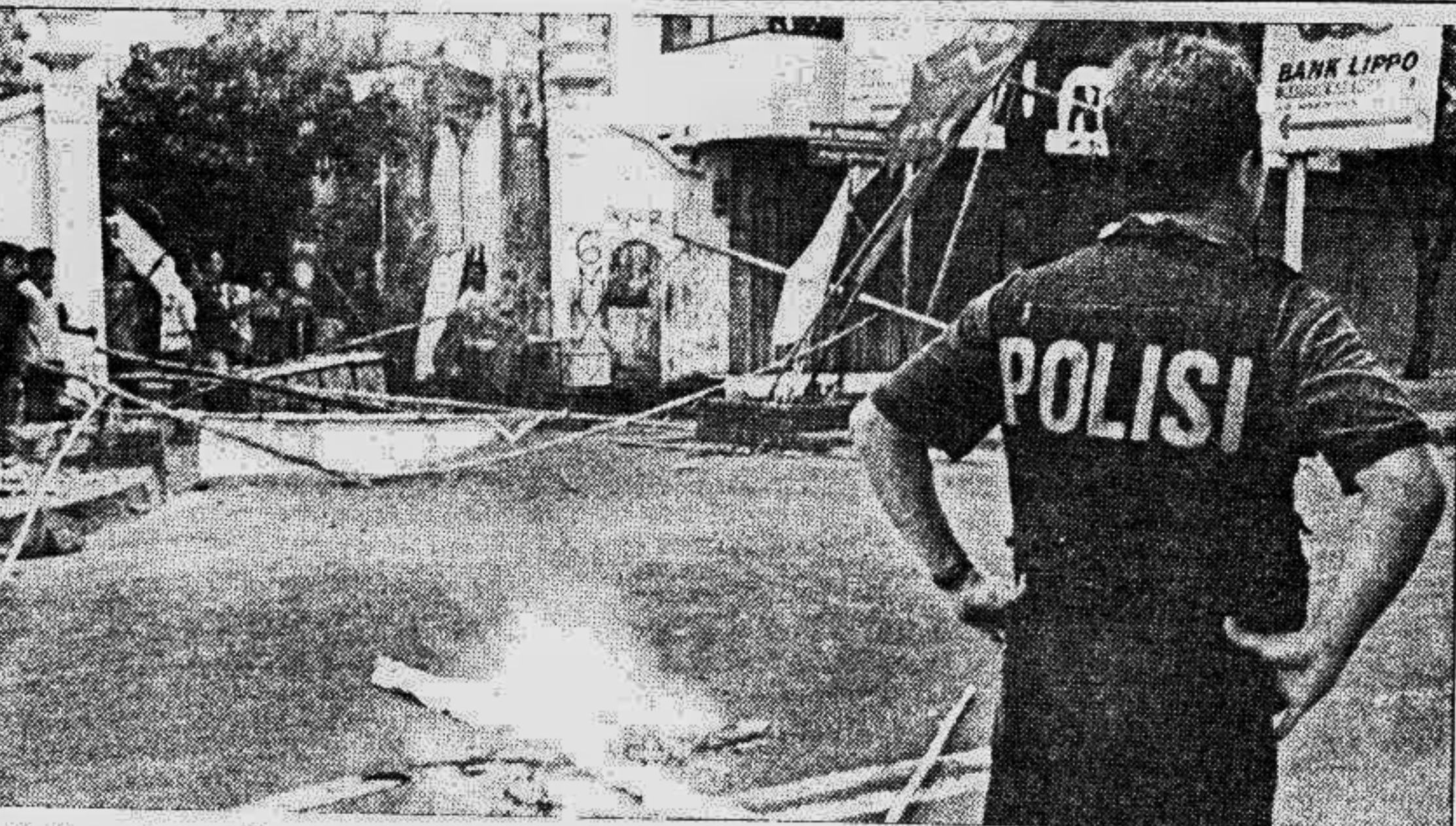
An Indonesian policeman stands by a burning flag of the United Development Party (PPP) as security forces intervened to break up a skirmish between supporters of rival political parties in Yogyakarta on Tuesday. Violence erupted when PPP supporters confronted Indonesian Democratic Party for Struggle (PDI-S) campaigners from parading through the streets of this central Java town on their allocated campaign day.

BEIJING, June 2: Two days ahead of the 10th anniversary of the Tiananmen massacre, China issued a new warning Wednesday against destabilisation by "hostile forces," reports AFP.