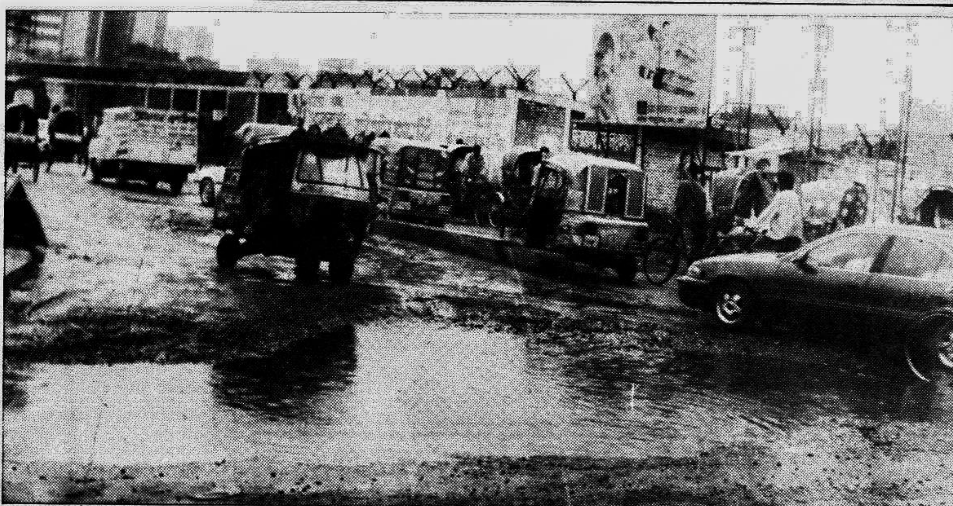
Monsoon in town

The road linking Motijheel with Biswa Road has been extensively damaged, making it difficult for the vehicles.