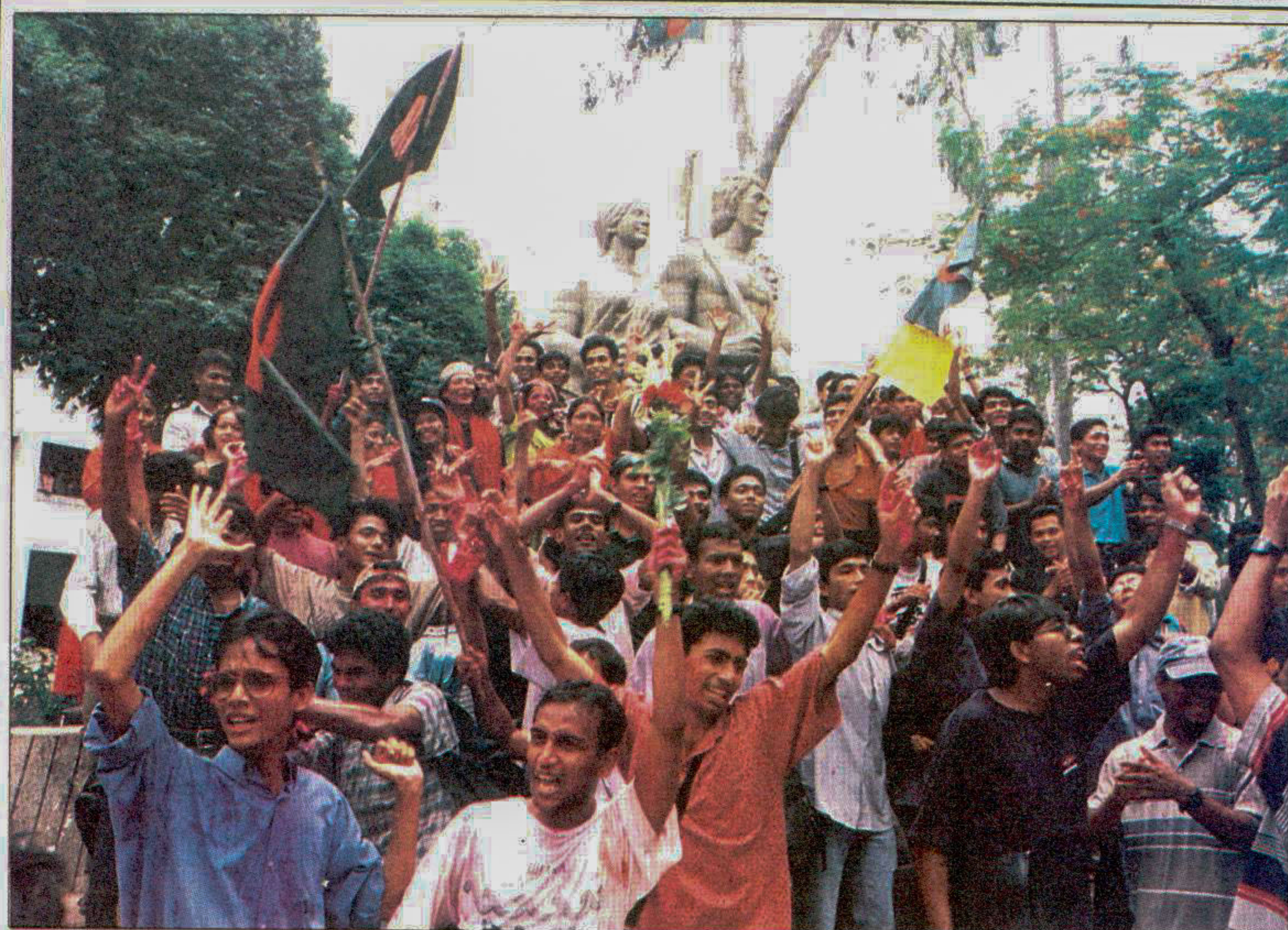
The happy faces

Dhaka University students are over the moon at the Aparajeyo Bangla yesterday.