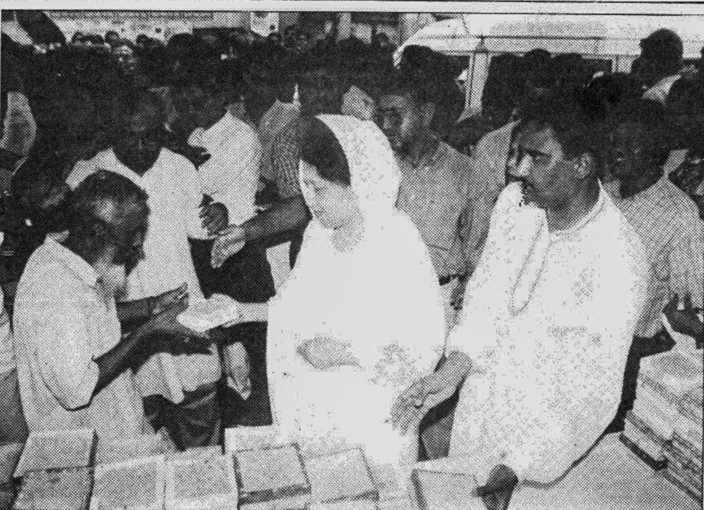
Begum Khaleida Zia, Leader of the Opposition in Parliament, distributing khichuri at a destitute feeding programme marking the 18th death anniversary of Shaheed President Ziaur Rahman. BNP unit at Ward No: 68 organised the programme in the city's Lalbagh area.