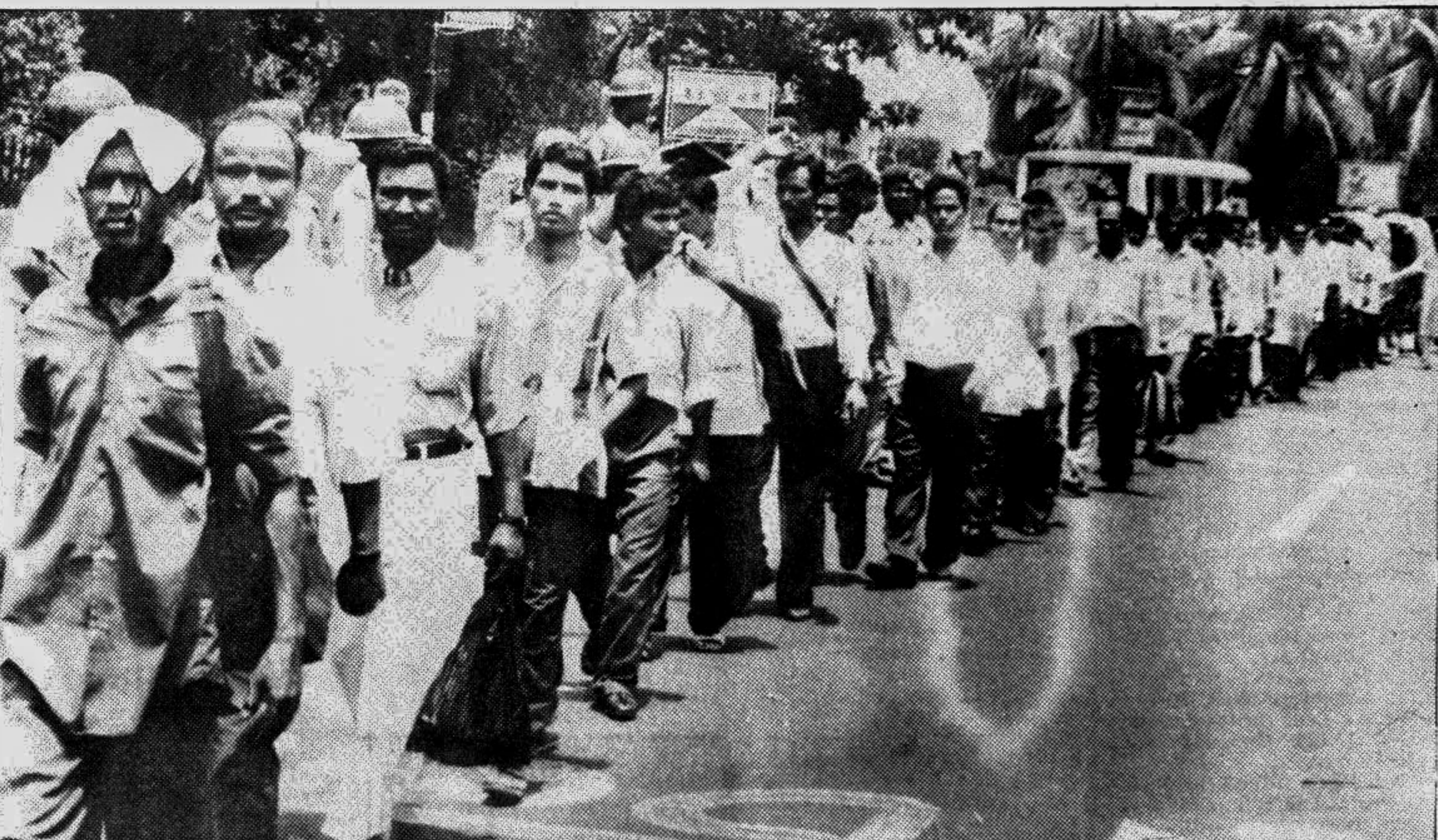
Teachers of non-government primary schools brought out a procession in the city yesterday to press home their demands and marched towards the PMO to submit a memorandum to the Prime Minister. But police intercepted the procession near the Shishu Park.