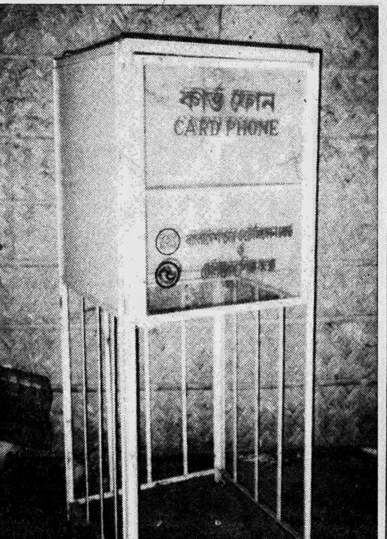
JHENIDAH: Condition of a cardphone booth at Langal-bandh Adiluddin College in Sailkupa.