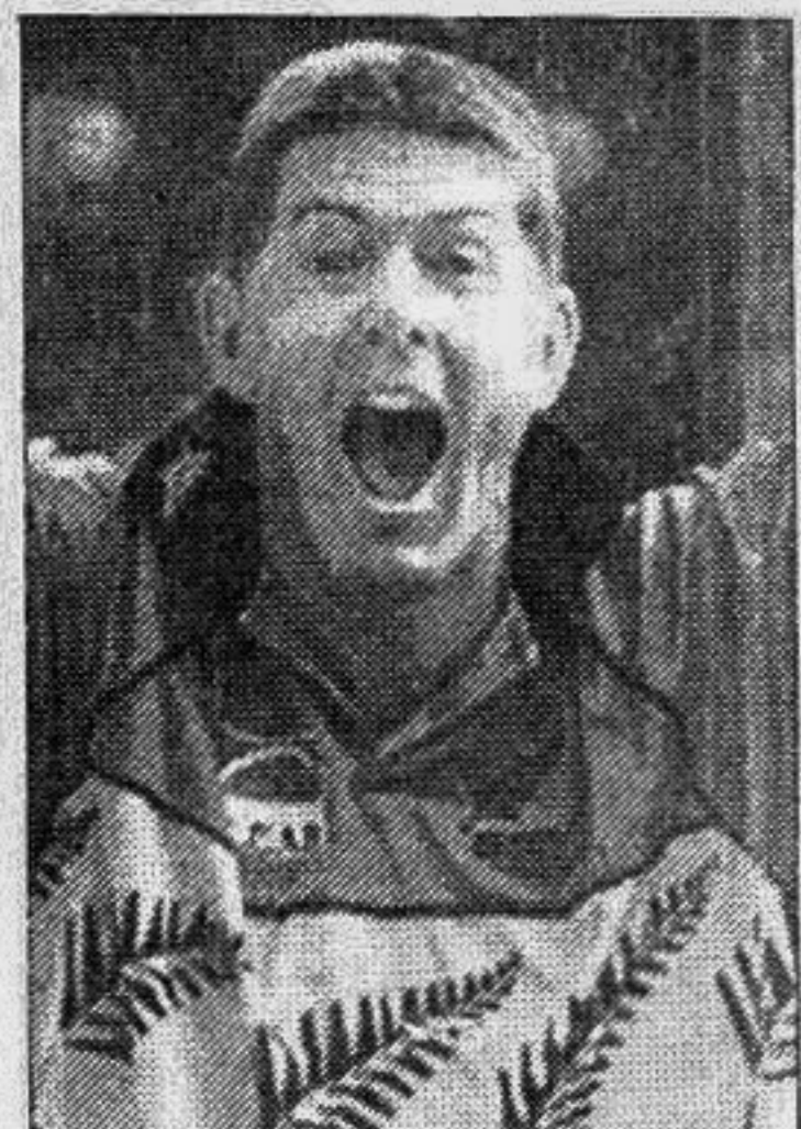
GEOFF ALLOTT (New Zealand) Man of the Match New Zealand vs Scotland