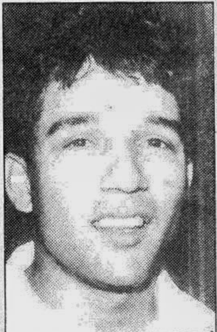
KHALED MAHMUD (Bangladesh) Man of the Match Bangladesh vs Pakistan