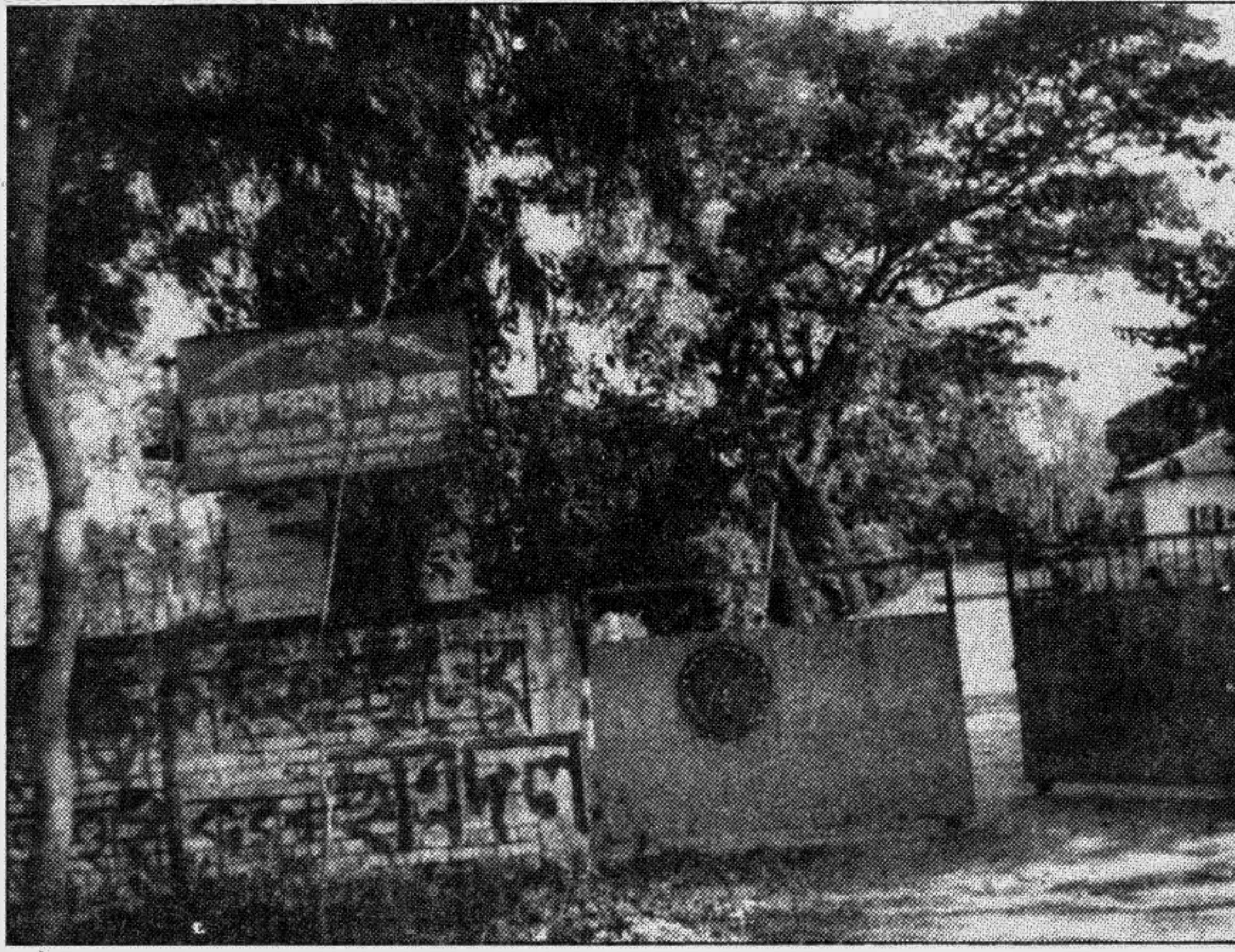
Front view of the office of Rooppur Atomic Power project in Ishurdi thana of Pabna district.

A huge amount of money is being spent every year for maintenance of the buildings and property in the project site despite the fact that those were lying abandoned for decades together.