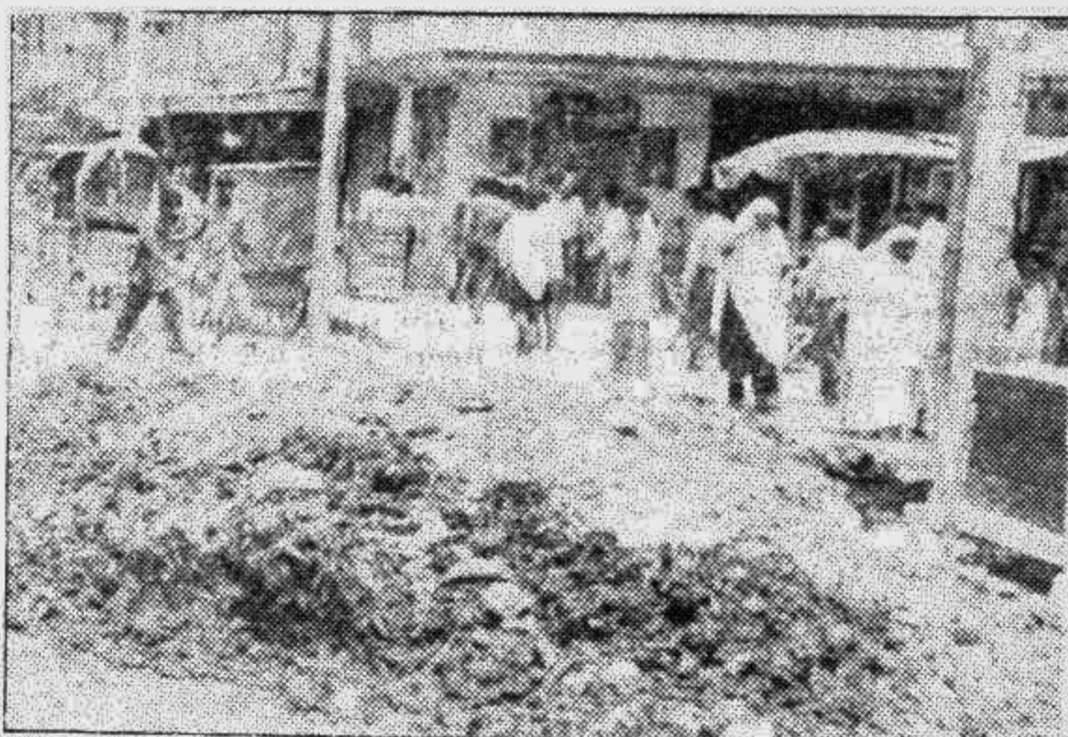
Garbagee have been dumped in Borobazaar area, a busy commercial area in Mymensingh town. These are not cleaned for days together resulting in emission of bad odour which creates health hazard for the town dwellers.

Residential and commercial areas of the town have taken an ugly look. People dump garbages which remain uncleaned for days together in Chhoto Bazaar, Boro Bazaar, Shakhari Patti, Kachua and Nulton Bazaar.