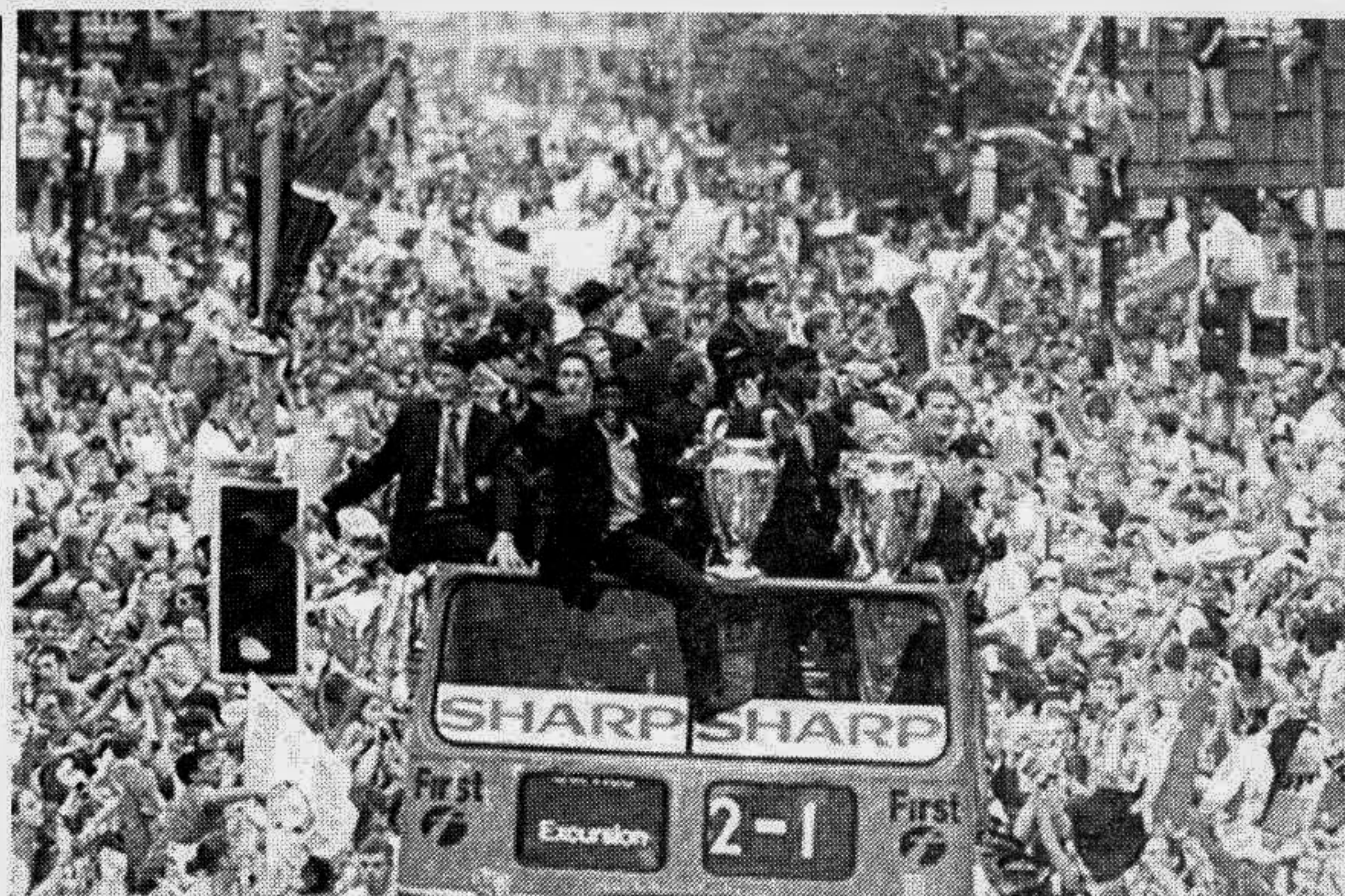
MANCHESTER WELCOMES HEROES: Players of Manchester United having a joyride on top of a double-decker through the streets of the English city after arriving from Barcelona on May 27.