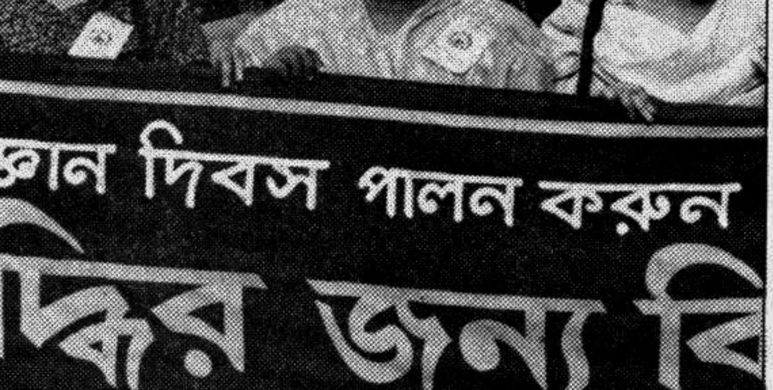
Science Club Association brought out a colourful rally in the city yesterday to mark the Science Day '99.

Speakers at the projection meeting called upon the voters to come forward unitedly with the spirit of the liberation war to defeat the reactionary forces through electing their 25 candidates.