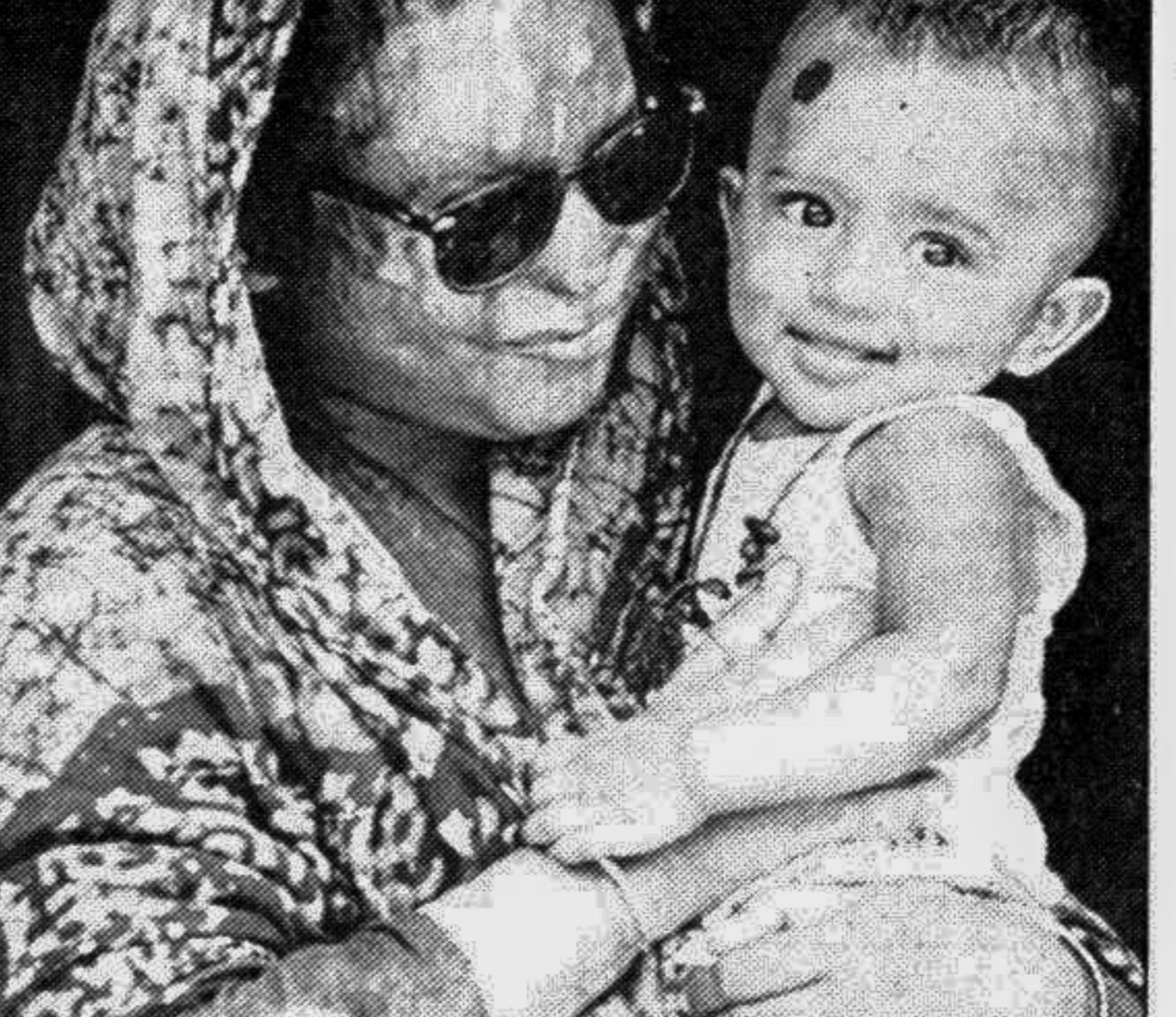
Agony and ecstasy