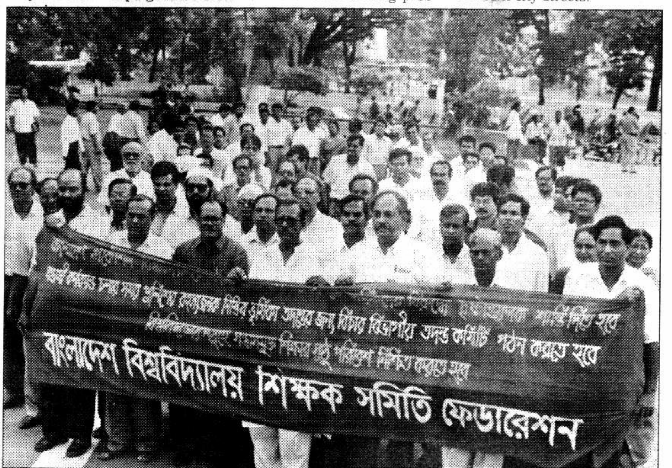
Federation of University Teachers' Associations brought out a silent procession in the city yesterday protesting the recent violence on the BUET campus.

Later, FBUTA brought out a mourning procession from the Central Shaheed Minar. Teachers' leaders from various universities took part in the procession which ended at the National Press Club and patrolling different city streets.