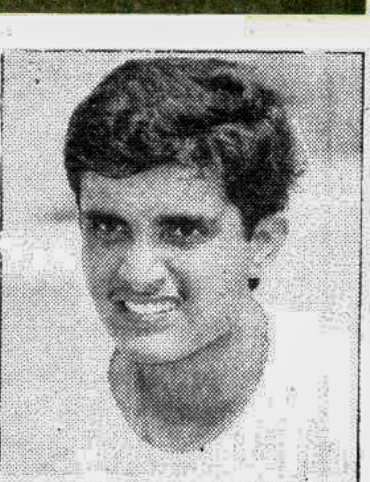
SAURAV GANGULY (India) Man of the Match India vs Sri Lanka