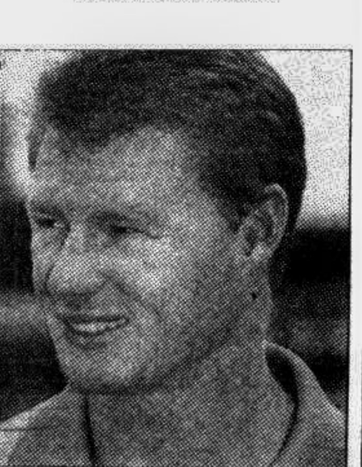
LANCE KLUSENER (South Africa) Man of the Match Kenya vs South Africa