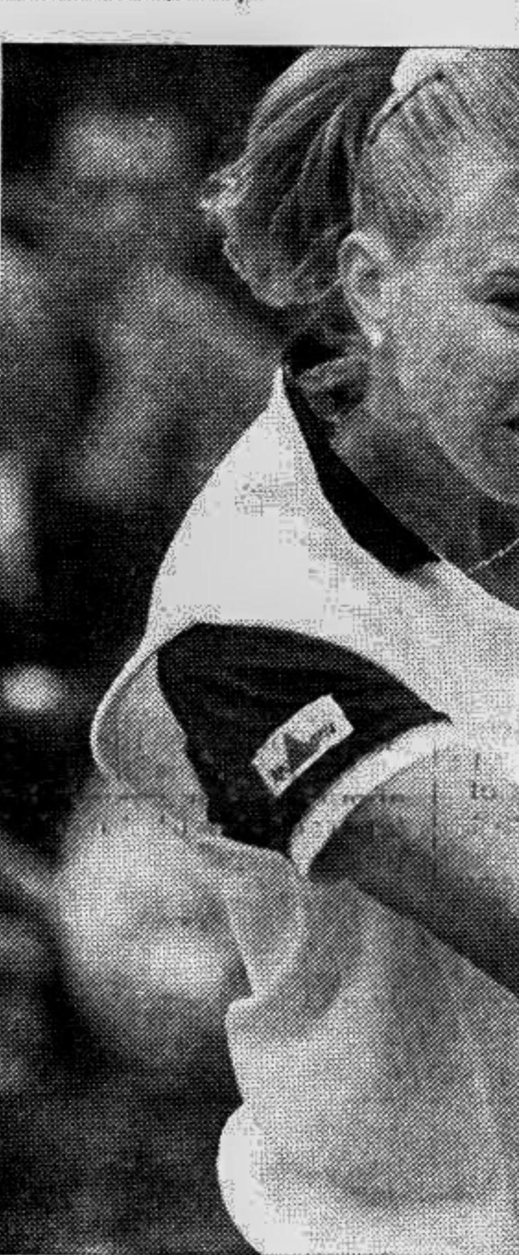
Germany's Steffi Graf plays backhand against Magdalena Maleeva of Bulgaria at the French Open in Paris yesterday. Steffi won 6-2, 6-0.

In a match between former French Open champions, Kafelnikov edged Chang 6-2, 5-7, 6-0, 7-6 (10-8).