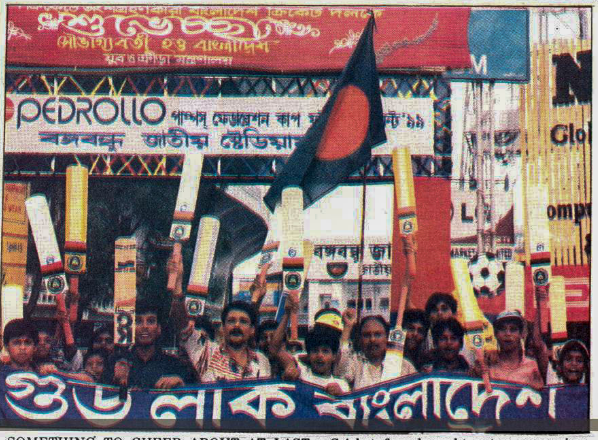
SOMETHING TO CHEER ABOUT AT LAST: Cricket fans brought out a procession around the Bangladesh National Stadium yesterday hailing Bangladesh's World Cup victory over Scotland.

Venue: Taunton. Home of county side Somerset whose former star players include such world stars as Ian Botham, Viv Richards and Joel Garner - who all played in the same side - as well as Sunil Gavaskar, Jimmy Cook, Mushtaq Ahmed, Steve Waugh and Martin Crowe. Capacity: 7,500. (AFP)