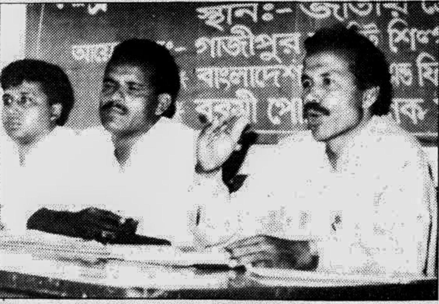
Humayun Kabir, president of Bangladesh Poultry and Fisheries Association, addressing a press briefing at the Jatiya Press Club yesterday threatening agitation against smuggling of Indian eggs.

If the local production is hampered, the market would go totally under the control of foreigners and they would gradually charge higher prices than that of local ones," one poultry leader argued.