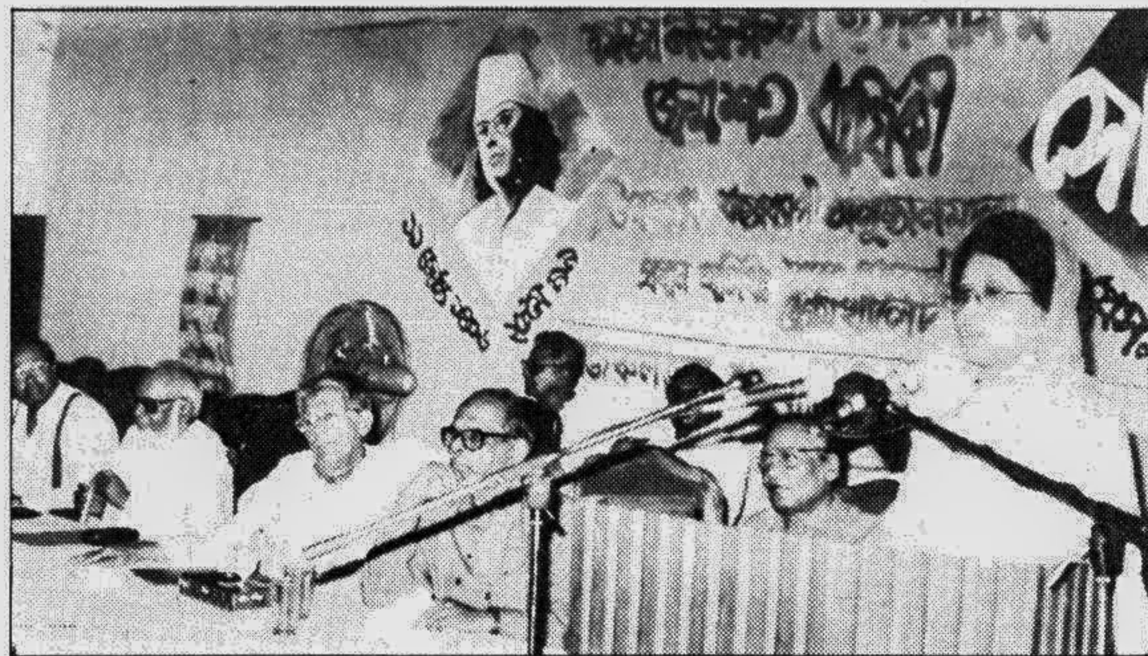
Leader of the Opposition Begum Khaleda Zia addressing as chief guest a programme at the Jatiya Press Club yesterday to mark the birth centenary of National Poet Kazi Nazrul Islam.