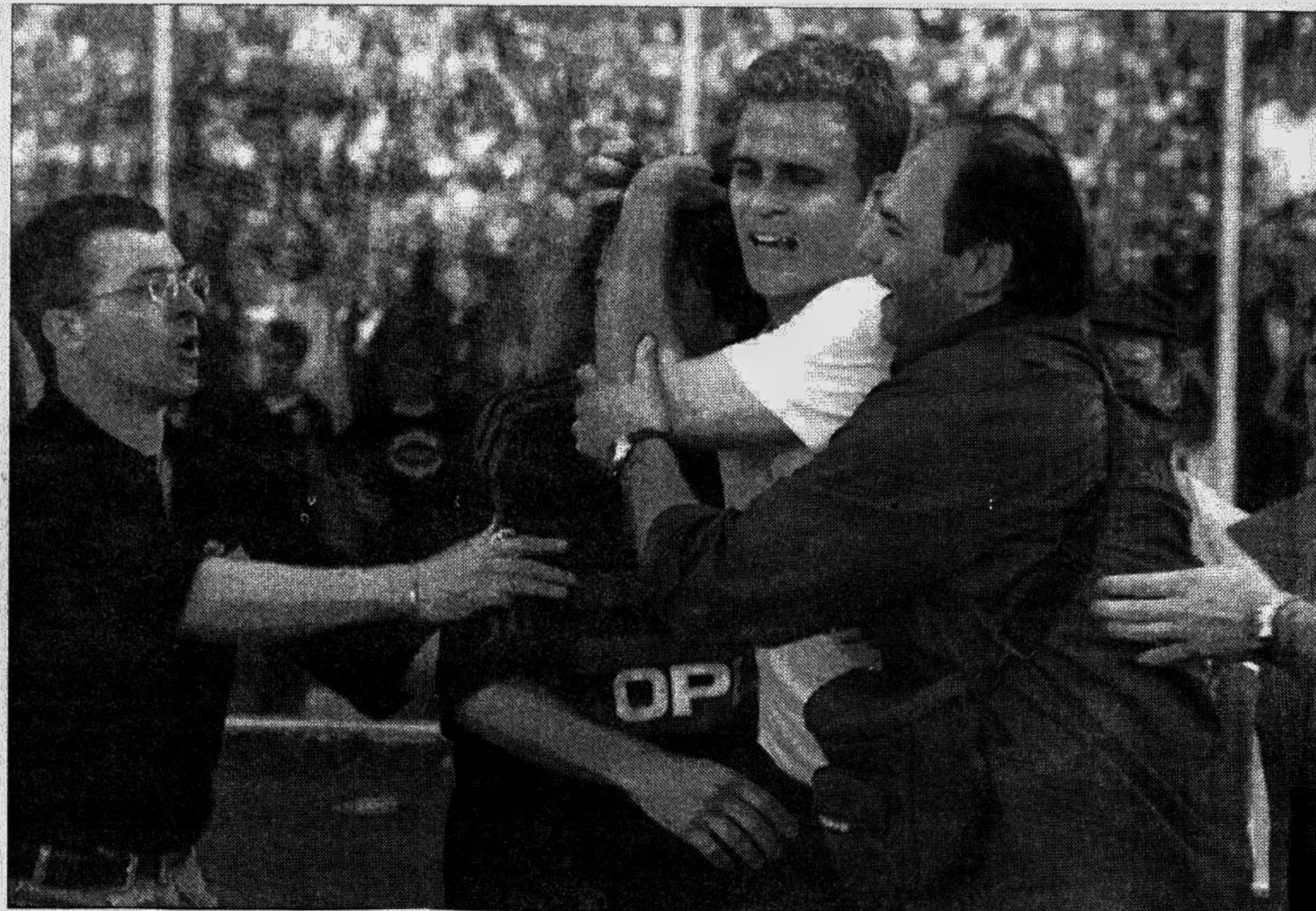
CONGRATULATIONS! AC Milan's Argentine player Andres Guglielminipietro (C), who scored the winning goal, is being hugged by teammate Oliver Bierhoff (white shirt) and fans after they defeated Perugia to lift the Serie A title for the 16th time on May 23.

Owen Hart, 33, hit his head on a turnbuckle. Hart, who wrestled under the nickname "Blue Blazer," was given cardiopulmonary resuscitation in the ring in front of the audience at Kemper Arena Sunday and then taken to a nearby hospital. It wasn't immediately clear how Hart fell, but witnesses said the cable he was connected to either broke or became disconnected. The WWF said it was investigated.