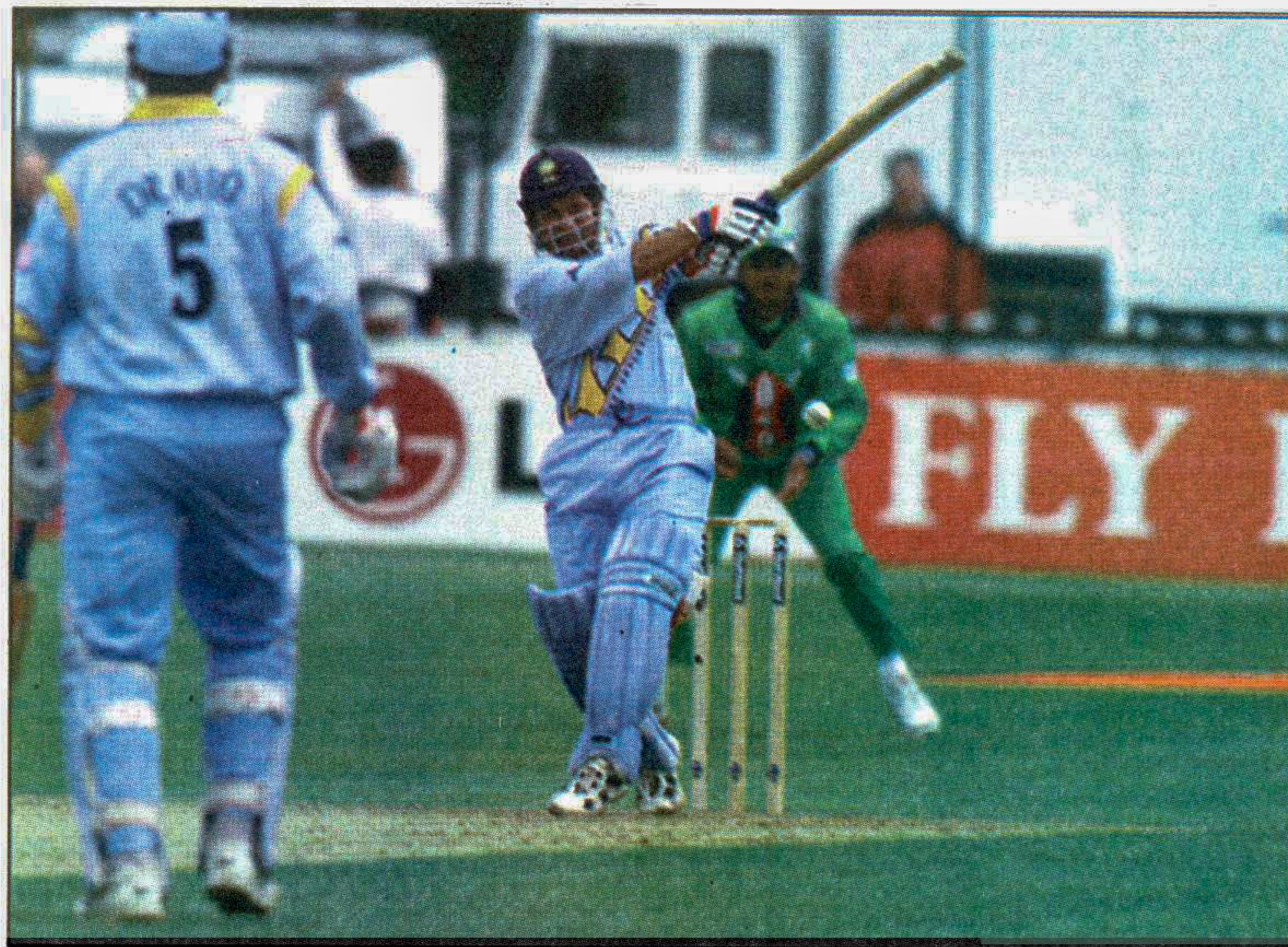
TENDULKAR THUNDER: Sachin Tendulkar in full flow against Kenya yesterday.