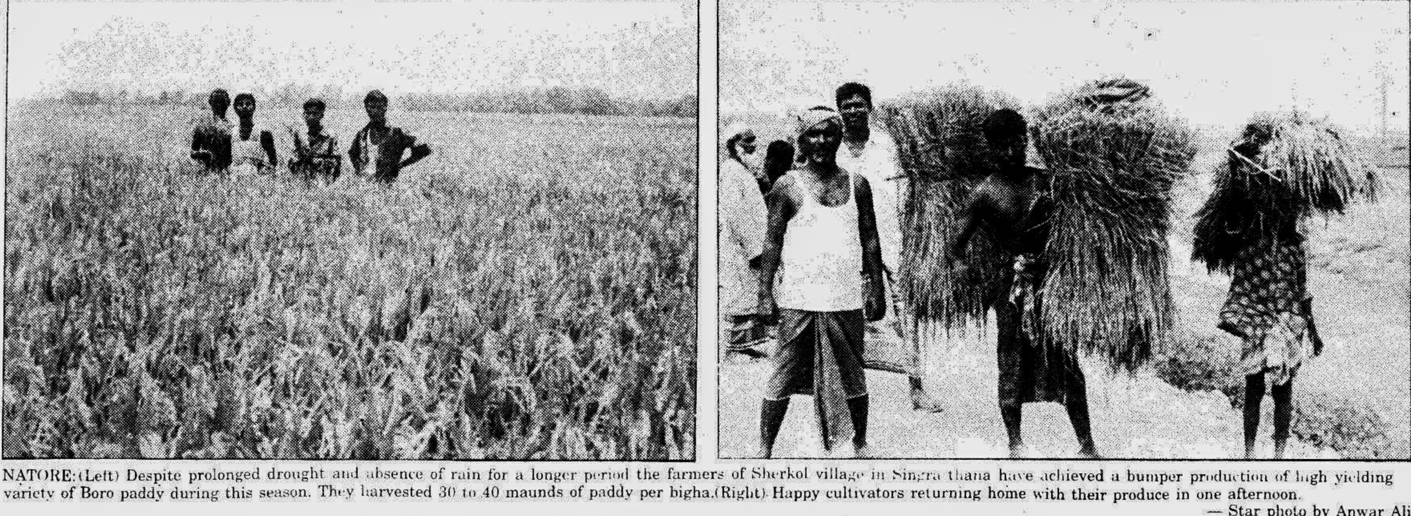
NATORE: (Left) Despite prolonged drought and absence of rain for a longer period the farmers of Sherkol village in Singra thana have achieved a bumper production of high yielding variety of Boro paddy during this season. They harvested 30 to 40 maunds of paddy per bigha. (Right) Happy cultivators returning home with their produce in one afternoon.