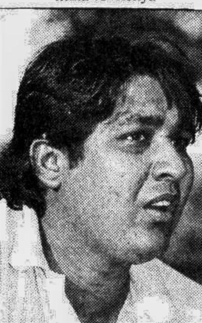
INZAMAMUL HAQ (Pakistan) Man of the Match Australia vs Pakistan