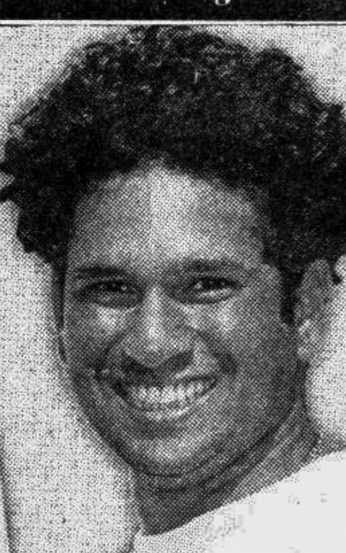
SACHIN TENDULKAR (India) Man of the Match India vs Kenya