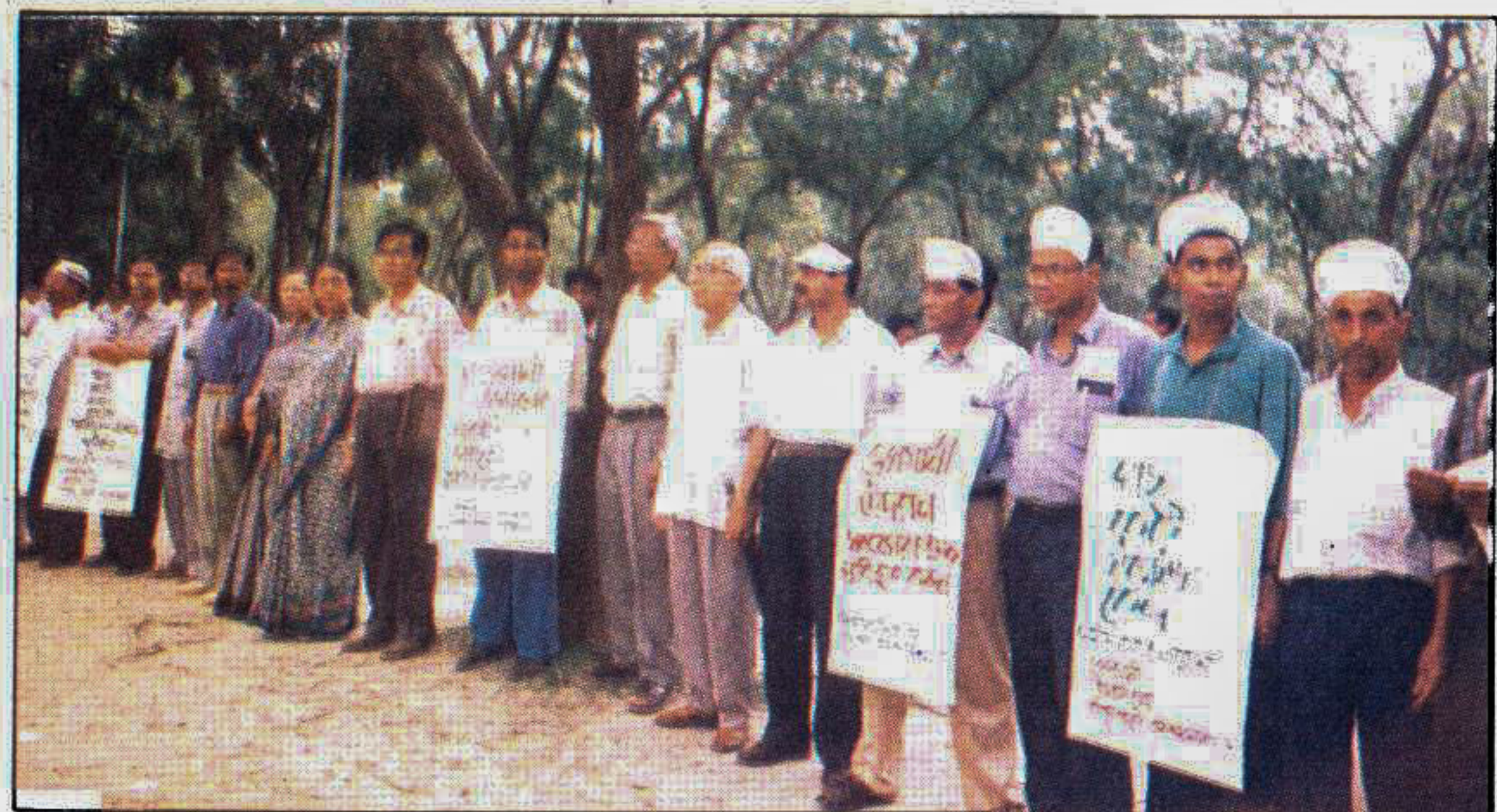
A human chain was formed at Osmany Udyan yesterday.