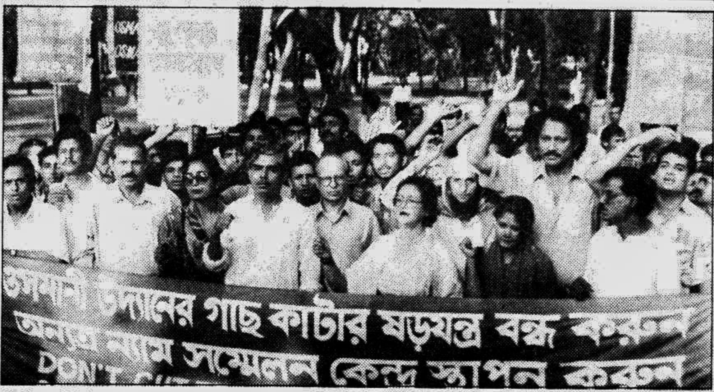
Sylhet Bibhag Unnayan Parishad brought out a procession in the city yesterday in support of their demand for shifting of the proposed site of NAM conference centre from Osmani Uddyan.

He noted that linkage between universities of different countries are must and has been found useful in keeping track of changes and innovations in the field of research, teaching and development of the faculty members.