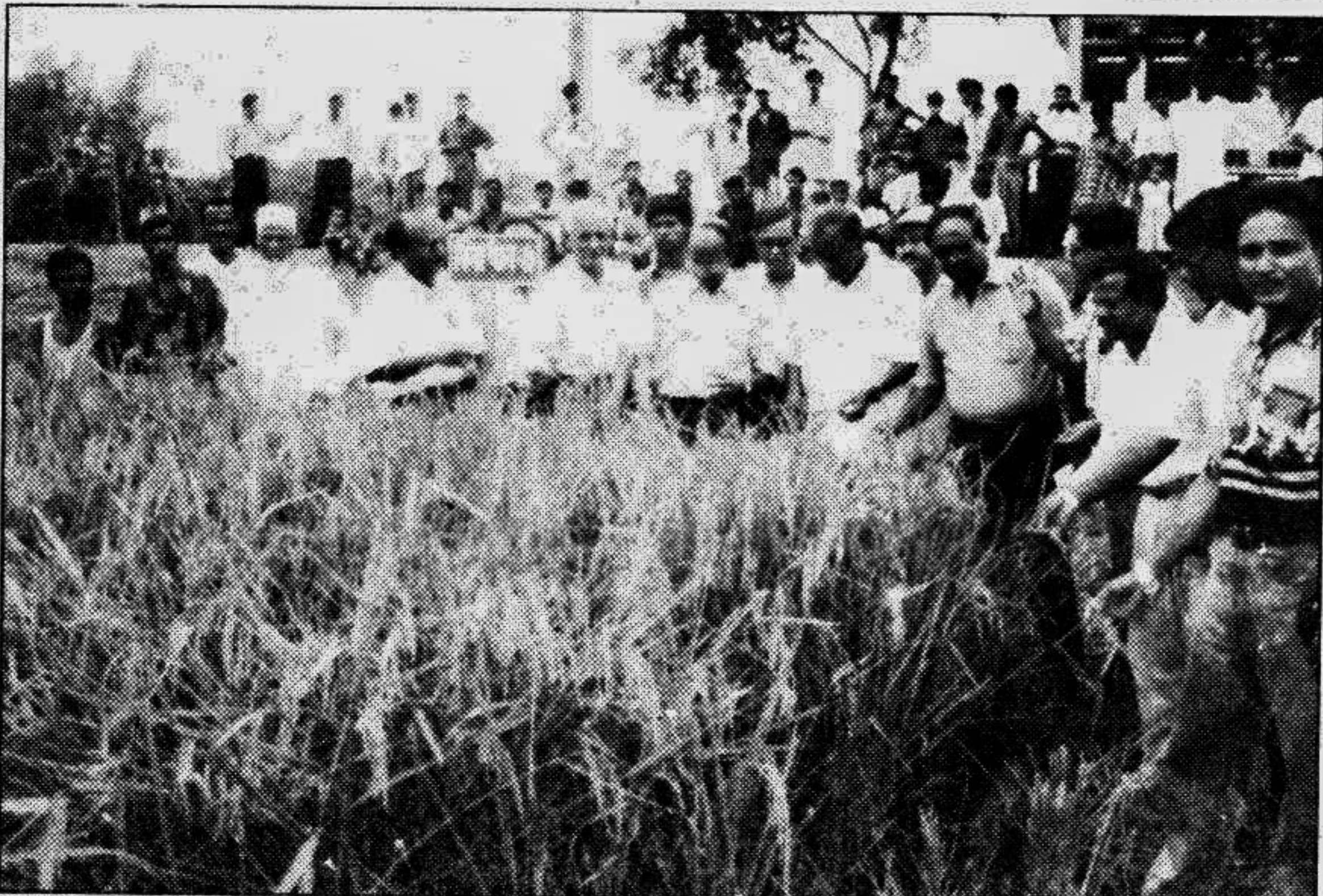
A plot of BINADHAN-6, the latest high yielding variety (HYV) of paddy which has been invented by Bangladesh Institute of Nuclear Agriculture (BINA). Farmers have produced 120 maunds of paddy from one acre of land. This photo was taken recently from Mymensingh area.

But the people alleged, for want of proper maintenance, many things relating to his memory including the banyan tree, the house where Nazrul lodged are about to destroy.