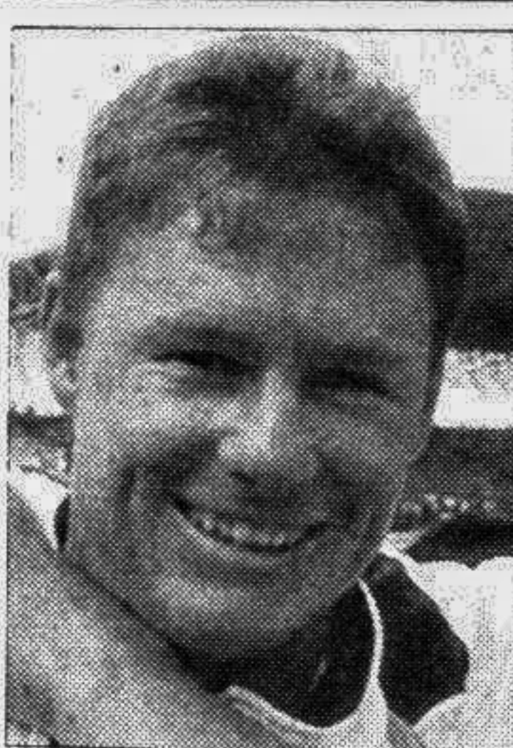
LANCE KLUSENER (South Africa) Man of the Match South Africa vs England