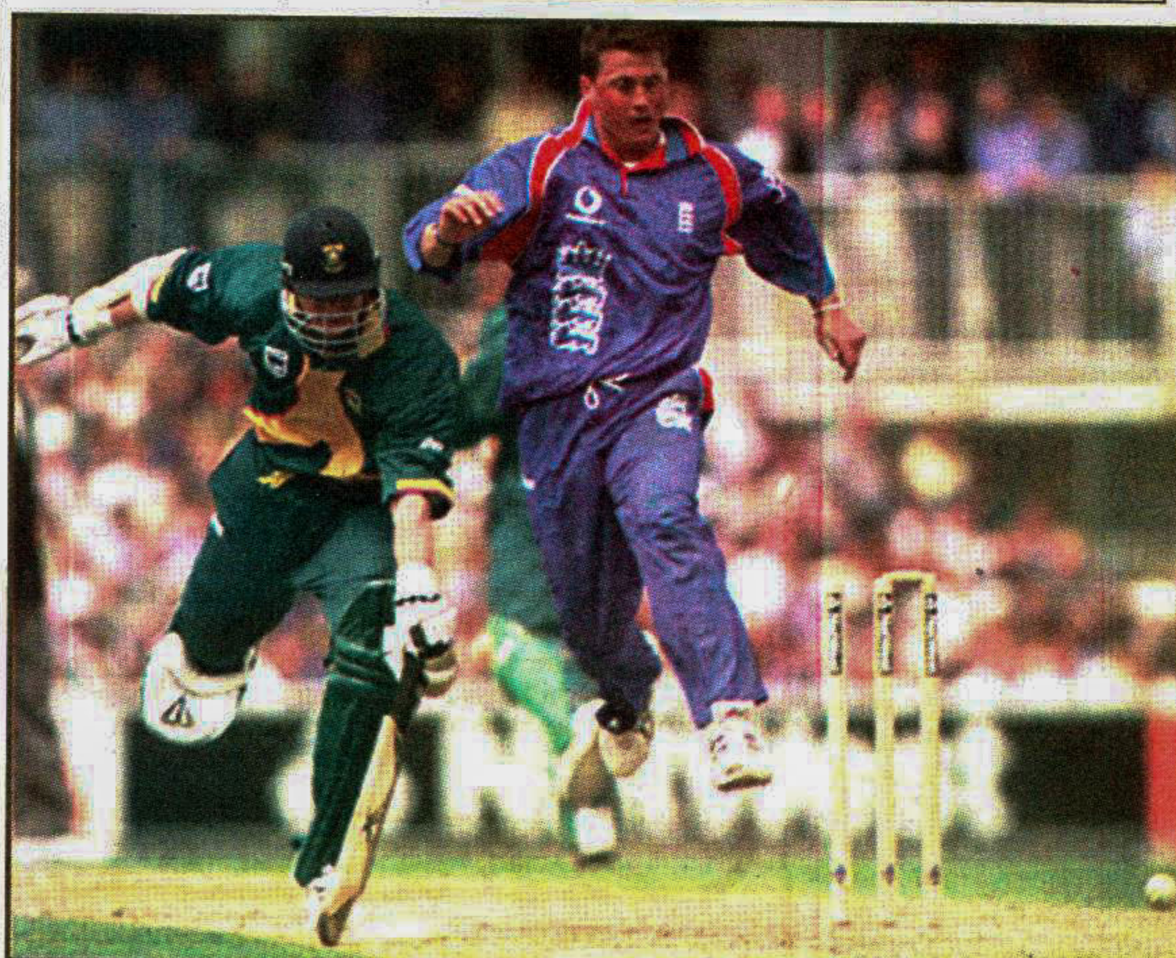
GREAT GOAL! England paceman Darren Gough kicks the ball on to the stumps in a desperate attempt to run out South African all-rounder Lance Klusener during their Group A clash at the Oval yesterday.