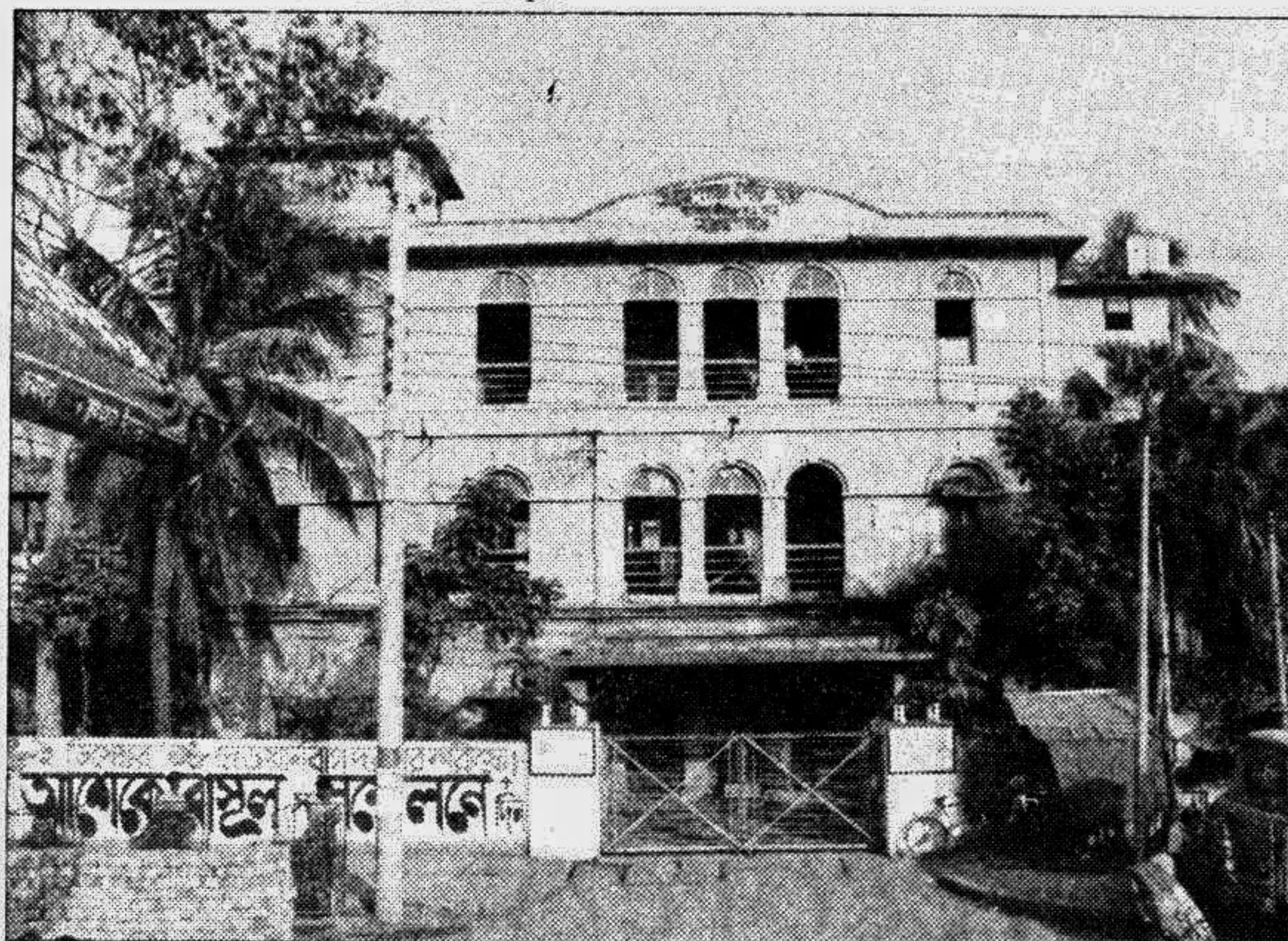
Front view of Narayanganj Poursabha