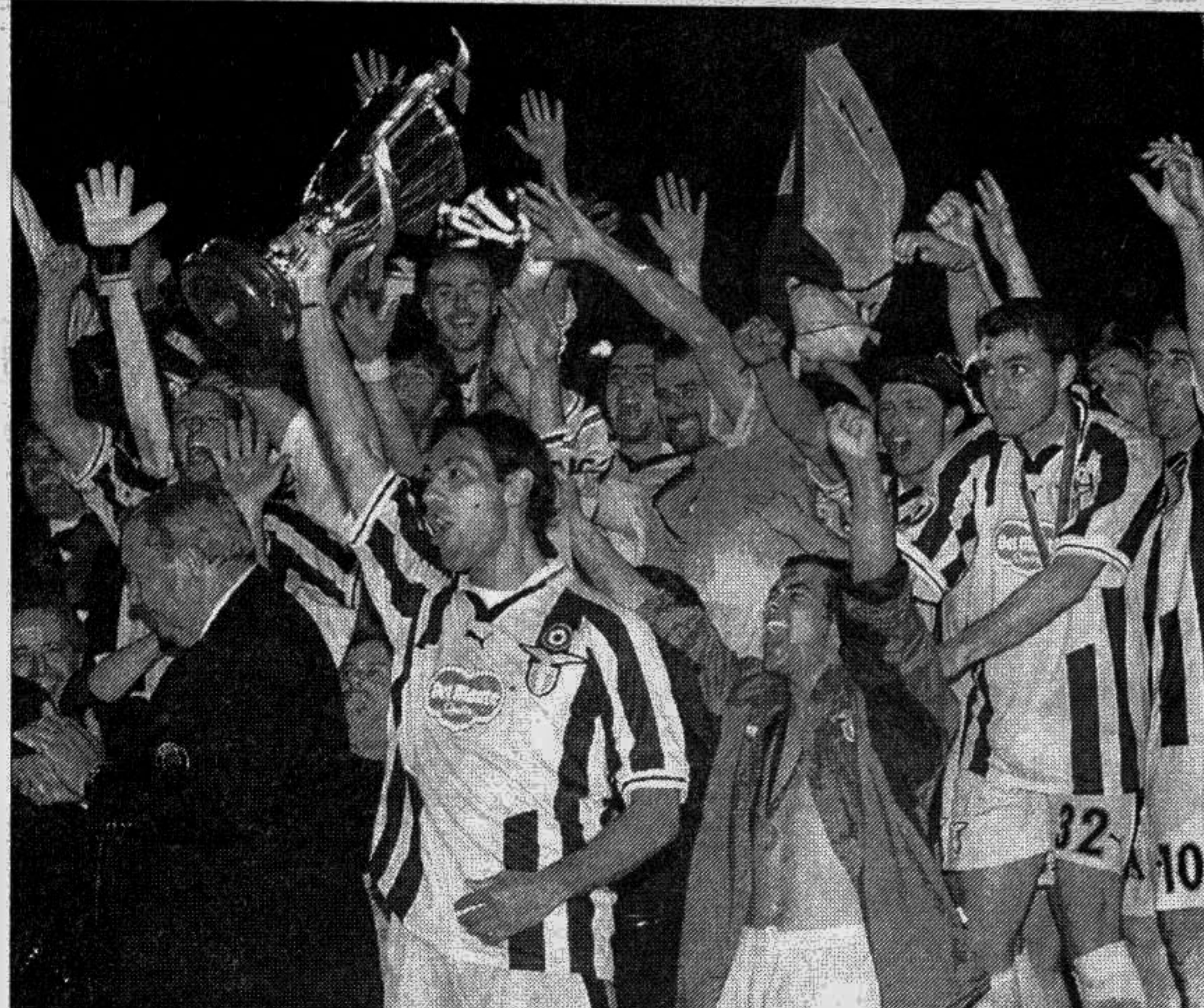
Lazio captain Alessandro Nesta holds up the Cup Winners' Cup after the final against Real Mallorca at Villa Park, Birmingham on May 19.