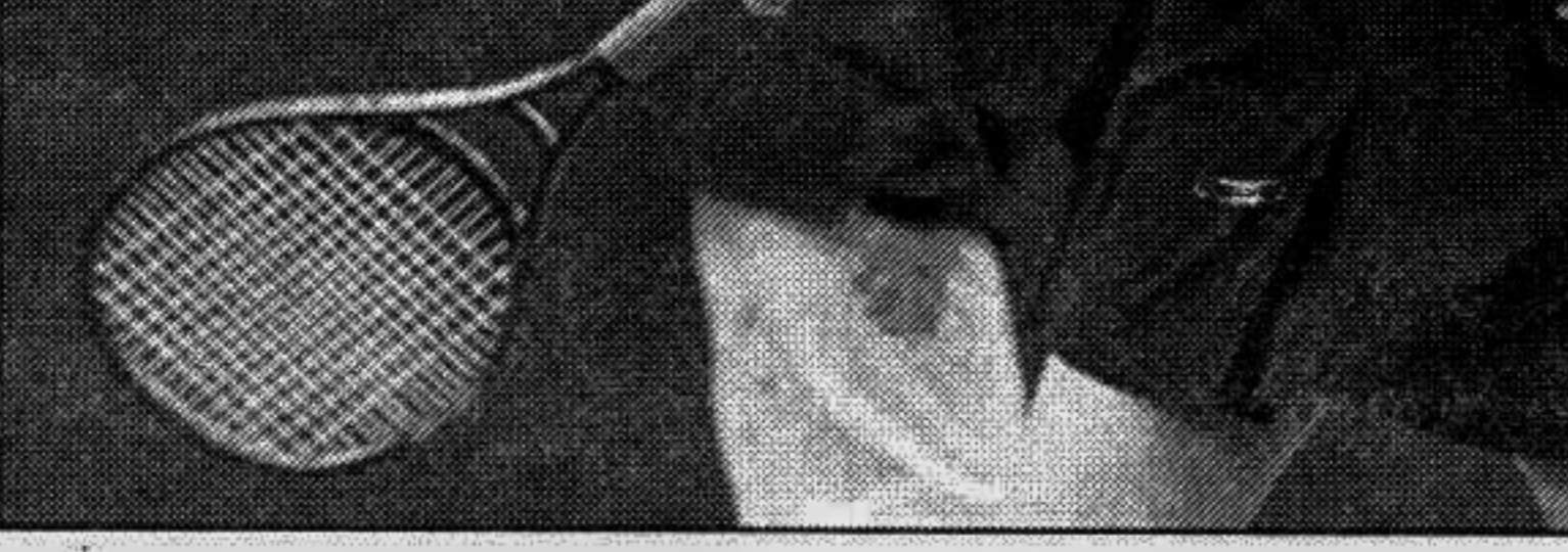
American Amy Frazier in action at the Madrid Open yesterday.